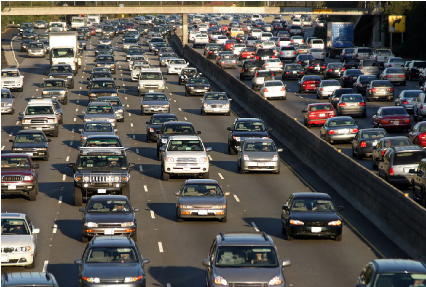
Transportation (SB 743)