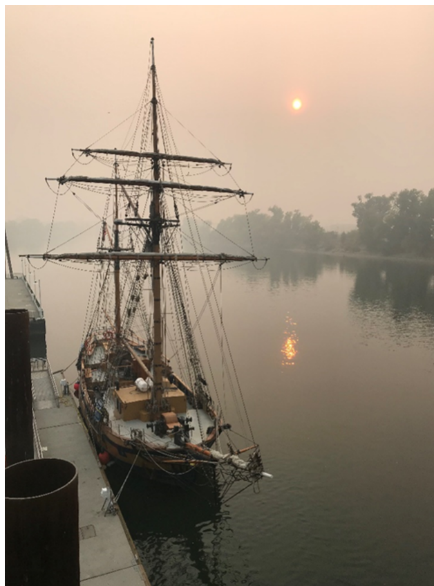
Poor air quality envelops the Sacramento region as shown in this picture of the Tower Bridge dock on the Sacramento River. Photo taken at 3:30PM on November 15, 2018.