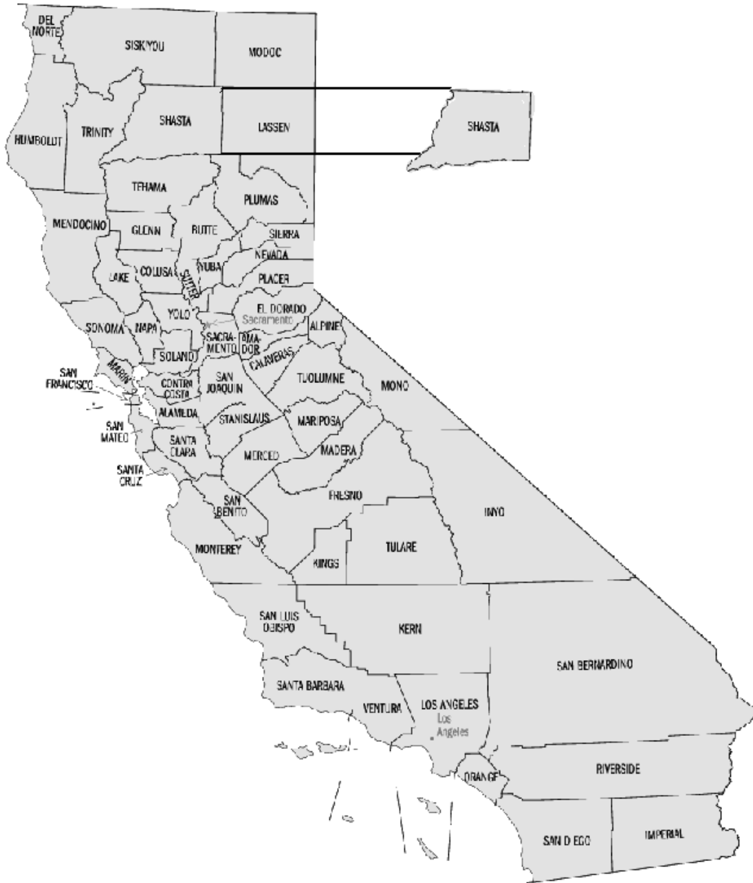
Figure 3-1 Shasta County Air Quality Management District Boundaries