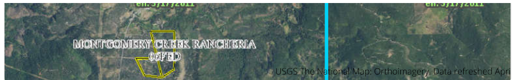
USGS The National Map: Orthoimagery. Data refreshed Apr