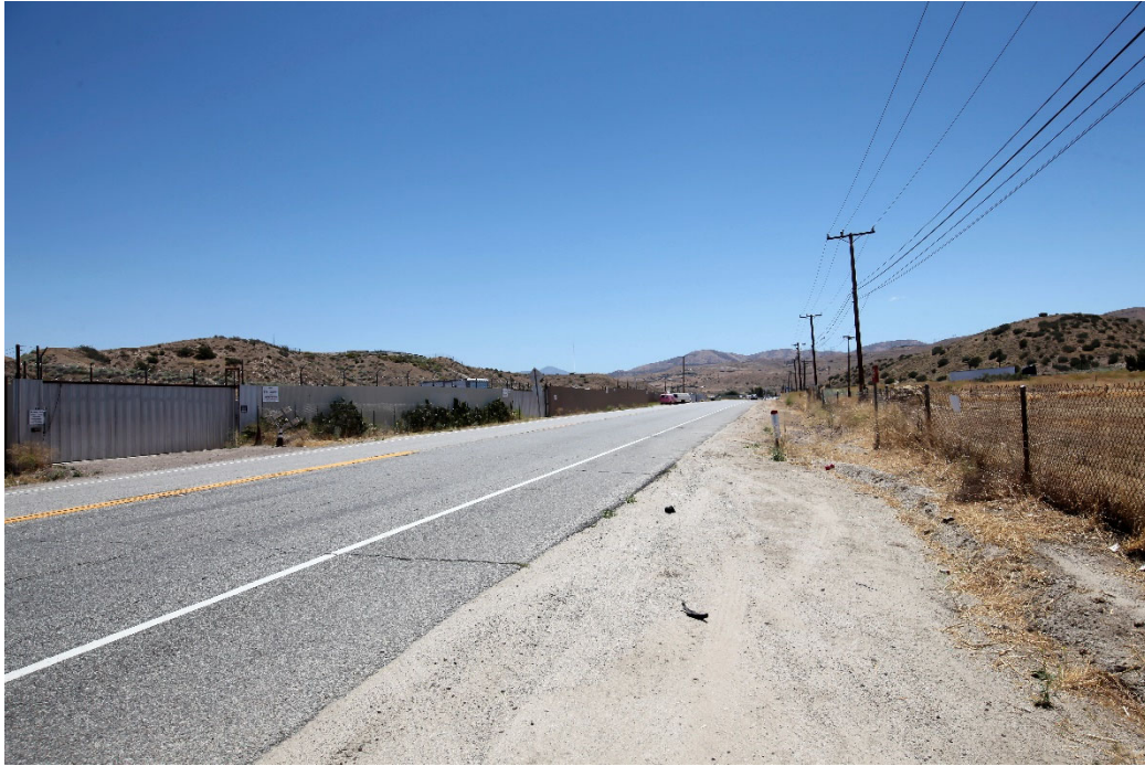
a. Existing View: View looking south along Sierra Highway, just north of where the California Aqueduct (Soledad Siphon) crosses under the roadway. Sparse development can be seen along both sides of the highway, with undeveloped land and the San Gabriel Mountains forming the backdrop.