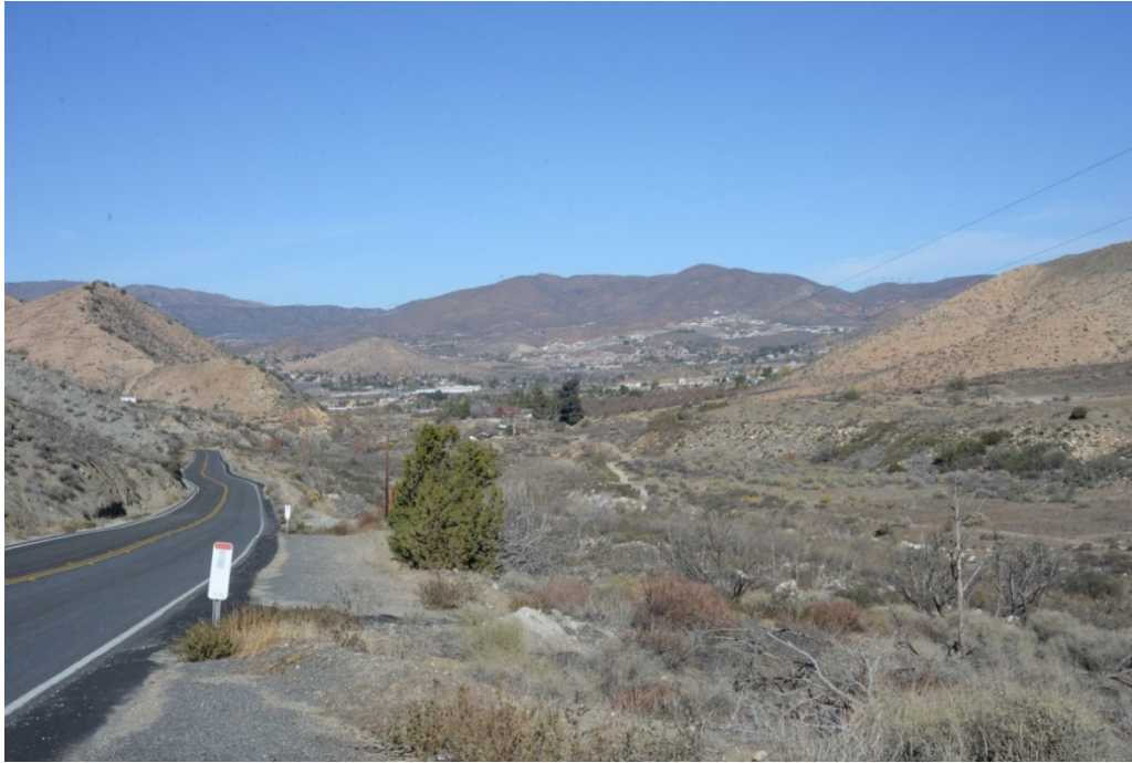
a. Existing View: View to the north from Aliso Canyon Road toward Blum Ranch. Aliso Canyon Road winds through a relatively undeveloped landscape and some scattered development in the background surrounded by hills, offering moderate visual quality to travelers.