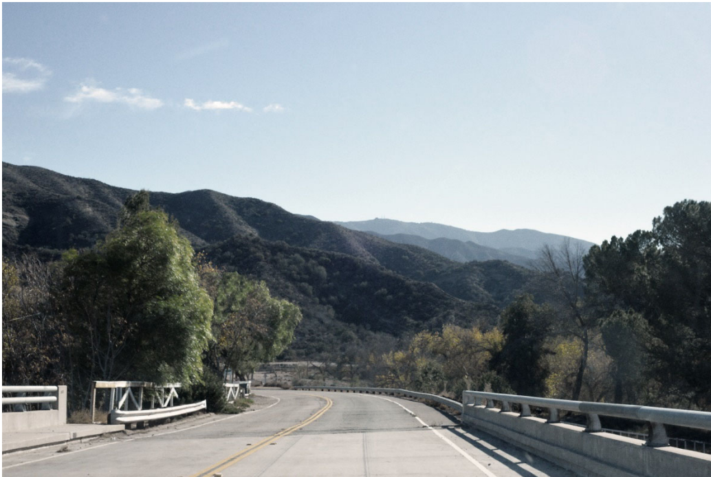
a. Existing View: View to south on Agua Dulce Canyon Road. Hillsides and ridgelines covered with low-lying vegetation form a scenic backdrop to the paved roadway. The combination of natural and infrastructure elements offers a moderate visual quality to travelers on the roadway.