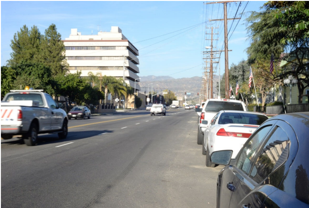
a. Existing View: View to the northeast from Sheldon Street near El Dorado Avenue. An inconsistent mix of residential and commercial uses, with indistinctive architectural style offer low visual quality to the roadway travelers, and nearby residents and workers.