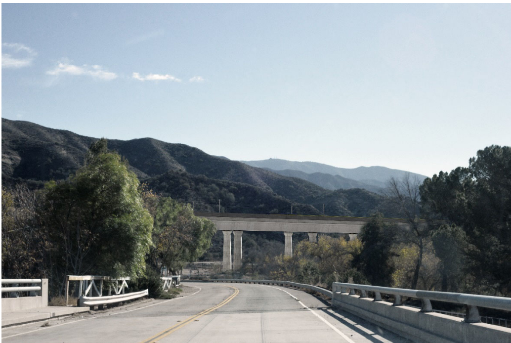
b. Simulated View: The project would introduce vertical support columns and a horizontal overcrossing spanning Agua Dulce Canyon Road, introducing an element of the project environment that would be out of scale with the existing visual character, reducing project coherence. The partial obstruction of mountain views for travelers on the roadway would partially obstruct views of the mountains in the background, reducing the existing natural harmony. The overall degree of change to visual quality would be adverse.