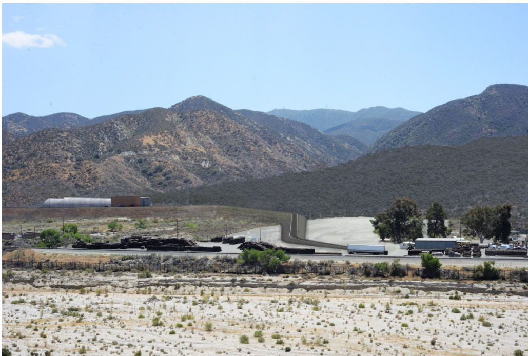
b. Simulated View: The project would introduce an elevated bridge, box-like structures, and tunnel portals in the background. If the project were to remove some of the existing heavy machinery and restore the landscape as shown in the above simulation it would increase the existing cultural order and natural harmony. Overall, the degree of change to visual quality would be neutral.