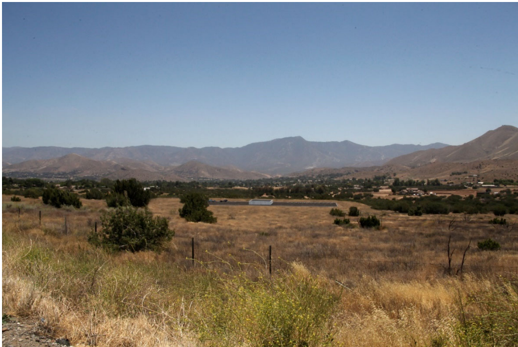
b. Simulated View: Visible project components would only include an intermediate window for access and tunnel ventilation, appearing as a small industrial-style building in the distance. The project would not change the existing natural harmony or cultural order of the view. The overall degree of change to visual quality would be neutral.