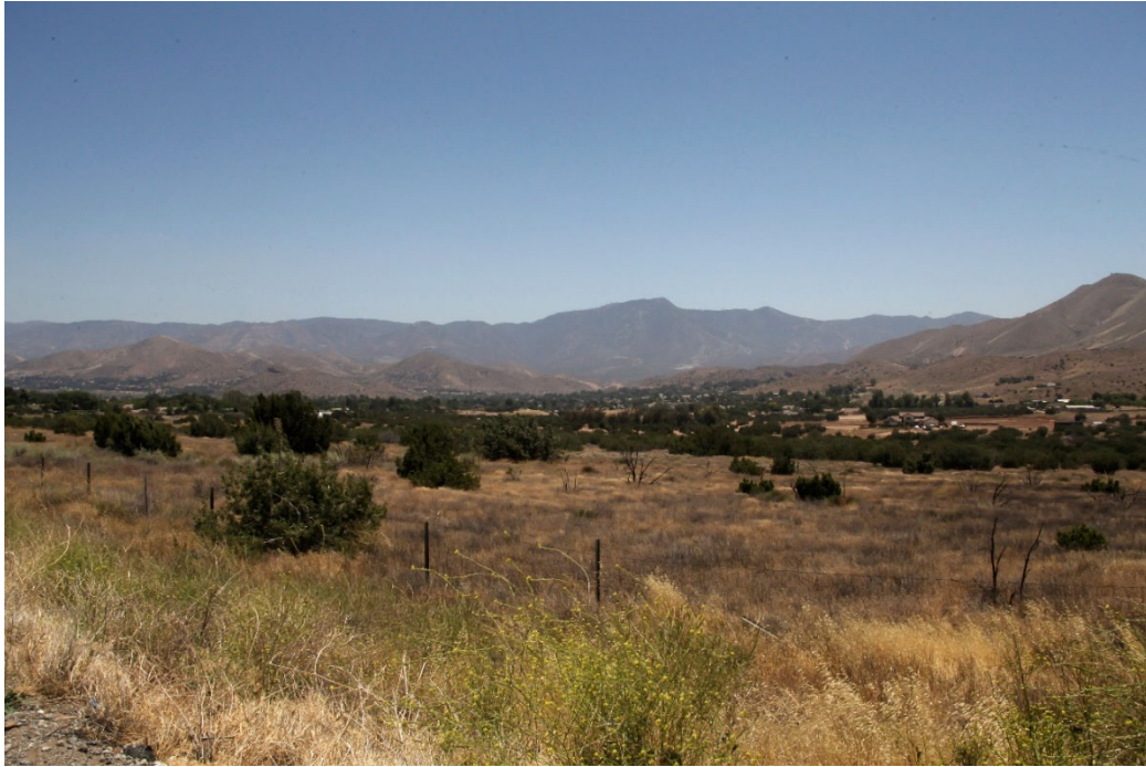
a. Existing View: Views looking south/southeast along SR 14 towards the community of Acton. The view is rural with shrub vegetation and sparse residential development in the distance and the San Gabriel Mountains forming the background.