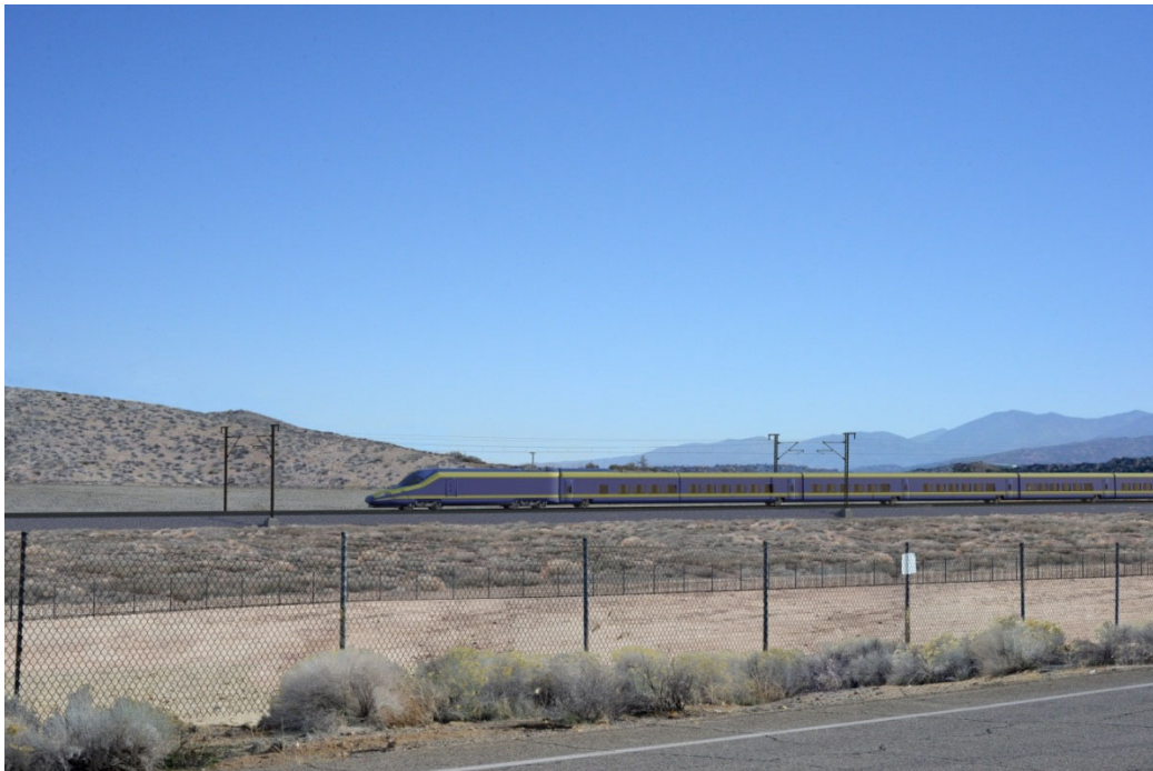
b. Simulated View (Refined SR14, E1, and E2 Build Alternatives): The project would replace Una Lake and its surrounding vegetation with at-grade tracks. Project features would substantially diminish the natural harmony of the existing visual character and have an overall adverse degree of change to visual quality.