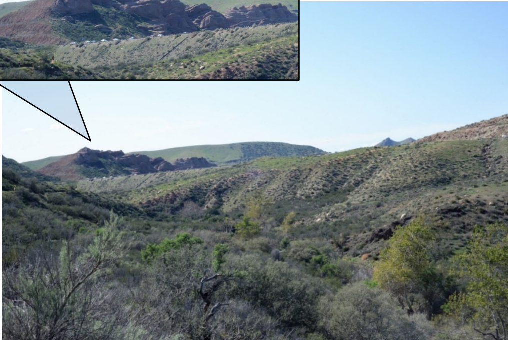
a. Existing View: View to the west from the Pacific Crest Trail (PCT) south of SR-14. Green rounded mountains covered with vegetation paint a vivid view for hikers on the PCT. Cars traveling on SR-14 are visible in the distance (see inset). The angular rock outcroppings associated with Vasquez Rocks offer a moderately high visual quality.