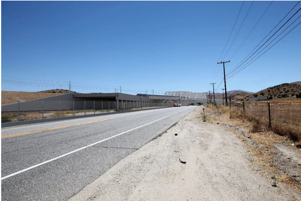
b. Simulated View: The project alignment would cross over Sierra Highway on an elevated viaduct, introducing an element of the project environment that would be out of scale with existing visual character, reducing project coherence. The viaduct would be highly visible to motorists and nearby residents, reducing the natural harmony by blocking distant views including those of the San Gabriel Mountains. The overall degree of change to visual quality would be adverse.