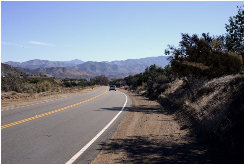
a. Existing View: View to the southeast from Escondido Canyon Road. The flat, paved, grey road lined with vegetation, infrastructure elements, and the picturesque backdrop together offer a moderate visual quality to travelers along the roadway.