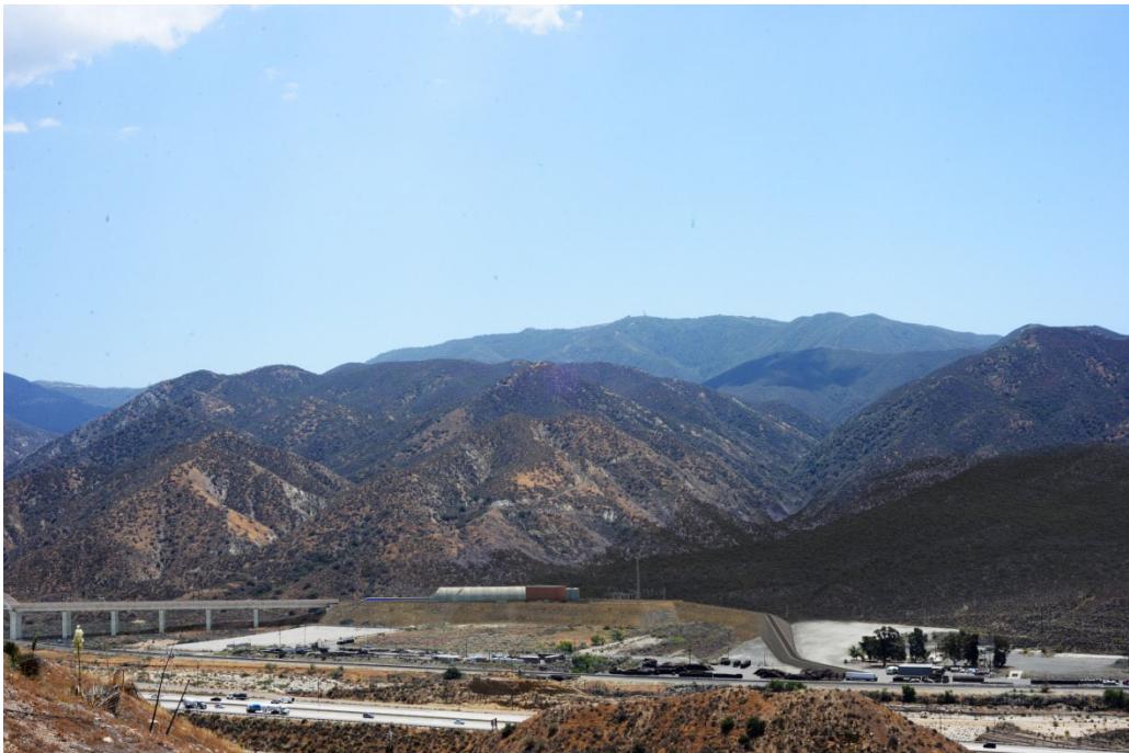
b. Simulated View: The project would add a horizontal bridge with intermediate vertical piers, tunnel portals, and rectangular structures that would augment the existing infrastructure, reducing the existing natural harmony,. The overall degree of change to visual quality would be neutral.