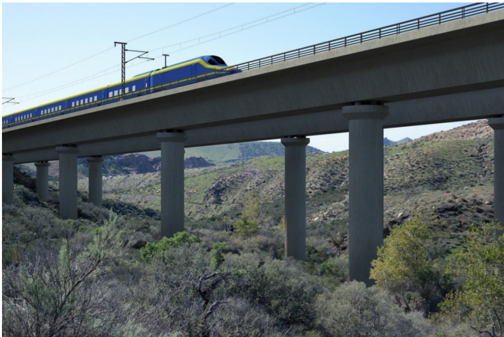
b. Simulated View: The project would introduce a dominant rectangular structure with vertical support columns over the PCT, that would be out of scale with existing features and would block views of the mountains substantially changing the visual character of the setting and reducing the natural harmony. The overall degree of change to visual quality would be adverse.