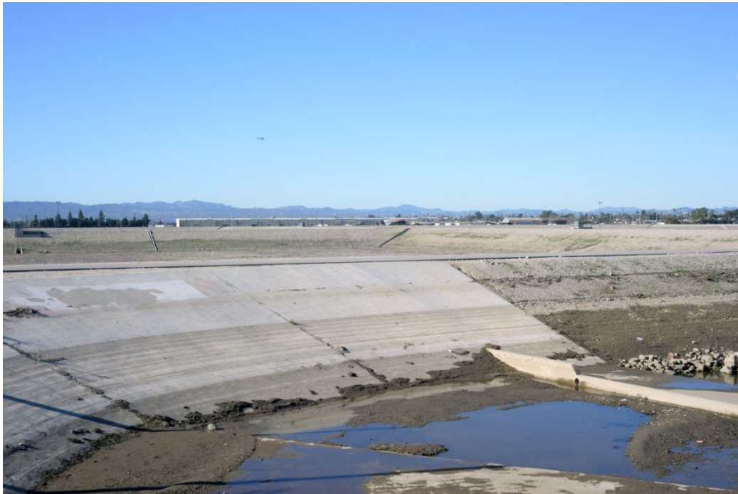
a. Existing View: View to the southwest from Glenoaks Boulevard. The view is dominated by the Hansen Spreading Grounds with its slanting striated cement surface, water and a mix of dirt and rock and a mix of irregular buildings, vegetation, and utility poles in the background. The view offers low visual quality to roadway travelers and nearby workers.