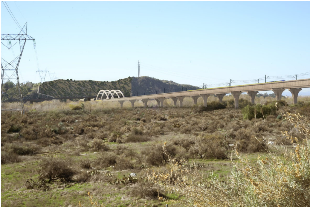
b. Simulated View: Project features including the elevated viaduct, support columns, and tunnel portals would reduce the natural harmony of the view with large scale transportation infrastructure. Overall, the degree of change to visual quality would be adverse.