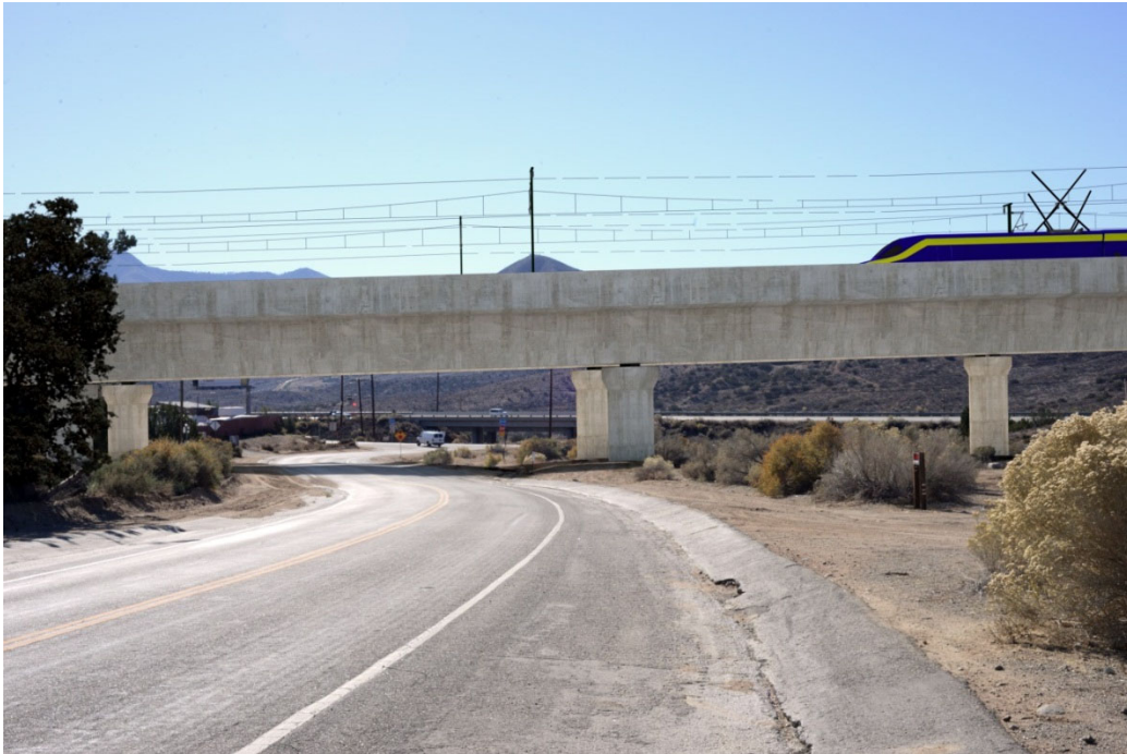
b. Simulated View: The project alignment would cross over Red Rover Mine Road, introducing a structure that would be out of scale with the existing visual character (reducing project coherence) and obstructing the view of the mountains (reducing natural harmony). The overall degree of change to visual quality would be an adverse change.