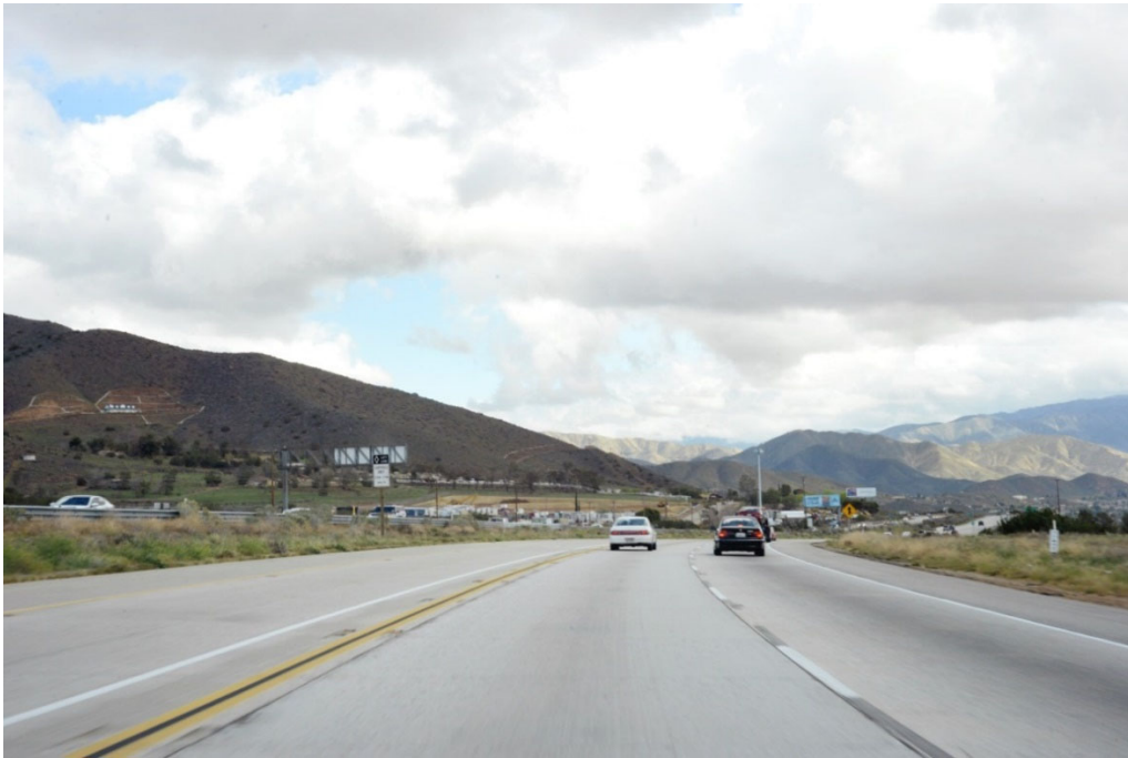
a. Existing View: View to the southeast between Ward Road and Red Rover Mine Road on the SR-14. Transportation infrastructure dominates the view with asymmetrical ridgelines of the Sierra Pelona and San Gabriel Mountains contributing to a picturesque background. Together they offer moderate visual quality to the travelers along SR-14.