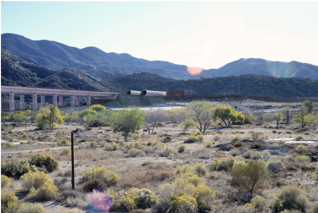
b. Simulated View: The project would add a bridge with intermediate piers, tunnel portals, and box like structures, that would be out of scale with the existing setting; however, the project scale would not interfere with the views of the mountainous backdrop and would not reduce the existing natural harmony. The overall degree of change to visual quality would be neutral.