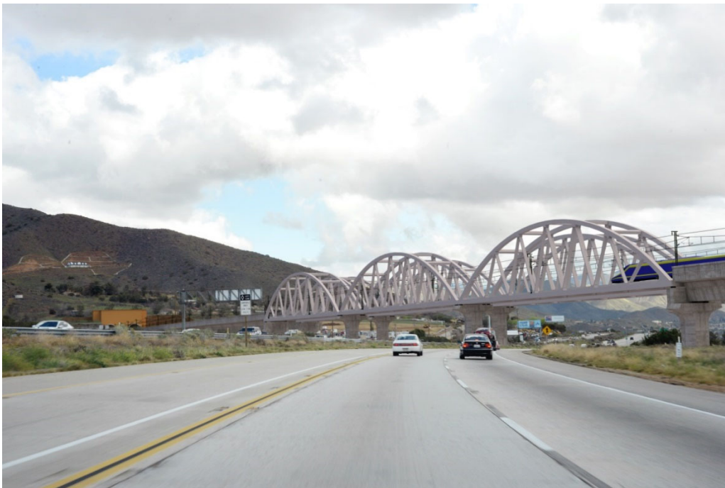
b. Simulated View: The project alignment would travel on an overcrossing over SR-14, partially obstructing the view to the mountains. While the overcrossing would be out of scale with the existing transportation infrastructure it would be visually compatible with the visual character existing transportation infrastructure. However, at this location the structure would block mountain views of motorists and reduce the existing natural harmony, having an overall adverse degree of change to visual quality.