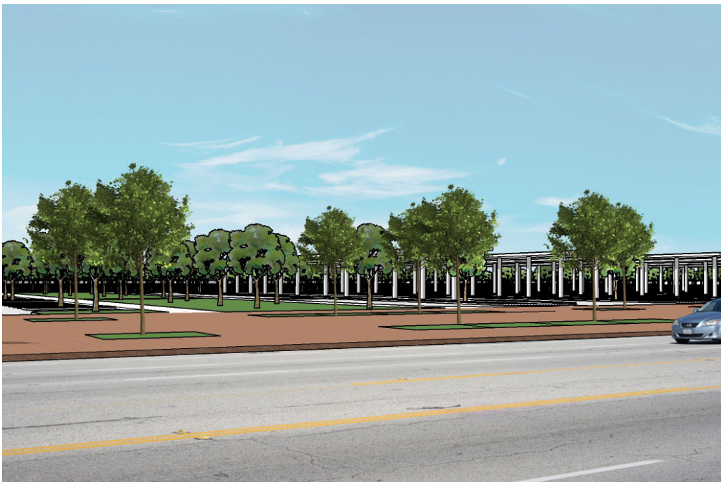
b. Simulated View: The project would add a parking lot and transit center along North Hollywood Way, as well as enhanced landscaping throughout, which would increase cultural order and natural harmony. Overall, the degree of change to visual quality would be beneficial.