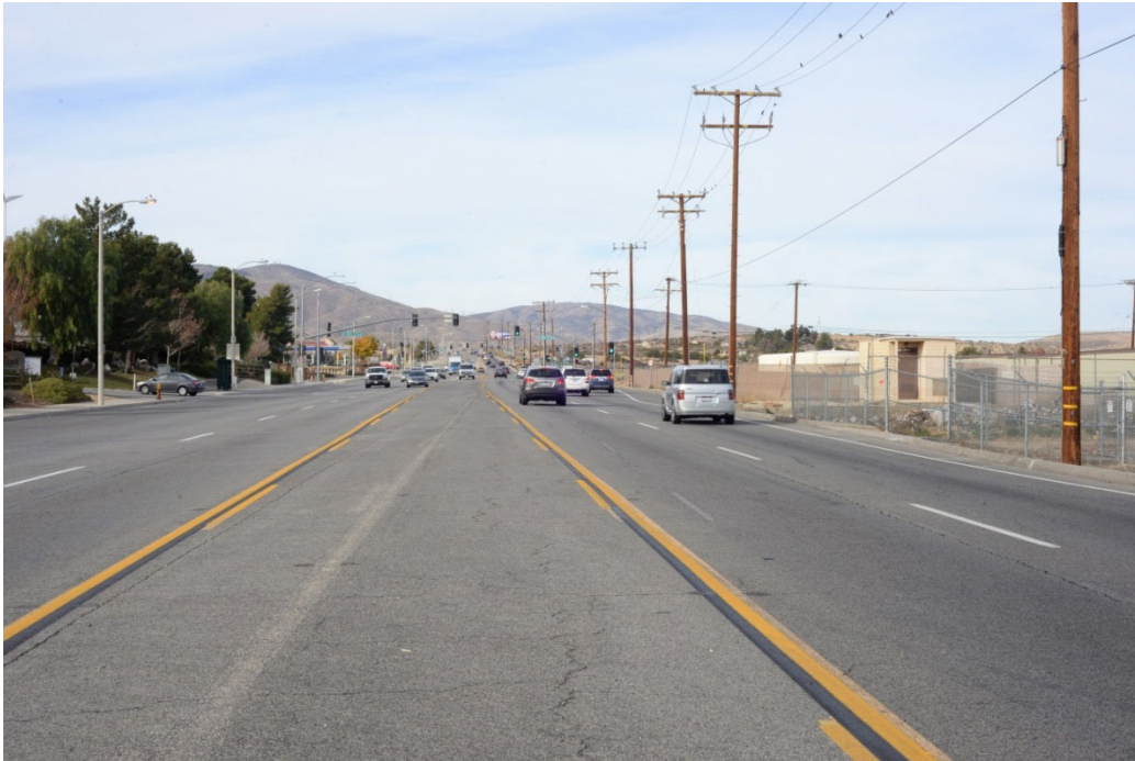
a. Existing View: View to the west along East Avenue S. Transportation infrastructure, vacant lots, and a mix of residential and commercial developments are located along the flat, grey roadway. The view offers moderately low visual quality to nearby travelers, residents, and workers.