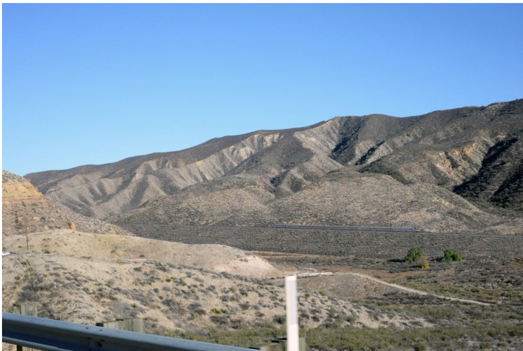
b. Simulated View: An at-grade rail bed would be constructed on an embankment, elevating the height of the at-grade profile relative to existing conditions. Project features would blend in the existing setting and would not diminish the existing natural harmony. Overall, the degree of change to visual quality would be neutral.