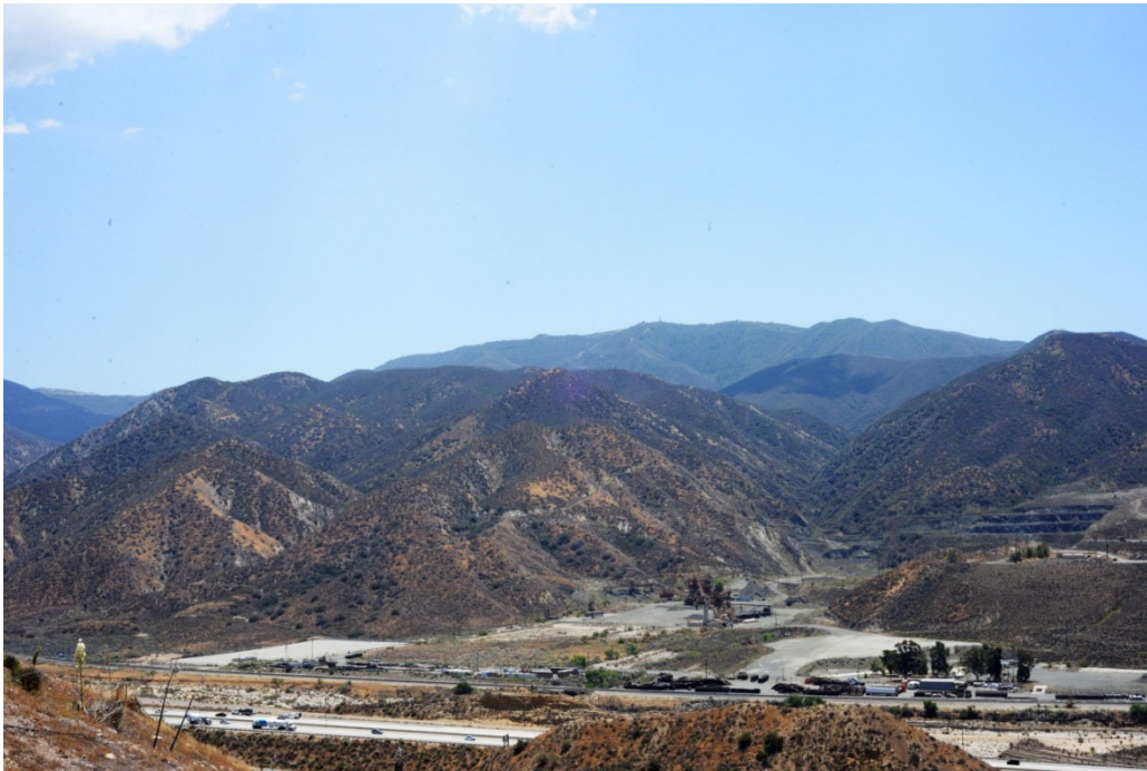
a. Existing View: View to the south from Sequoia Road between Yellowstone Lane and Gas Line Road. The picturesque backdrop of the San Gabriel Mountains is marred by the abandoned Nike Missile and the noticeable infrastructure features. The view offers moderately low visual quality to the nearby residents and travelers along the roadway.