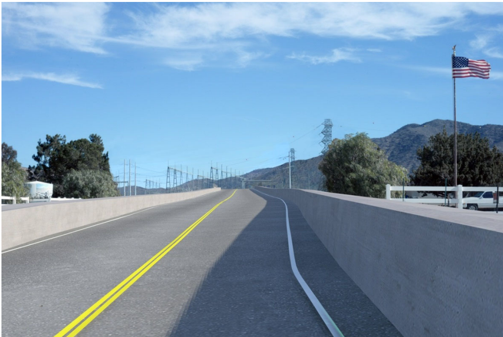
b. Simulated View: The project would transform Foreston Drive from a dirt road to a paved roadway overcrossing. The project features would be consistent with the existing industrial elements in the view (such as the electrical transmission line in the background) but would contrast with the existing rural visual character, such as the white wood fencing, reducing the existing cultural order. Overall, the degree of change to visual quality would be adverse.