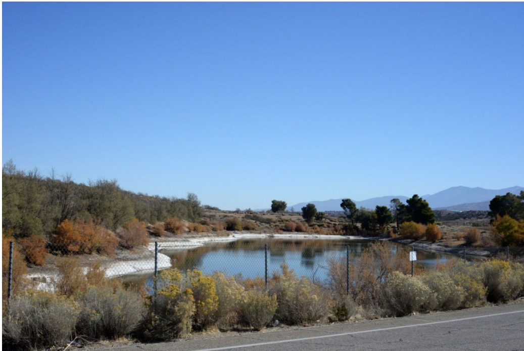
a. Existing View: View to the southeast towards Una Lake from Sierra Highway. Una Lake is the central feature, encircled by shrub vegetation. A metal chain-link fence and Sierra Highway comprise non-natural features in the view. Existing visual quality is moderate for the travelers on the highway.