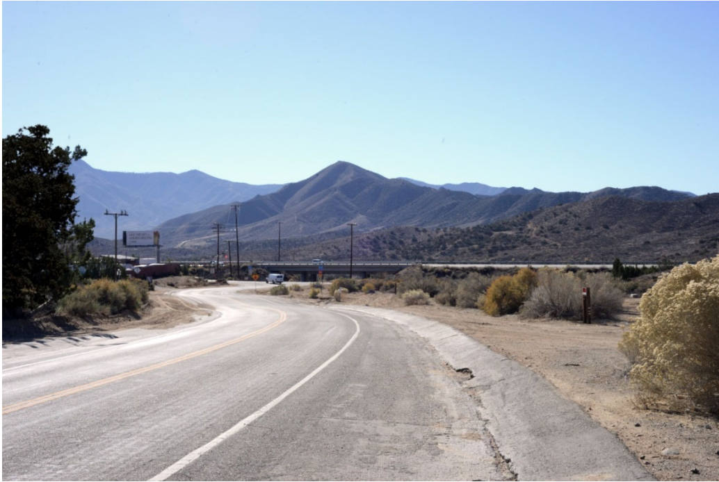
a. Existing View: View to the south toward SR-14 on Red Rover Mine Road. The pronounced ridgelines of the San Gabriel Mountains provide the backdrop. The curvilinear, flat, grey roadway is lined with commercial/industrial uses and other infrastructure elements. The view offers moderate visual quality to the travelers along the roadway.