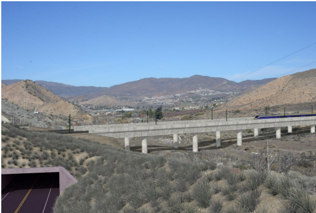
b. Simulated View: The project's introduction of an elevated guideway to carry train tracks over the Aliso Creek would introduce a visual element that is out of scale of existing features and would dominate the view. As the viewpoint is located along a transportation corridor, introduction of project components would not substantially alter the visual character of the scene, despite their large scale. Further, the elevated guideway would not block background views of the mountains and would not change the existing natural harmony. Overall, the degree of change to visual quality would be neutral.