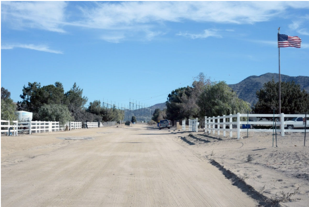
a. Existing View: View to the east along Foreston Drive. The viewpoint is from a dirt road within an isolated neighborhood. Electrical towers and lines associated with the Vincent Substation are visible, creating a distinctly industrial feature in the otherwise rural setting. The view offers moderate visual quality to residents and travelers.