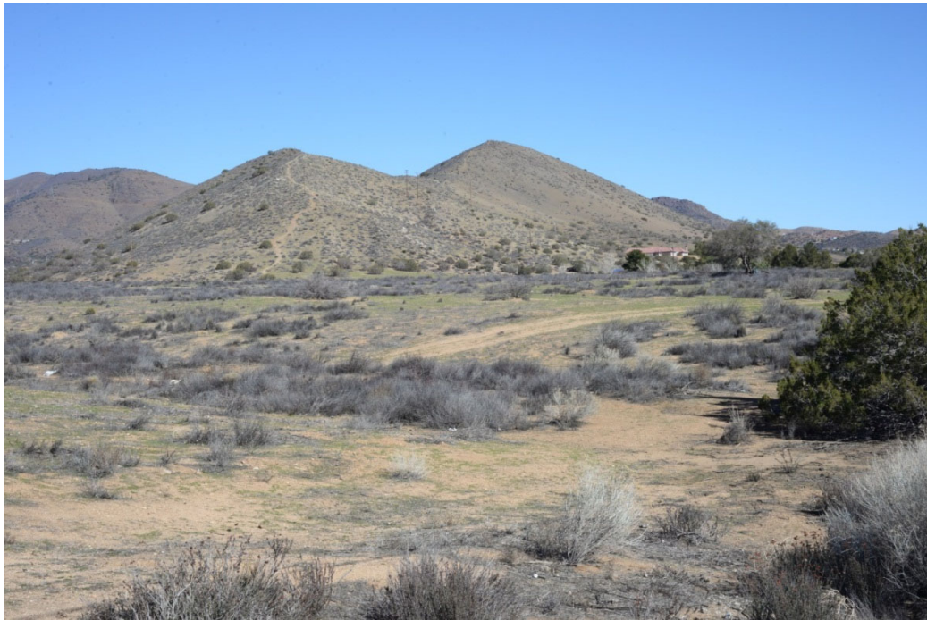
a. Existing View: View to the northeast on Crown Valley Road. Mountainous ridgelines provide a backdrop to an open space with low-lying rugged vegetation. The view offers moderately high visual quality to residents, visitors to library, workers, and travelers along Crown Valley Road.