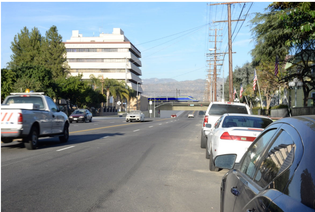
b. Simulated View: Added project features would be the elevated tracks spanning Sheldon Street and associated support columns. While the project features would partially screen the view to the mountains, they would somewhat enhance the cultural order in the foreground. Overall, the degree of change to visual quality would be neutral.