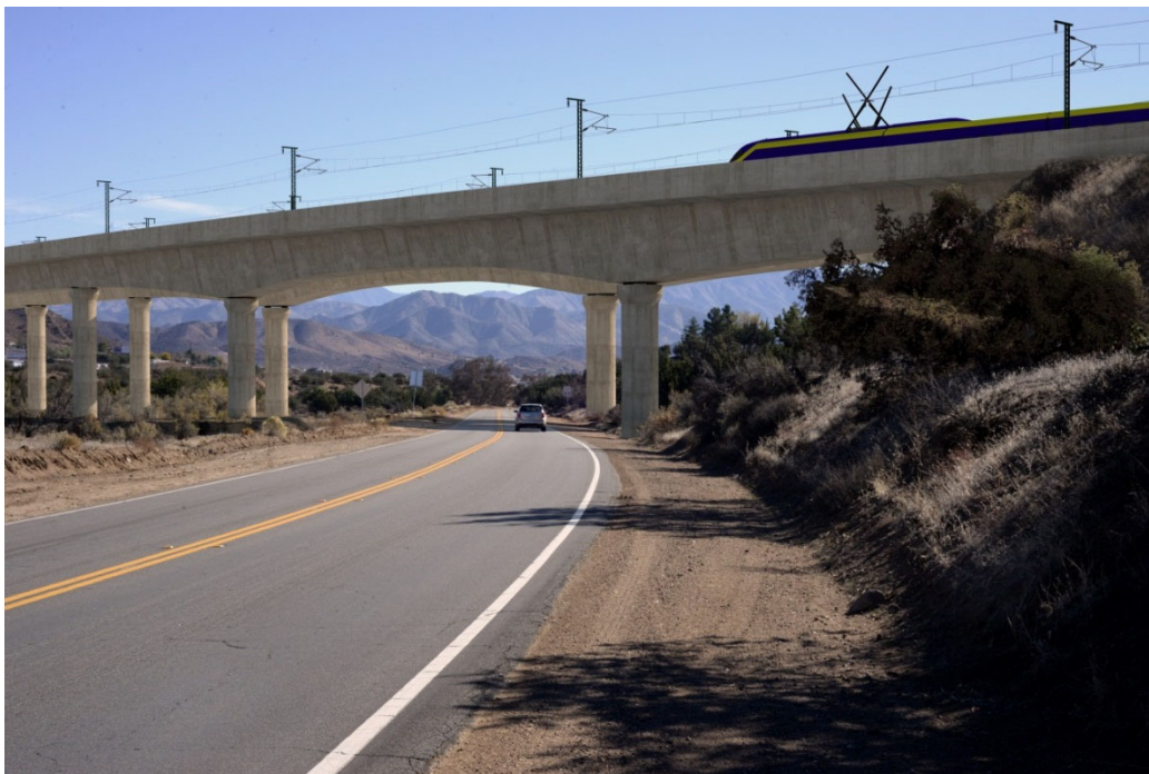
b. Simulated View: The project would introduce a large overcrossing and associated vertical support columns spanning Escondido Canyon Road, that would be out of scale with the existing transportation infrastructure in the setting, reducing the project coherence. The project components would partially obstruct the view of the mountains in the background, reducing the natural harmony at this location; however, this would only be for a short duration for travelers along the road. Overall, the degree of change to visual quality would be adverse.