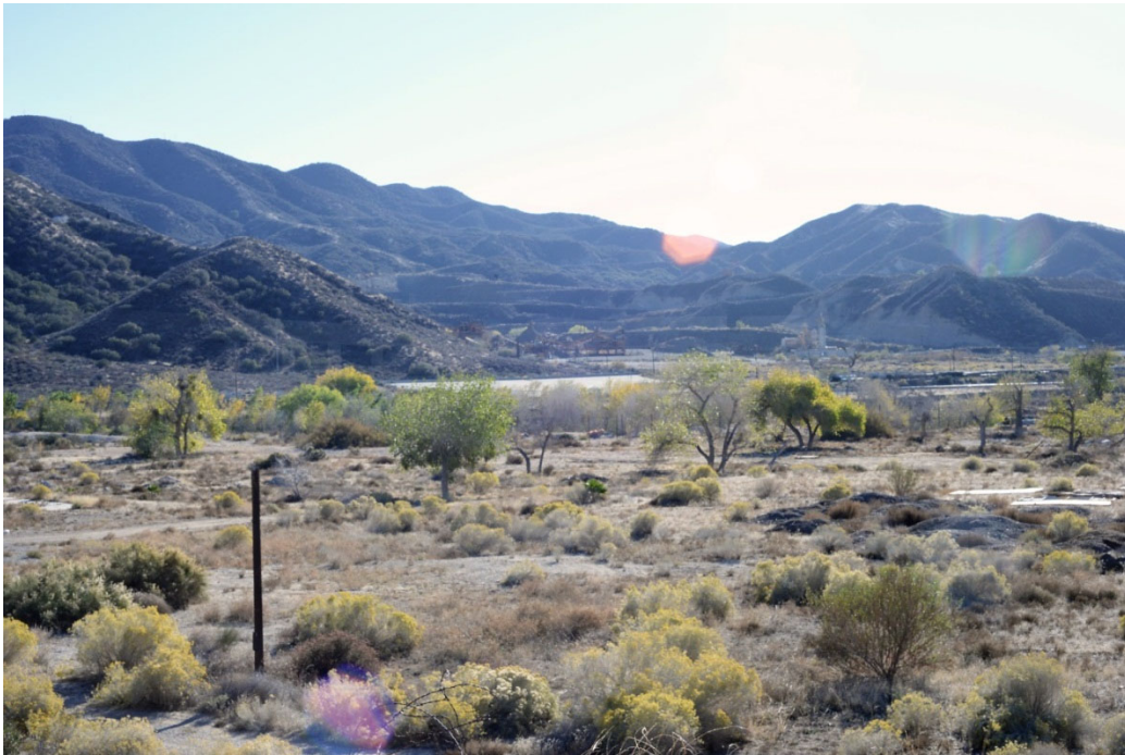
a. Existing View: View to south toward the Santa Clara River basin on Soledad Canyon Road. An arrangement of sharp ridgelines and rounded mountains make up the backdrop. The presence of heavy machinery associated with mining diminishes the natural harmony of the mountains. Overall visual quality for the travelers along the roadway is moderately low.