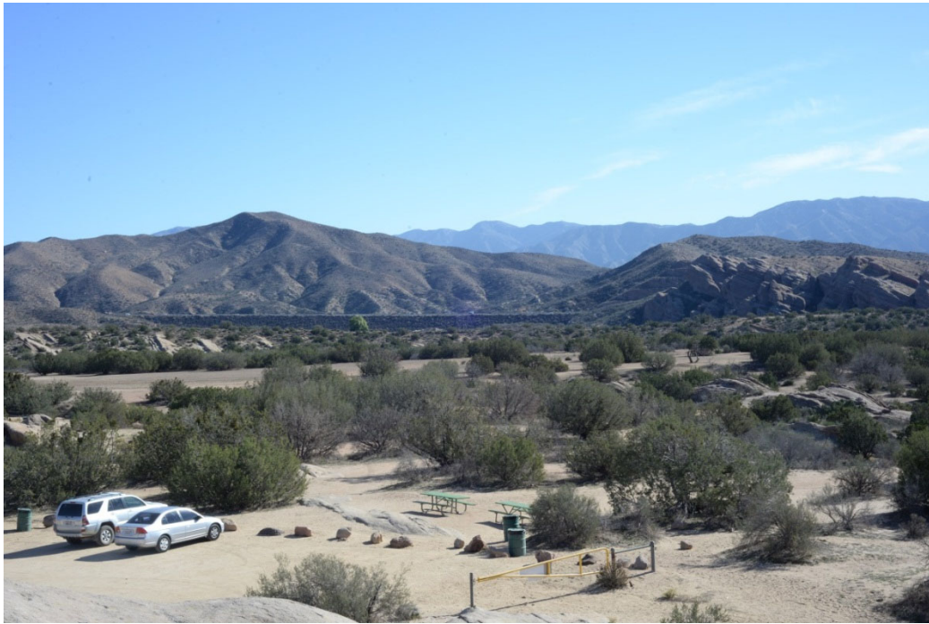
a. Existing View: View to southeast towards SR-14 from the Vasquez Rocks Natural Area Park. The fluctuating topography and ridgelines of the San Gabriel Mountains, together with the angular rock outcroppings of Vasquez Rocks offer a moderately high visual quality to recreationists.