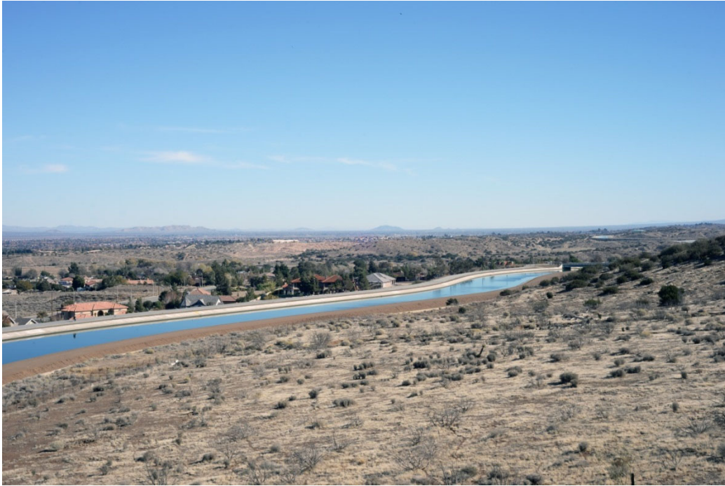
a. Existing View: View to the east toward the California Aqueduct from the Lamont Odett Vista Point along SR-14. The linear, blue aqueduct divides the large expanses of flat brown terrain scattered with low-lying green vegetation, and small, rectangular, box-like houses. The view offers moderately high visual quality to the travelers along SR-14.