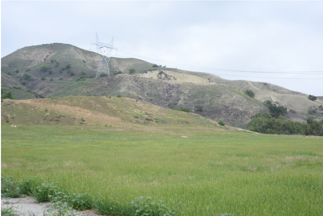
a. Existing View: View to the northeast at the intersection of Kurt Street and Nadina Street. The view features an open, grassy field surrounded by scenic hills, interrupted by transmission towers and lines. The view offers moderately high visual quality to the residents and travelers on roadway.