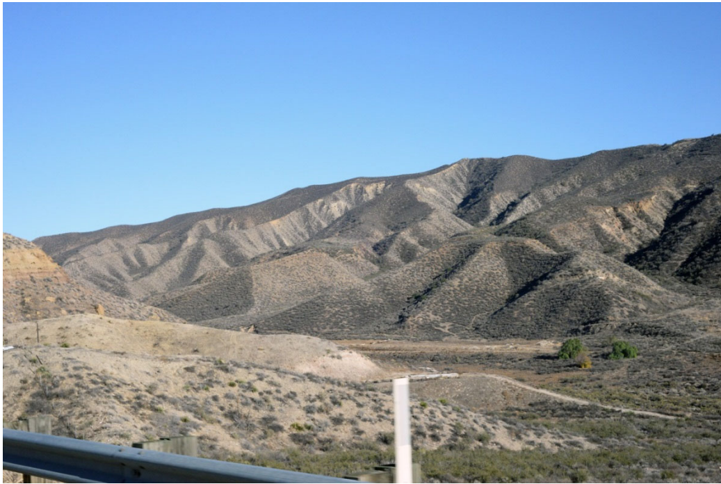
a. Existing View: View to the east on SR-14 between Agua Dulce Canyon Road and Soledad Canyon Road. The alternating ridgelines and canyons of the San Gabriel Mountains and minimal human interference offer moderately high visual quality to the travelers along SR-14.