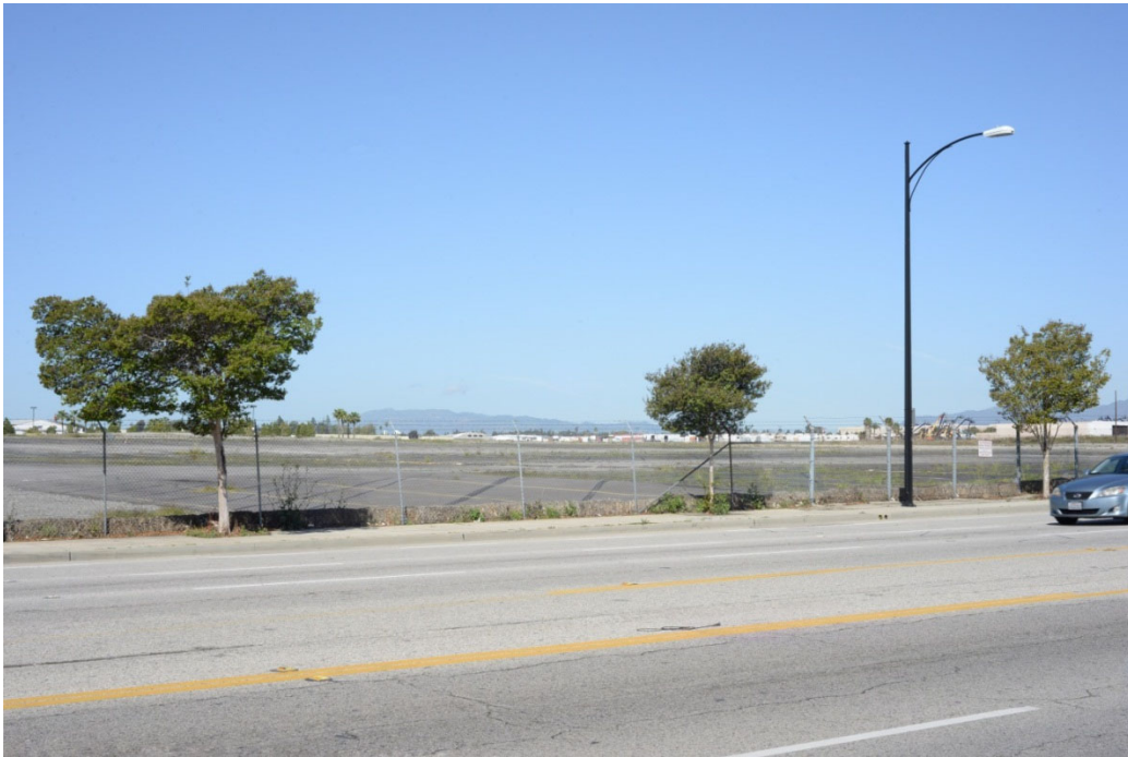
a. Existing View: View to the northwest on North Hollywood Way. Distant views of the Santa Susana Mountains provide an aesthetically pleasing backdrop to a wide expanse of pavement, parallel linear lines associated with the roadway infrastructure, a line of unified ornamental trees, and distant rectangular, neutral-colored buildings. This view offers moderate visual quality to the nearby residents, workers and travelers along North Hollywood Way.