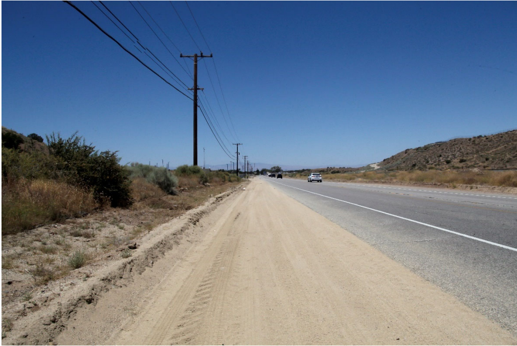
a. Existing View: View looking north toward the City of Palmdale (not visible), located along Sierra Highway south of the California Aqueduct. Undeveloped land and sparse shrubbery can be seen along both sides of the highway along with sparse development. No prominent features exist within the view.