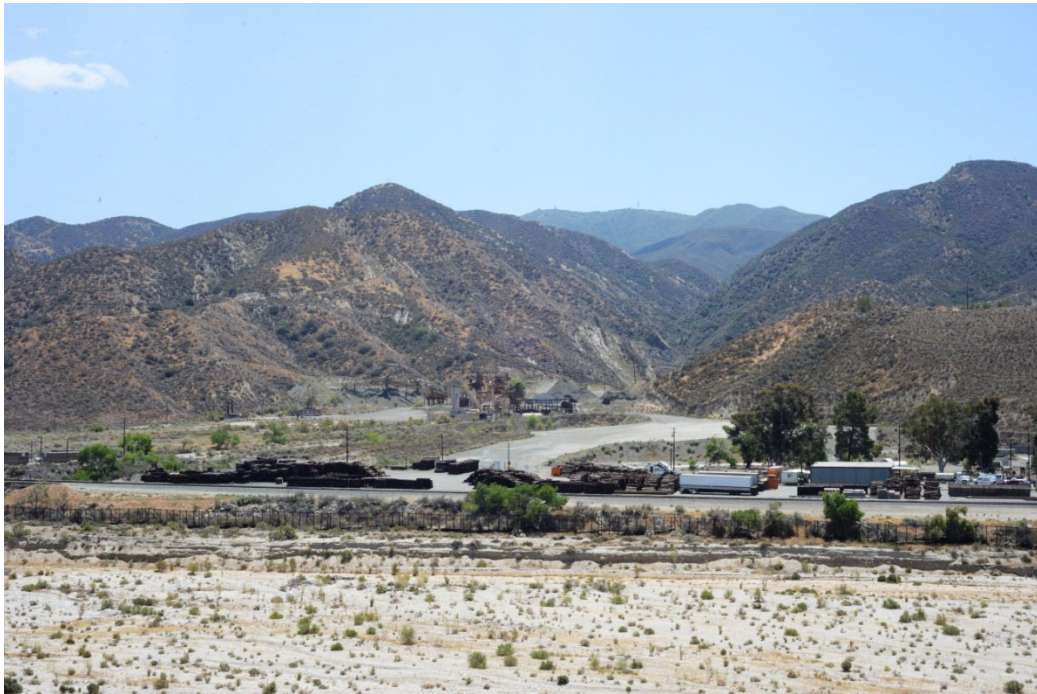
a. Existing View: View to southeast on Soledad Canyon Road near Lang Station Road. The view is dominated by the abandoned Nike Missile site. A sequence of canyons and ridgelines are visible in the backdrop. Together they offer low visual quality to the travelers on the roadway.