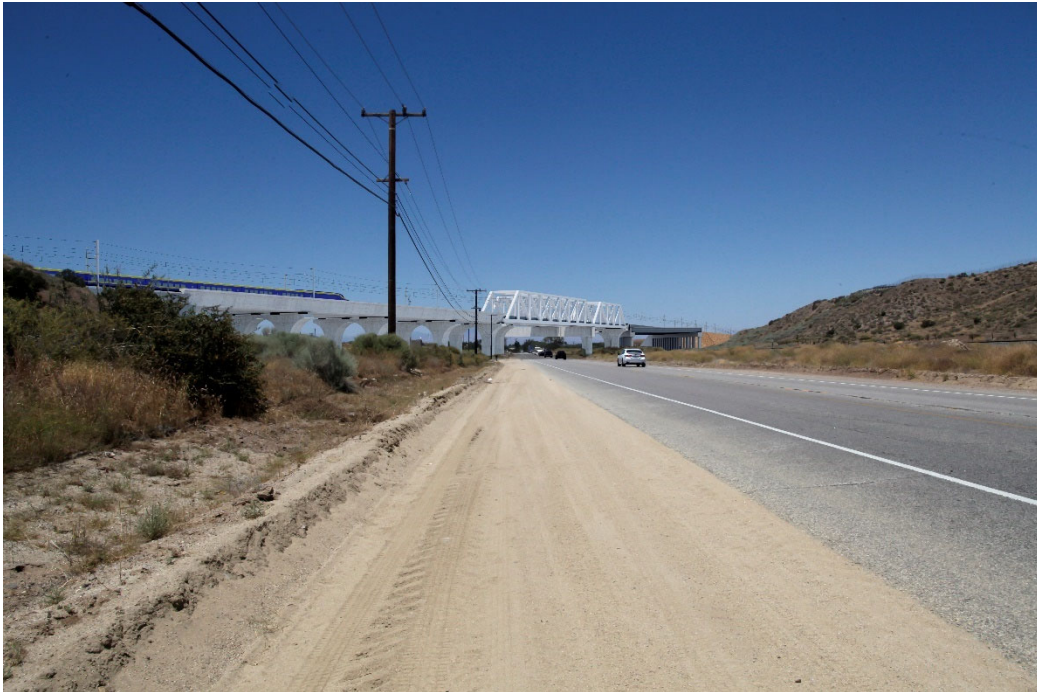
b. Simulated View: The project alignment would cross over Sierra Highway on viaduct. The viaduct would introduce an element of the project environment that would be out of scale with existing visual character, reducing project coherence. The viaduct would be highly visible to motorists and nearby residents blocking distant views and reducing the existing natural harmony. The overall degree of change to visual quality would be adverse.