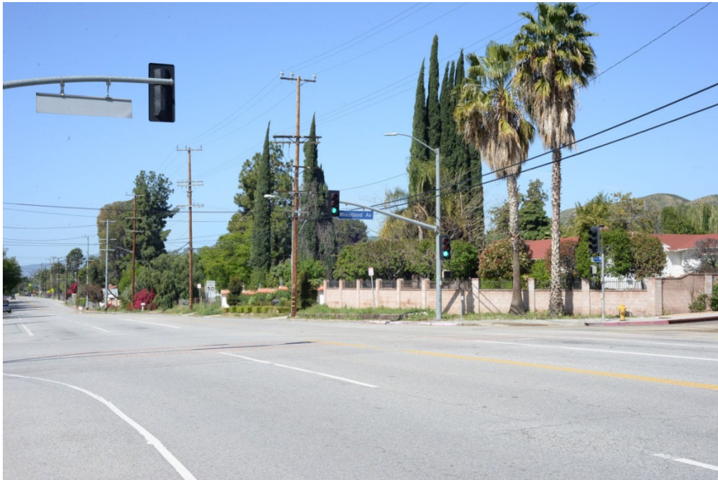
a. Existing View: View to the northwest towards foothills at the intersection of Foothill Boulevard and Wheatland Avenue. The view is dominated by a flat, paved intersection surrounded by a mix of commercial, residential, and undeveloped parcels. Trees and utility poles line along the road, creating a moderate visual quality for the residents, workers and travelers.