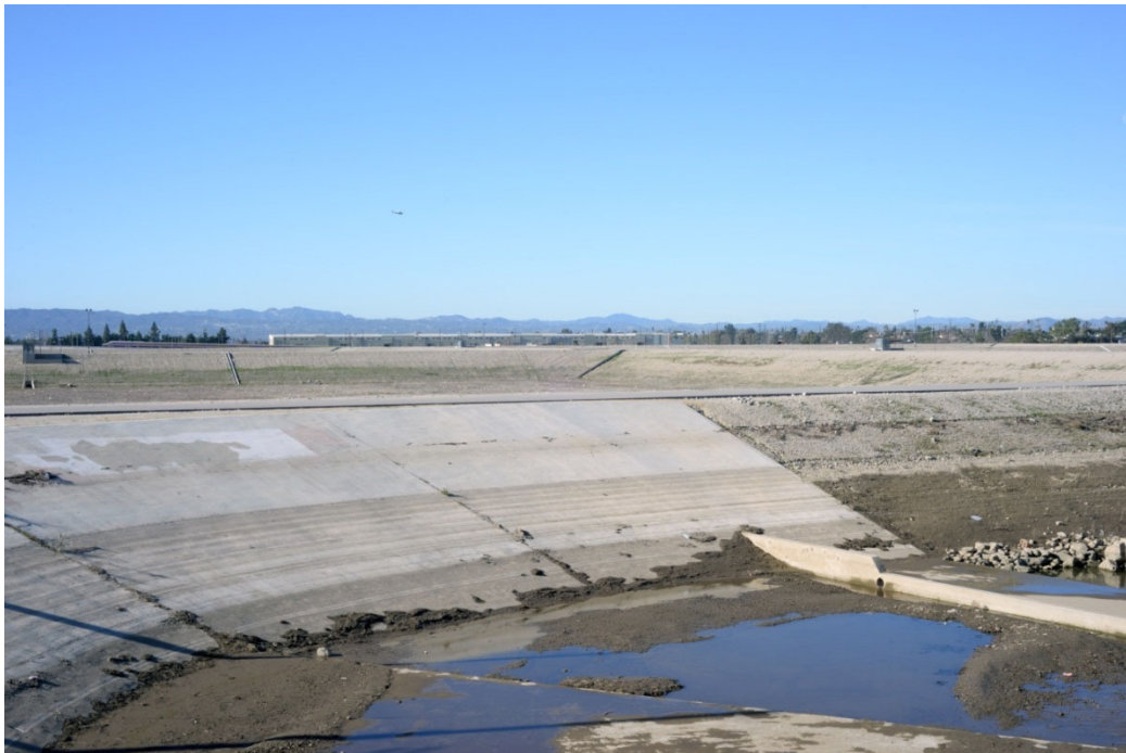
b. Simulated View: The project would add at-grade tracks in the distance. Project features would generally not be visible and would not change the existing visual character. Overall, the degree of change to visual quality would be neutral.