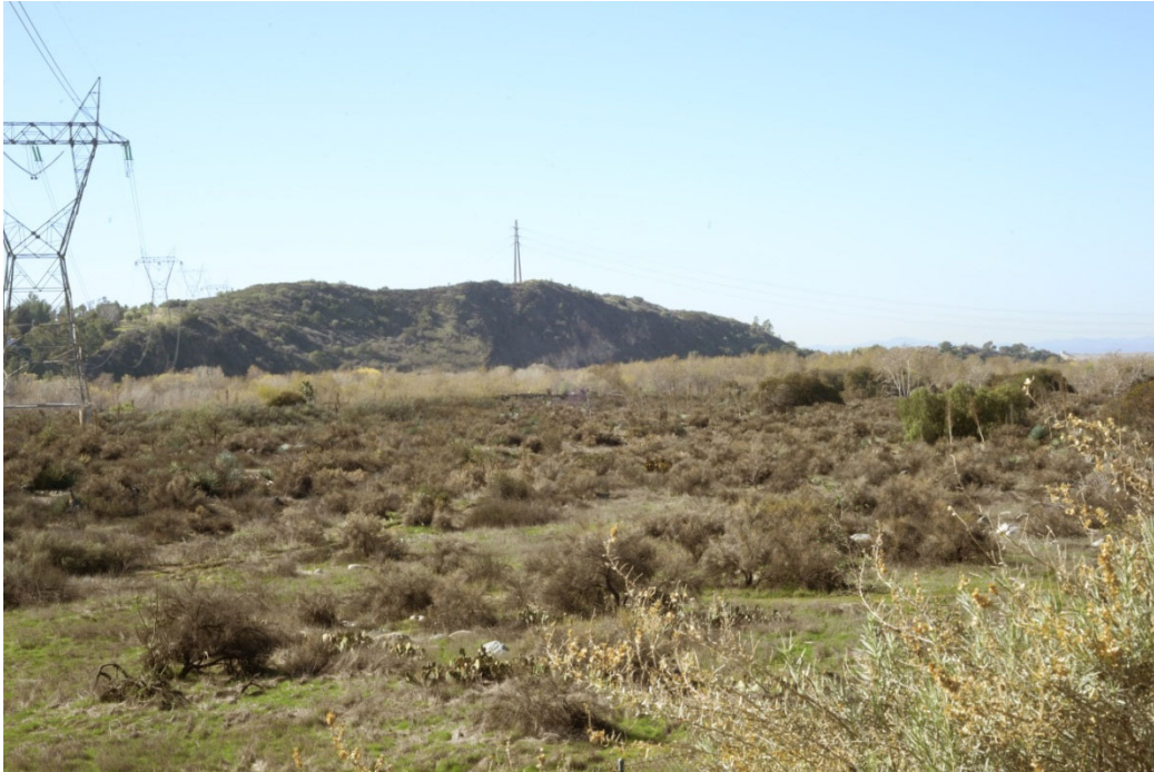
a. Existing View: View to the southwest from Wheatland Avenue. The view consists of undeveloped land and Big Tujunga Wash, interrupted by electrical towers and transmission lines, offering a moderately high visual quality to the residents, workers and travelers.