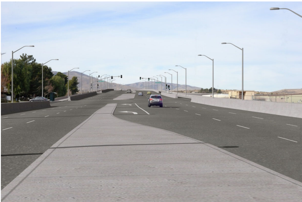
b. Simulated View: The project would elevate East Avenue S over the rail alignment, partially screening the disorderly development for roadway travelers. Project components would not alter the existing visual character of the setting for travelers on East Avenue S. The overall degree of change to visual quality would be neutral.