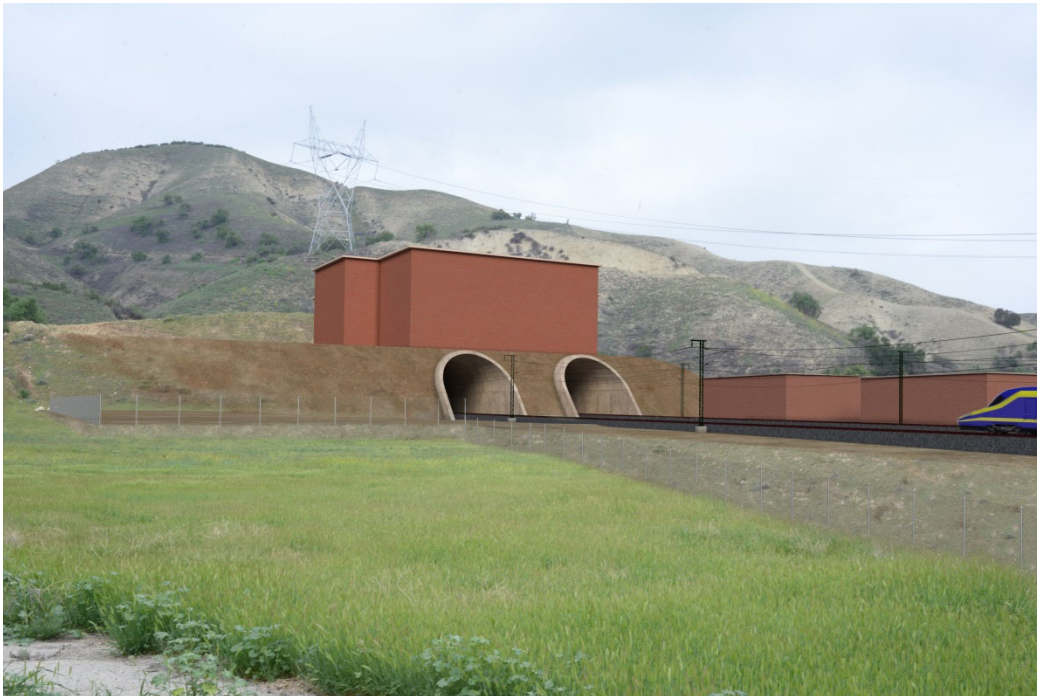
b. Simulated View: Project features, including a tunnel box and portals, neutral-colored rectangular structures and at-grade tracks would traverse the grassy field, reducing the existing natural harmony. The overall degree of change to visual quality would be adverse.