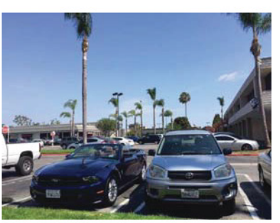
4. Maxella Ave.