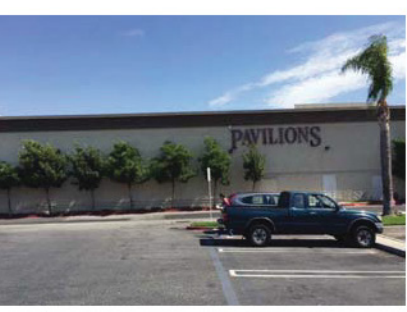
18. Shopping Center