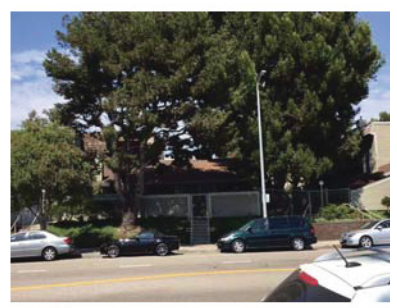
12. Glencoe Ave.