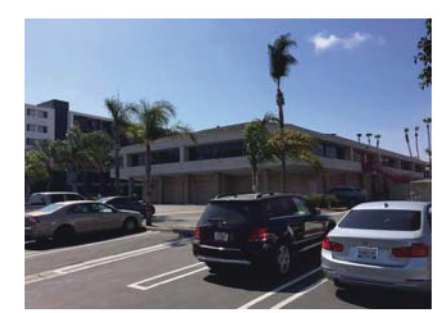
22. Shopping Center