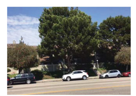
10. Glencoe Ave.