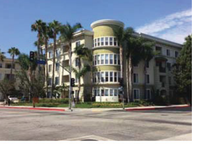
8. Maxella Ave. & Glencoe Ave.