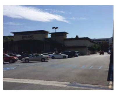
16. Shopping Center