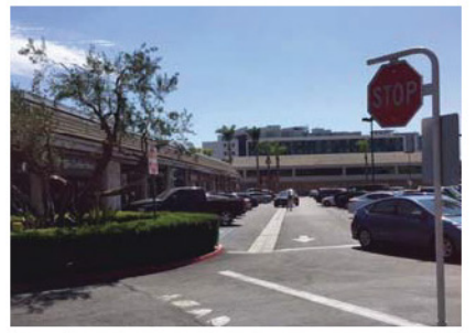
11. Glencoe Ave.