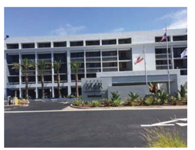
24. Private Road