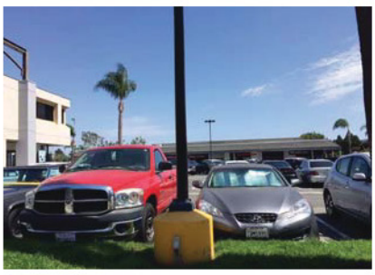
6. Maxella Ave.