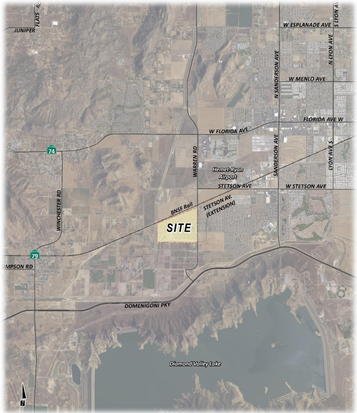
EXHIBIT 1-A: LOCATION MAP