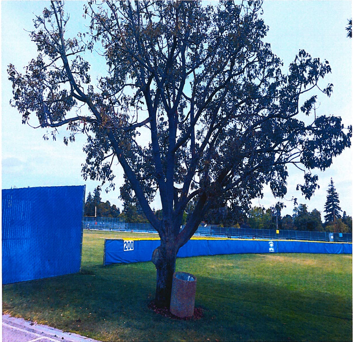
Photo of 13 inch diameter, measured at 4.5 feet above grade Chestnut tree that will have new underground utilities installed at its present location and be within the building footprint.

The tree is health and in good condition.