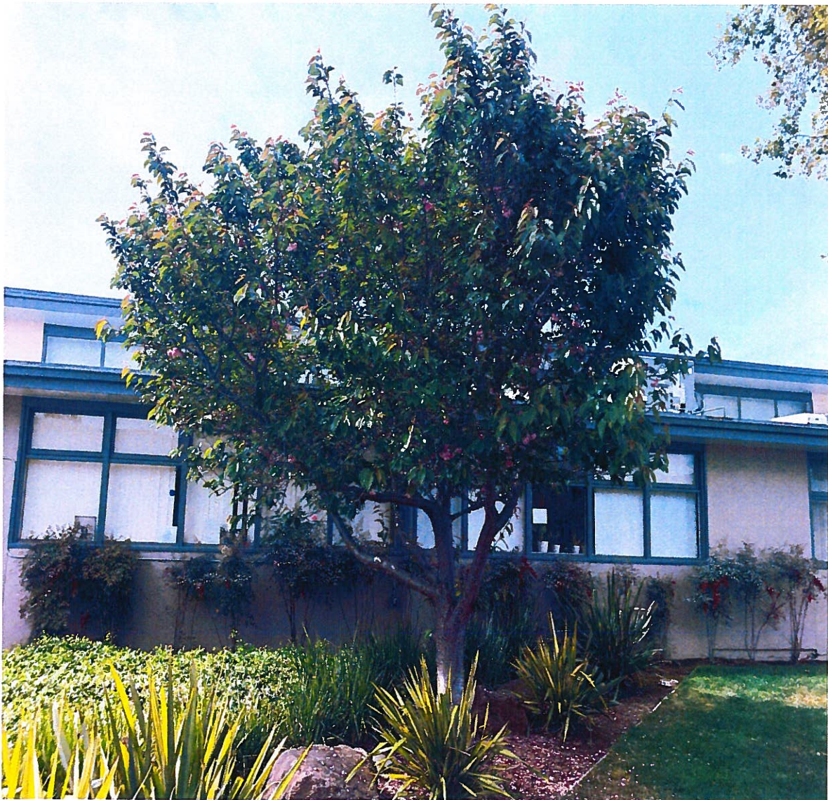
Photo of 11 inch diameter, measured at 4.5 feet above grade Cherry tree that will have new underground utilities installed at its present location and be within the building footprint.

The tree is health and in good condition.