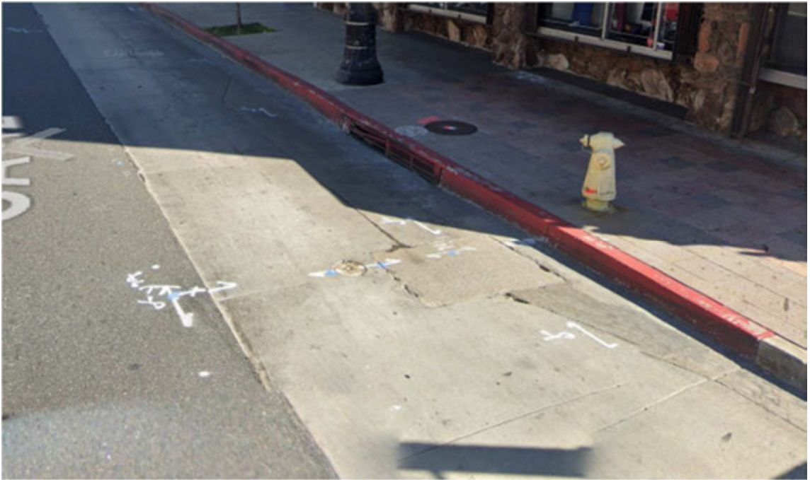
Storm drain on Market St