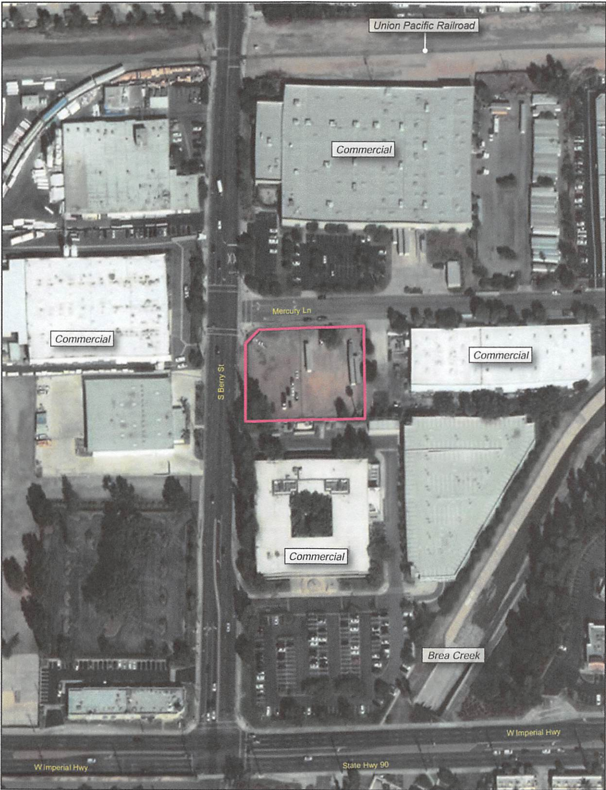
Figure 3 - Aerial Photograph