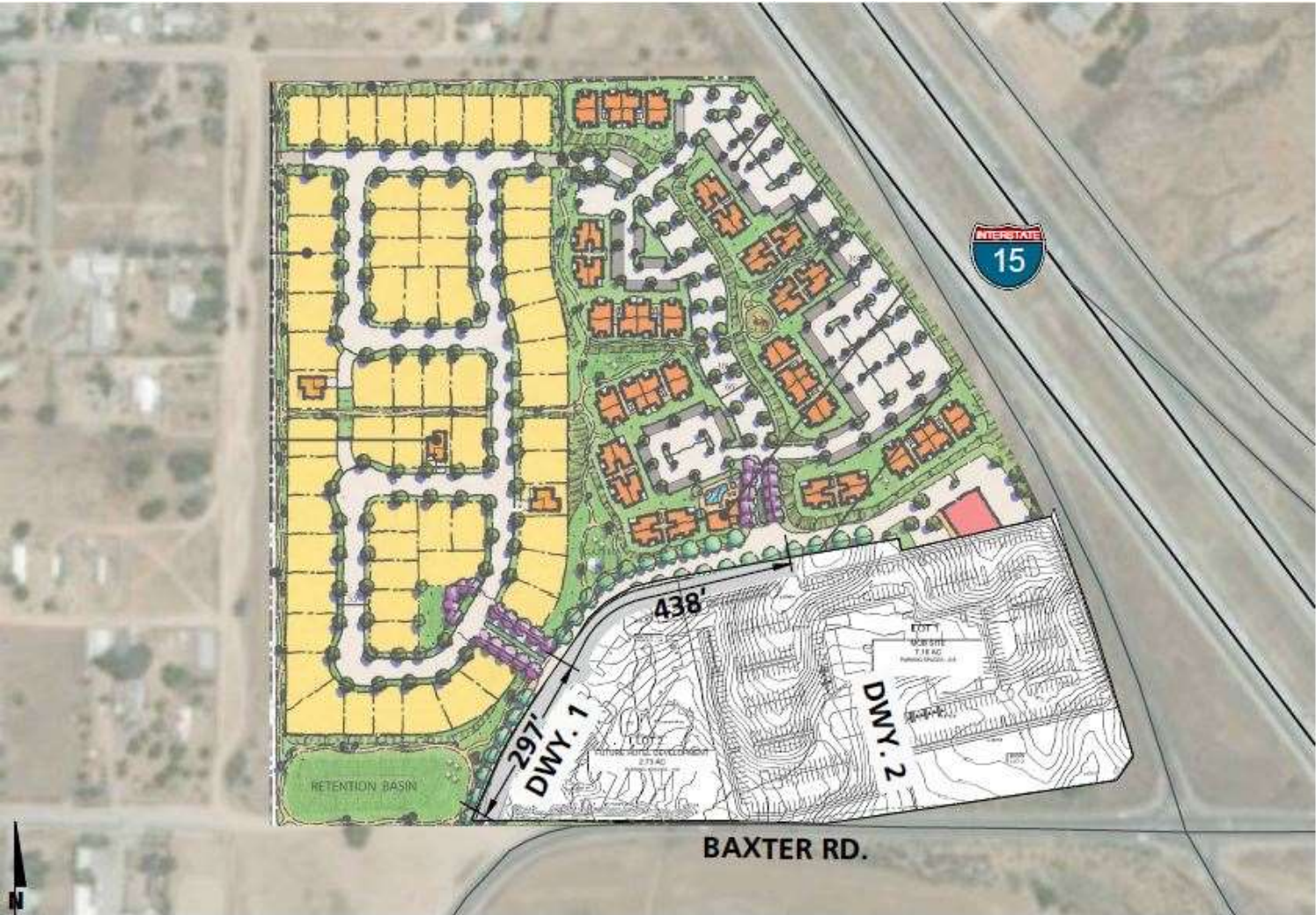
EXHIBIT 1-A: PRELIMINARY LAND USE PLAN