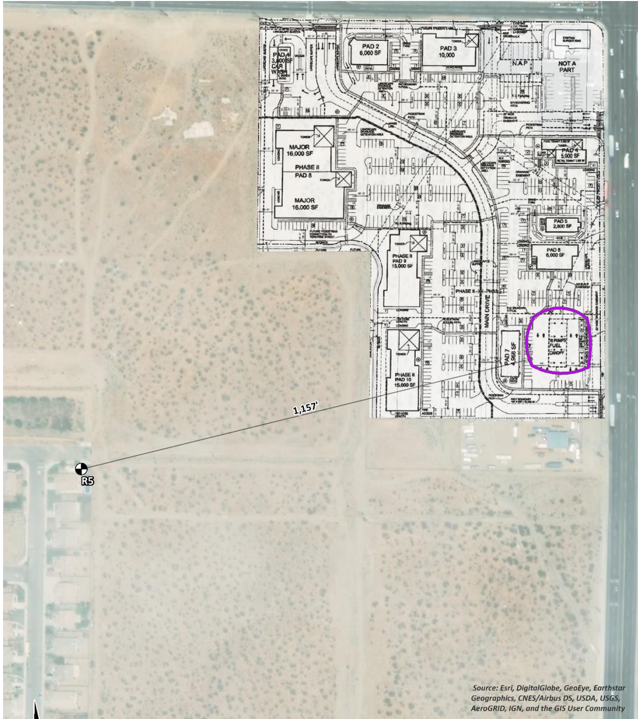
EXHIBIT 3-A: GASOLINE CANOPY AND NEAREST SENSITIVE RECEPTOR