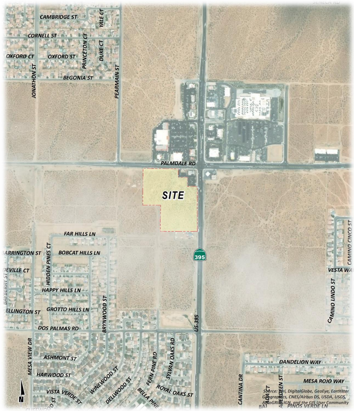
EXHIBIT 1-A: LOCATION MAP