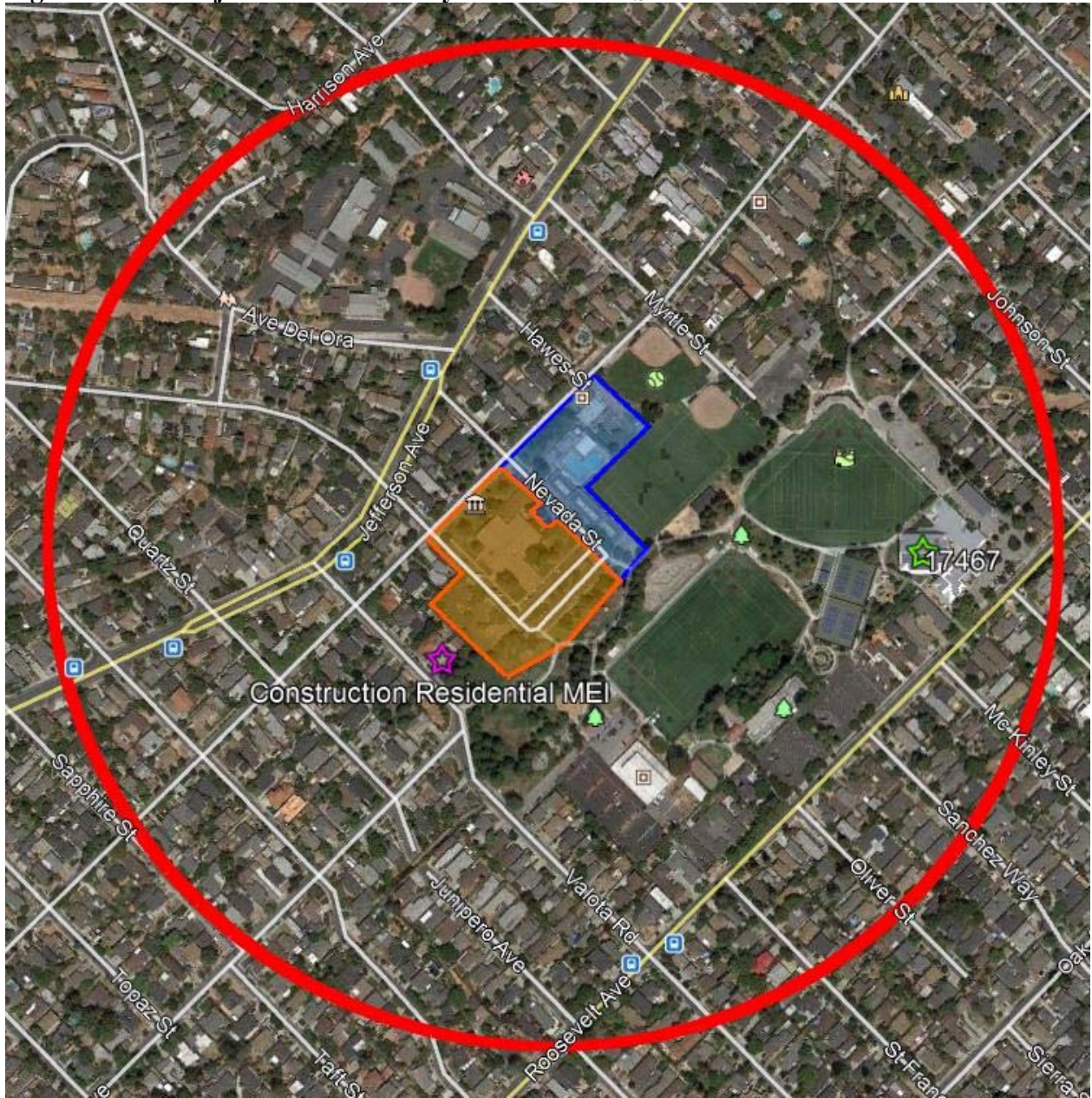
Figure 2. Project Site and Nearby TAC and PM 2.5 Sources