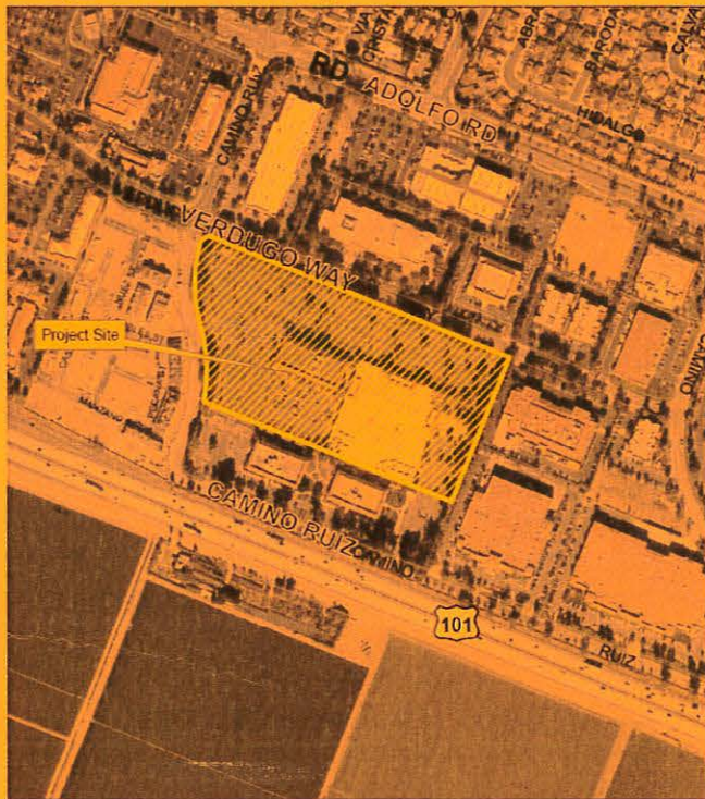
ADDRESS: SOUTHEAST CORNER OF VERDUGO WAY AND CAMINO RUIZ

OFFICE OF PLANNING & RSRCH STATE CLEARINGHOUSE RM 121 1400 TENTH STREET SACRAMENTO CA 95814