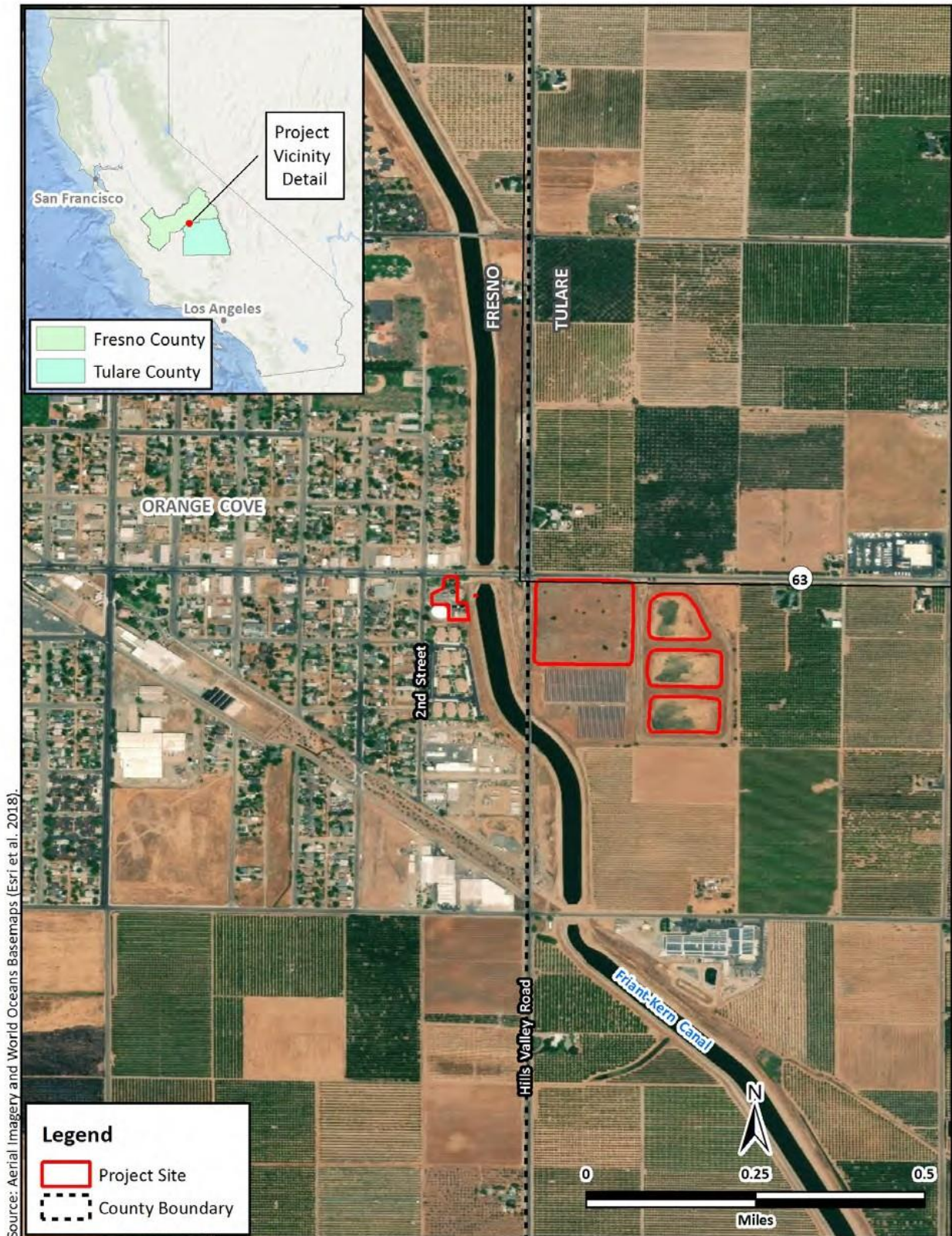
Figure 1 – Original Project Vicinity Map