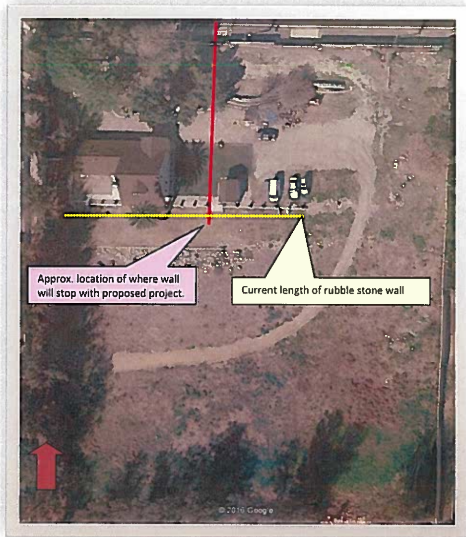
Aerial view of Grandma Isaac House on its legal parcel. (Google Earth, image date February 2016)