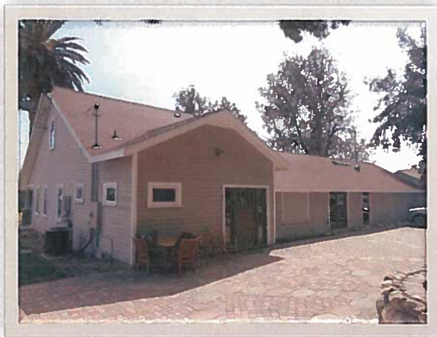
Photograph of the rear (north) façade. View looking southwest.