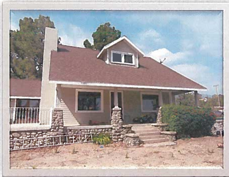
Photograph of the front (south) façade of the house, April 13, 2016. View looking northeast.