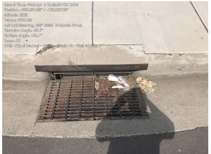
28: Storm drain drop inlet on the north side of Georgia Ave, south of the Retention Basin