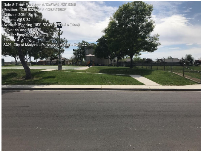
15: Looking south from San Bruno Ave at the proposed Well 4A location