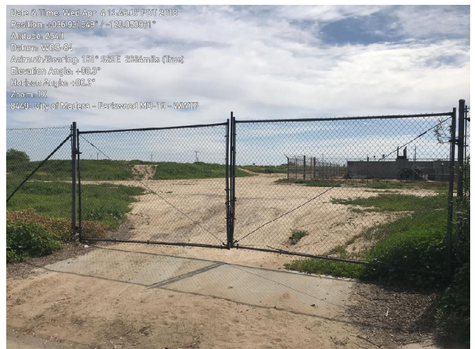
24: WWTP located SE from the intersection of Watt St and Georgia Ave