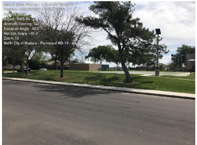
16: Well 4, east of the proposed Well 4A location