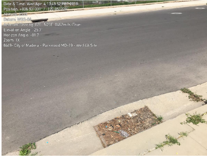
31: Storm drain drop inlet on the south side of Georgia Ave, south of the Retention Basin