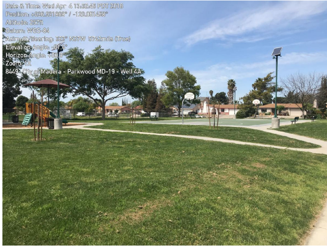
1: Parkwood Park Overview