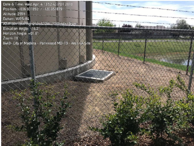
33: Drop inlet at the NW corner of the storage tank