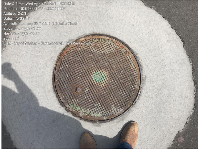
13: Sewer manhole located on San Bruno Ave