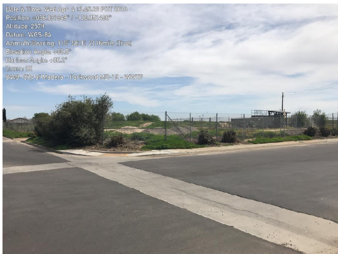
23: WWTP located SE from the intersection of Watt St and Georgia Ave