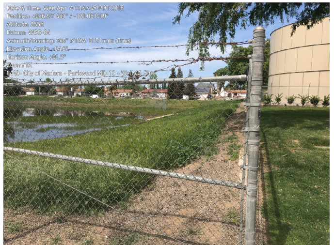
26: South side of stormwater retention basin, looking north from Georgia Ave