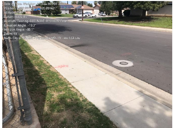
22: USA markings on the west side of Watt Ave, east of Well 4