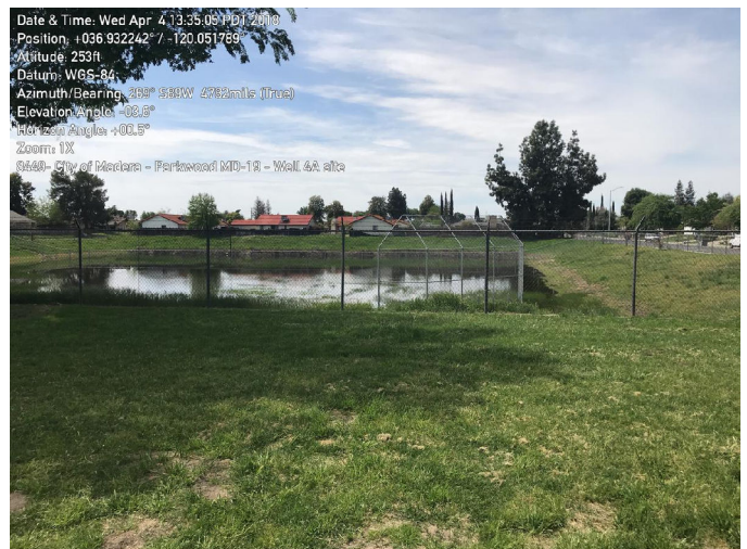
6: Stormwater retention basin west of proposed Well 4A location