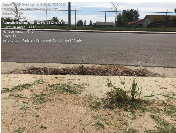
11: Storm drain drop inlet on north side of San Bruno Ave, north of the retention basin