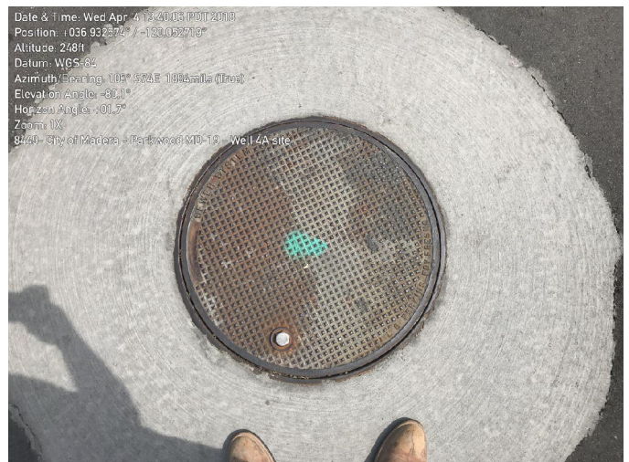
12: Sewer manhole located on San Bruno Ave