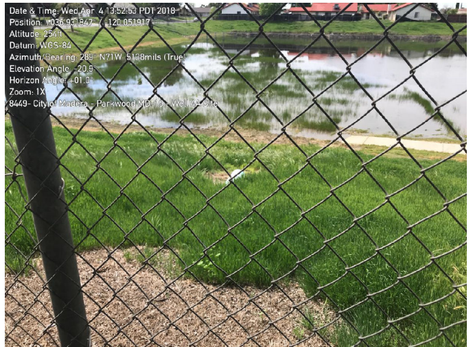
34: Storage tank drop inlet discharge pipe