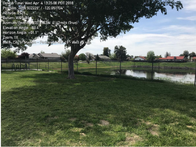
7: Stormwater retention basin west of proposed Well 4A location