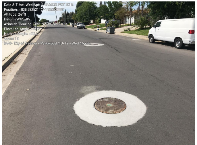
14: Sewer manholes located on San Bruno Ave