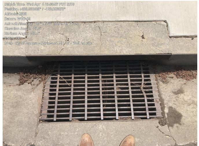
8: Storm drain drop inlet on south side of San Bruno Ave, north of the retention basin