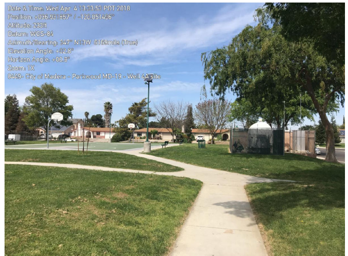
2: Parkwood Park Overview