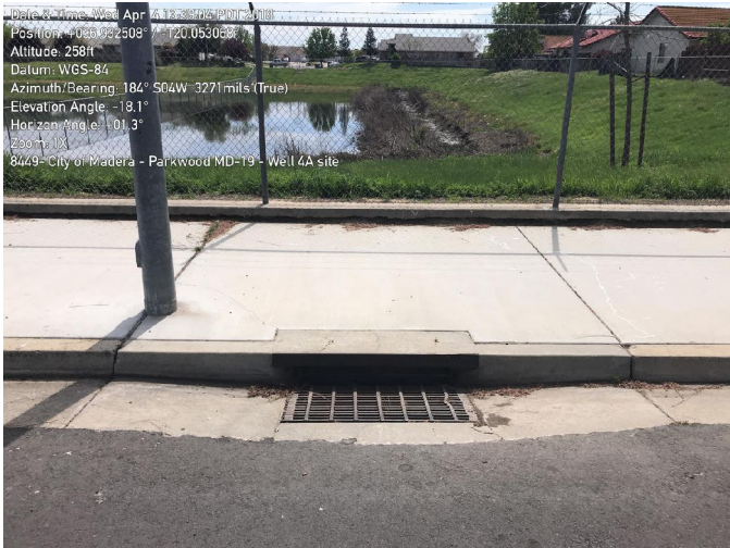
9: Storm drain drop inlet on south side of San Bruno Ave, north of the retention basin