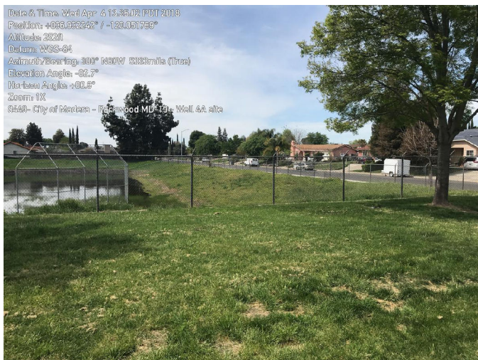
5: Stormwater retention basin west of proposed Well 4A location