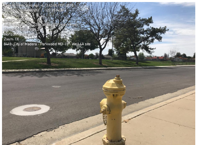
18: Nearest hydrant to site, located at the NW corner of San Bruno Ave and Watt St