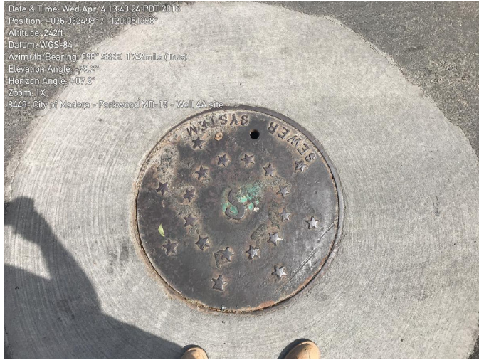
19: Sewer manhole located in the intersection of Watt St and San Bruno Ave