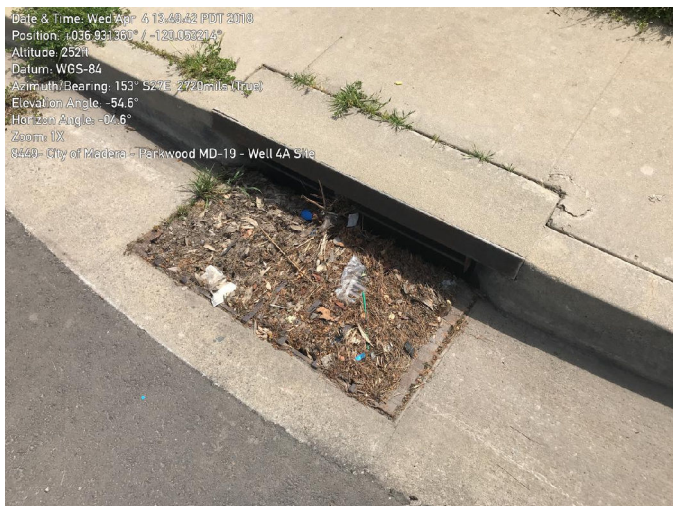
29: Storm drain drop inlet on the south side of Georgia Ave, south of the Retention Basin