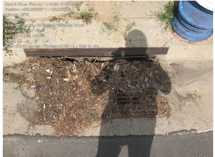
10: Storm drain drop inlet on north side of San Bruno Ave, north of the retention basin