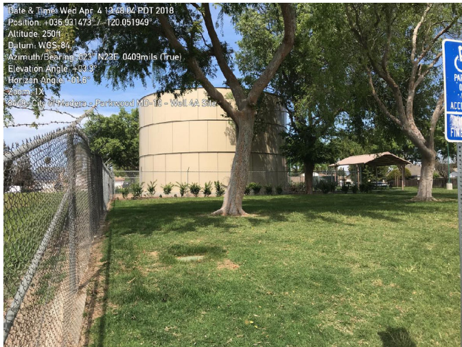
27: South side of 250,000 gallon storage tank