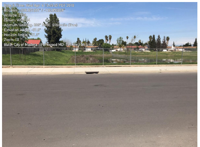
30: Storm drain drop inlet on the north side of Georgia Ave, south of the Retention Basin