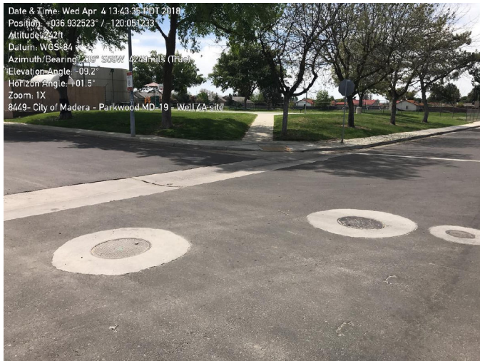
21: Sewer manholes located in the intersection of Watt St and San Bruno Ave