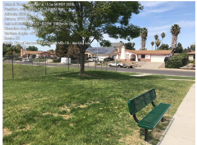
4: Proposed Well 4A location