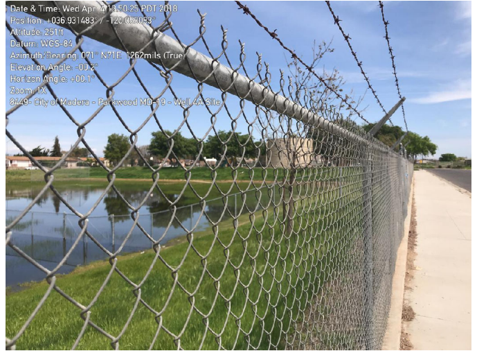
32: South side of the stormwater retention basin, looking NE from Georgia Ave