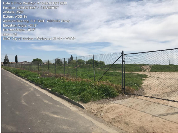
25: WWTP located SE from the intersection of Watt St and Georgia Ave