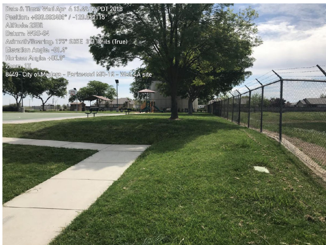
17: Proposed Well 4A location, looking south from San Bruno Ave