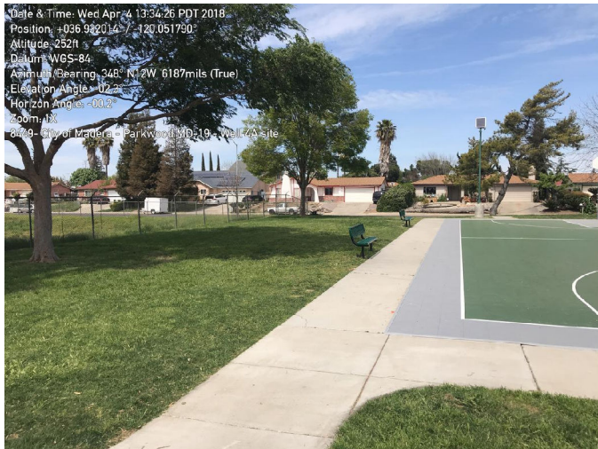
3: Proposed Well 4A location