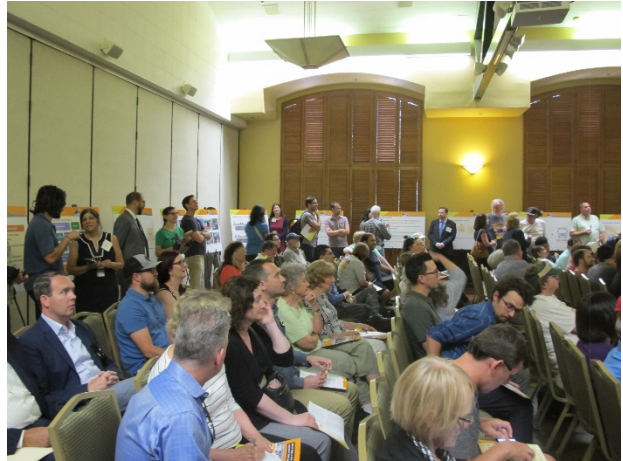
Pasadena Scoping Meeting