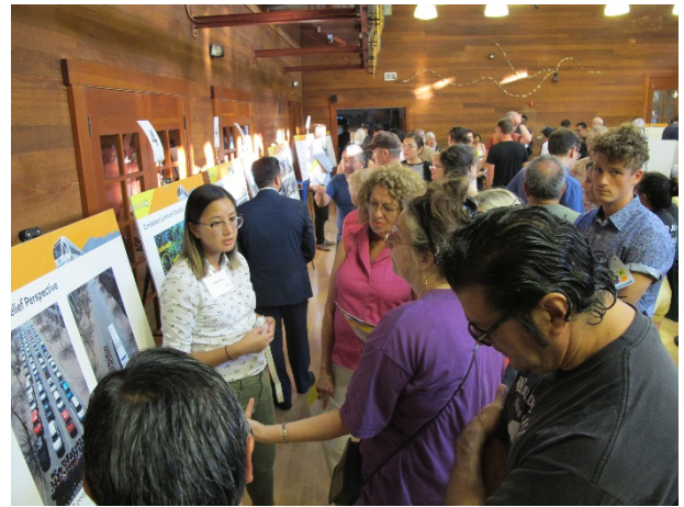
Eagle Rock Community Open House Meeting

A total of 818 stakeholders attended the Public Scoping Meetings and Community Open House Meeting in July and August 2019. A total of 792 comments were received. Table 5 below provides the number of participants and comments submitted at each meeting. Redacted scans of sign-in sheets from each of the meetings are available in Appendix A of this report. Representatives from the following stakeholder groups also attended one or more of the meetings: