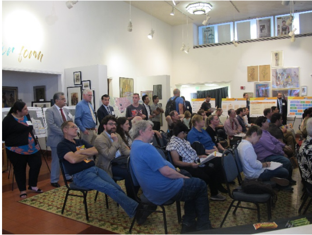
North Hollywood Scoping Meeting