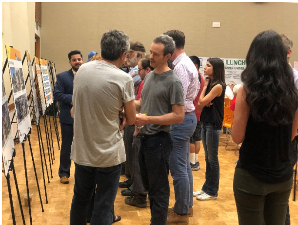
Glendale Scoping Meeting