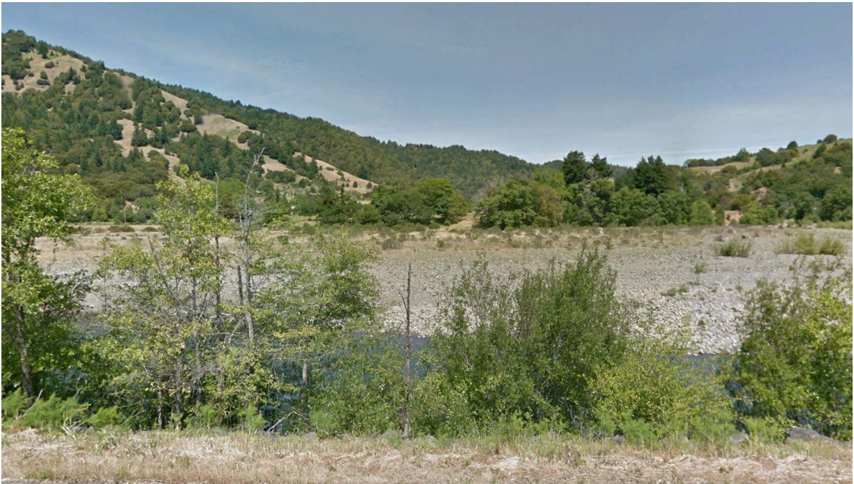
Image 1. View of Project Site Looking North from Wilder Ridge Road Across the Mattole River