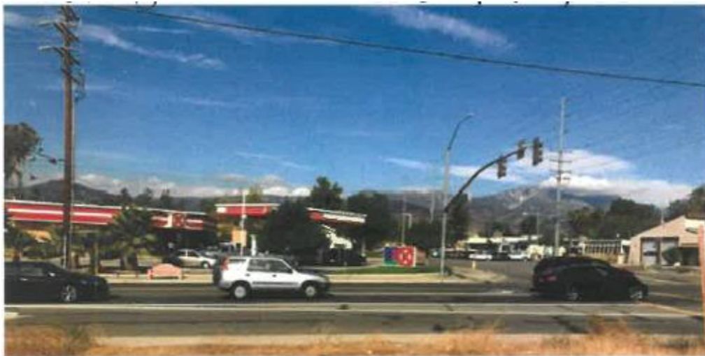
Figure 1 View North from Property