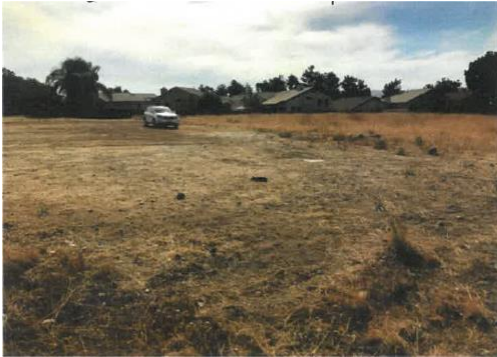
Figure 2 View South into Property