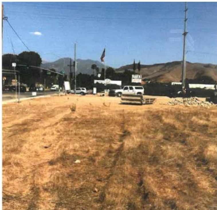
Figure 3 View East from Property