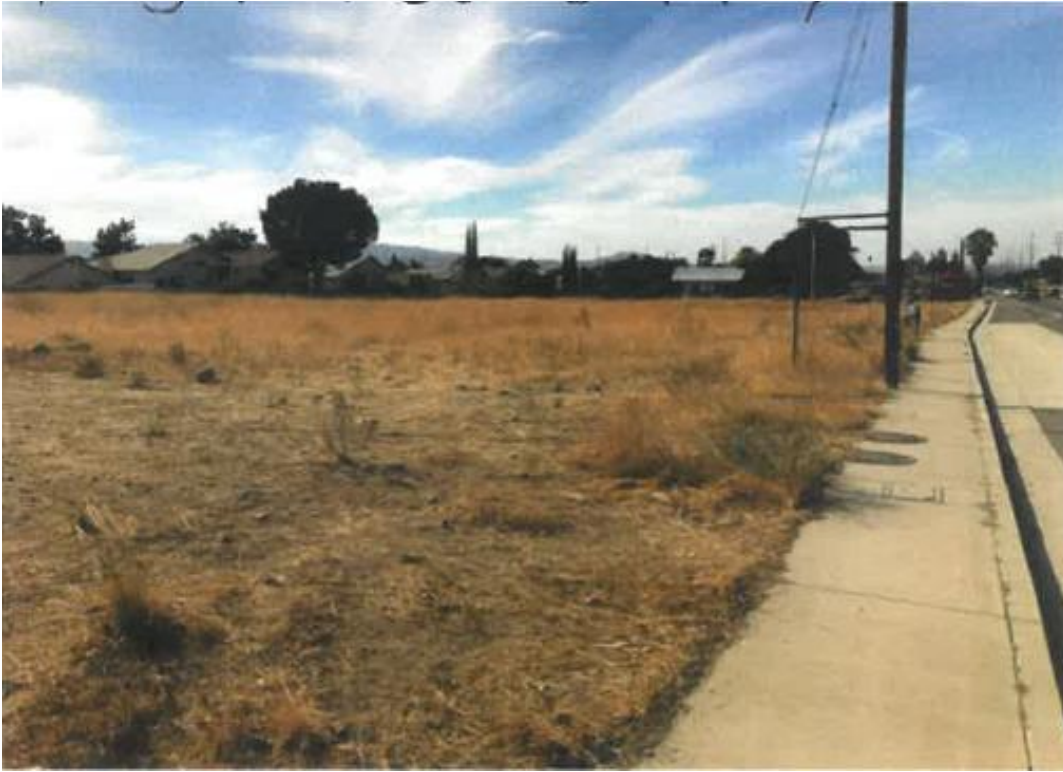
Figure 4 View West from Property