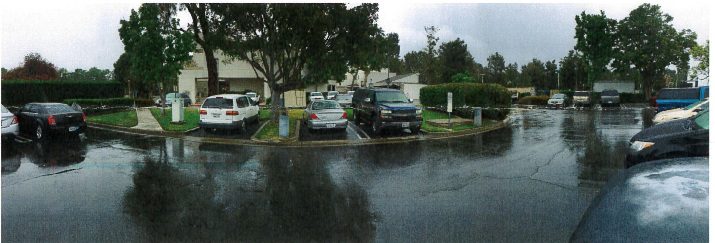
Figure 2. View looking northeast at location of JTM Vault CM-10.