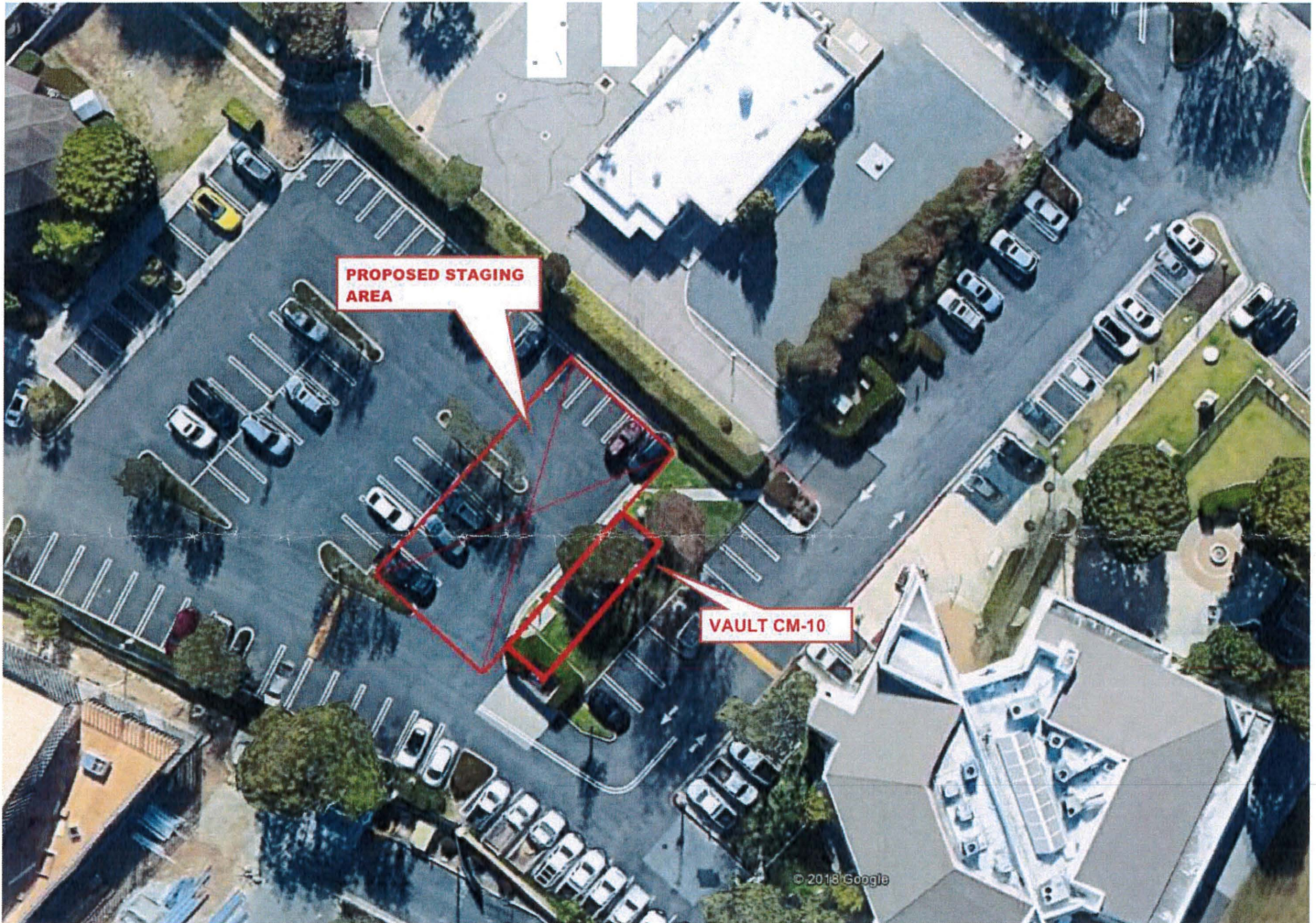
Figure 1. Location of JTM Vault CM-10, 31 Creek Road, City of Irvine, CA.