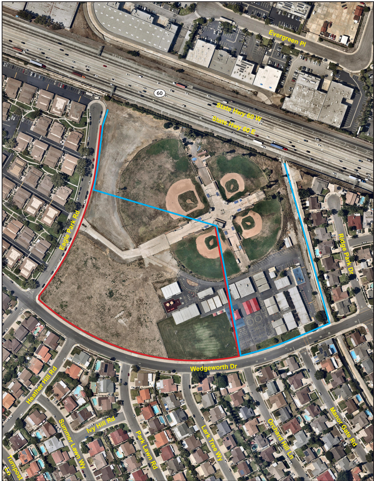
Figure 5.6-1 - Approximate Temporary Noise Barrier Locations