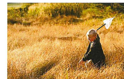
NATURAL LANDSCAPE AREA