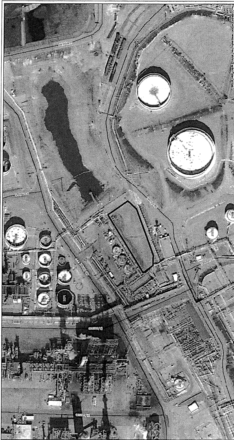
FIGURE 2 FORMER PROCESS WATER POND AREA PHILLIPS 66 LOS ANGELES REFINERY CARSON PLANT, CARSON, CALIFORNIA

Trihydro CONSULTING ENGINEERS 10000 W. 10th Street Los Angeles, CA 90024 (310) 552-1000 www.trihydro.com Drawn By: CF Checked By: AV Date: 01/11/07 File: PWP_PDF_ProcessPWP.mxd