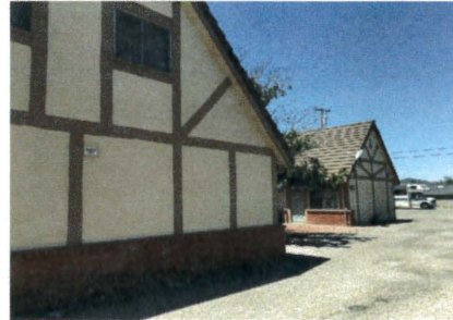
View along Driveway of North Side of Property