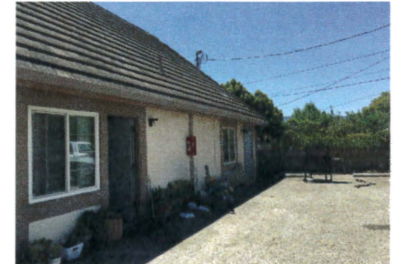
View from Parking Lot of West Side of Property