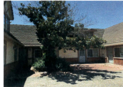
Interior Entry North Side of Property