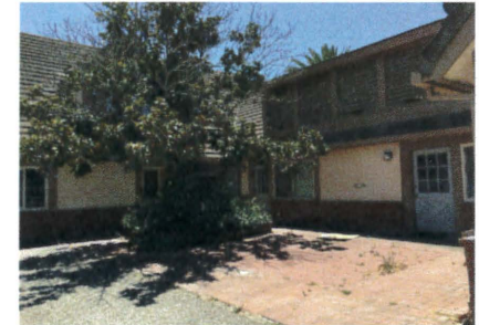
Interior Entry Northwest Side of Property