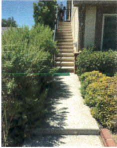
Existing Stairs Retained South Side of Property