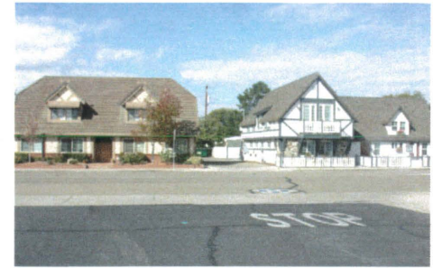
View from Alisal Road East Side of Property