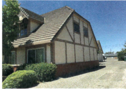
View from Driveway of North Side of Property