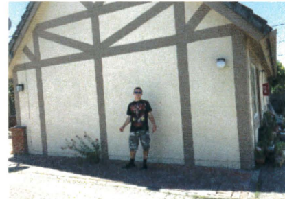
View along Driveway of North Side of Property