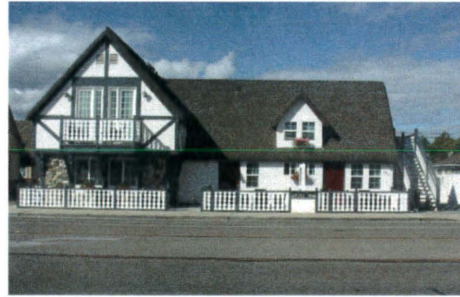
Adjacent Property to the North