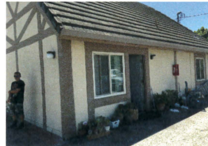
View from Parking Lot of West Side of Property