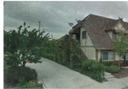
View of South Side of Property