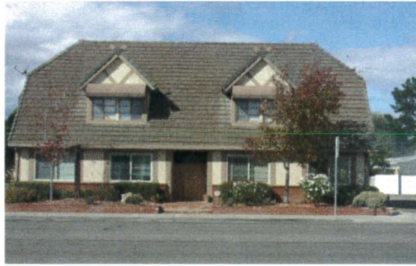
Existing Building East Side of Property