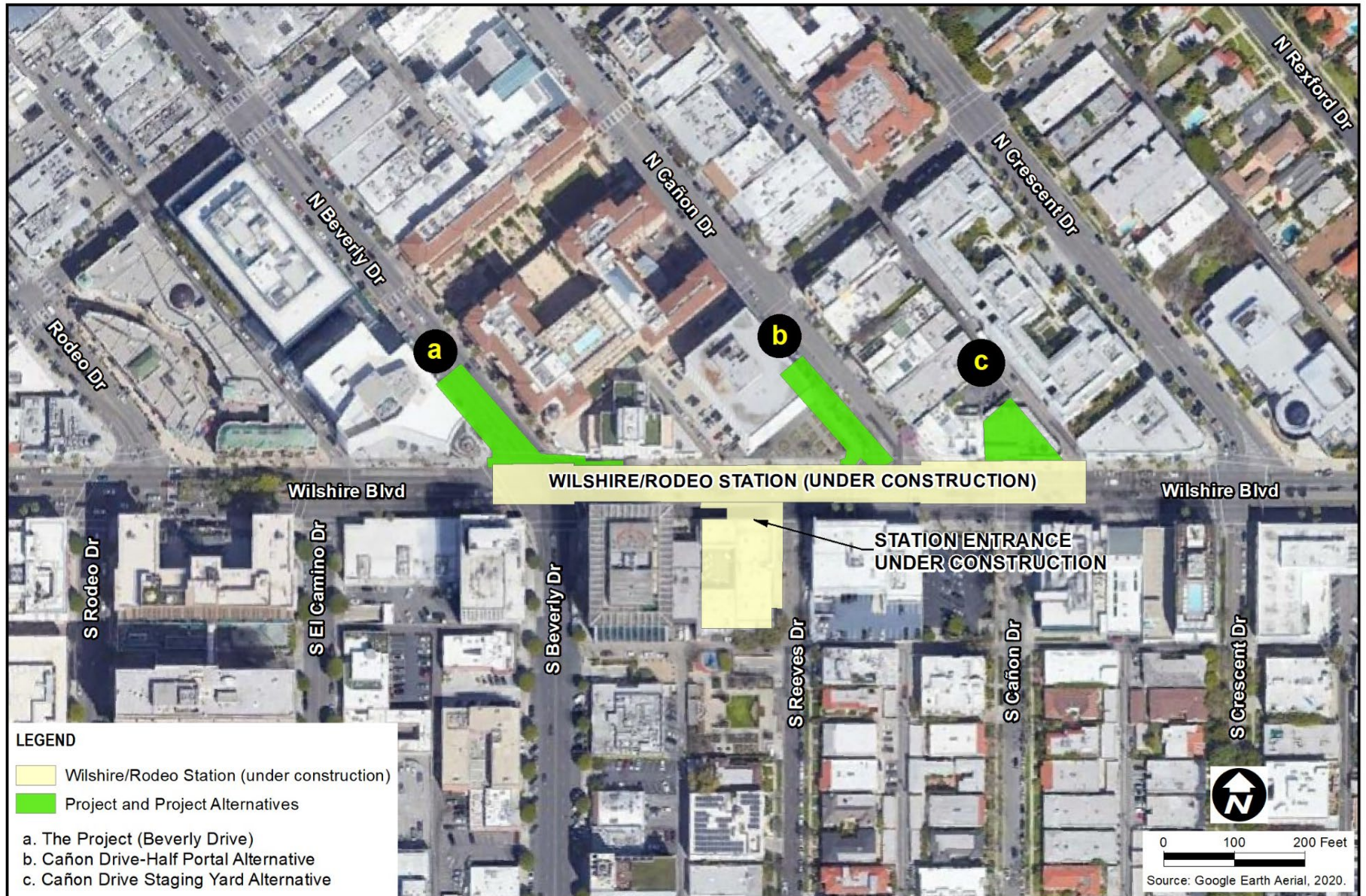
Figure 1 Location of the Project (Beverly Drive) and Project Alternatives