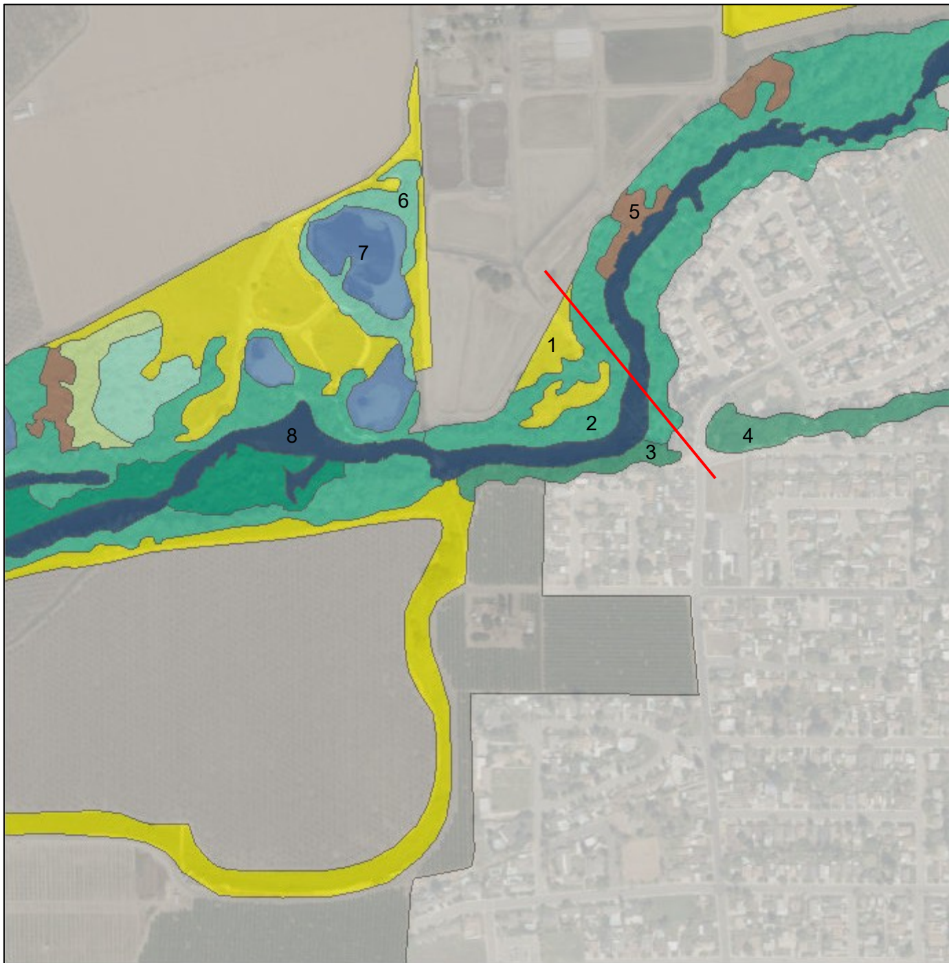
Figure 2: Project Vegetation

Source: cnddb_com. Printed from http://bios.dfg.ca.gov