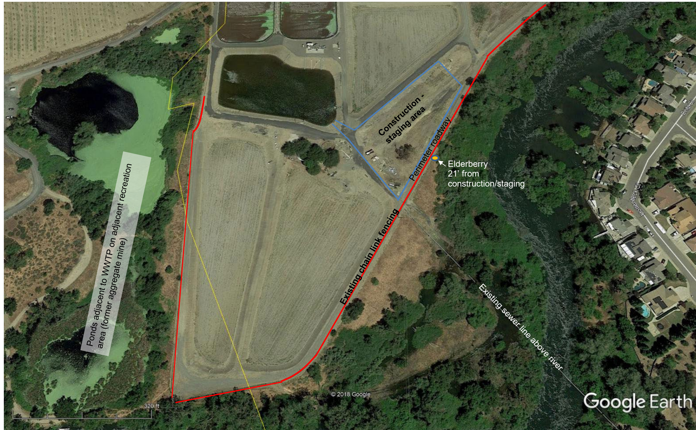
Figure 3: Elderberry Shrub Location