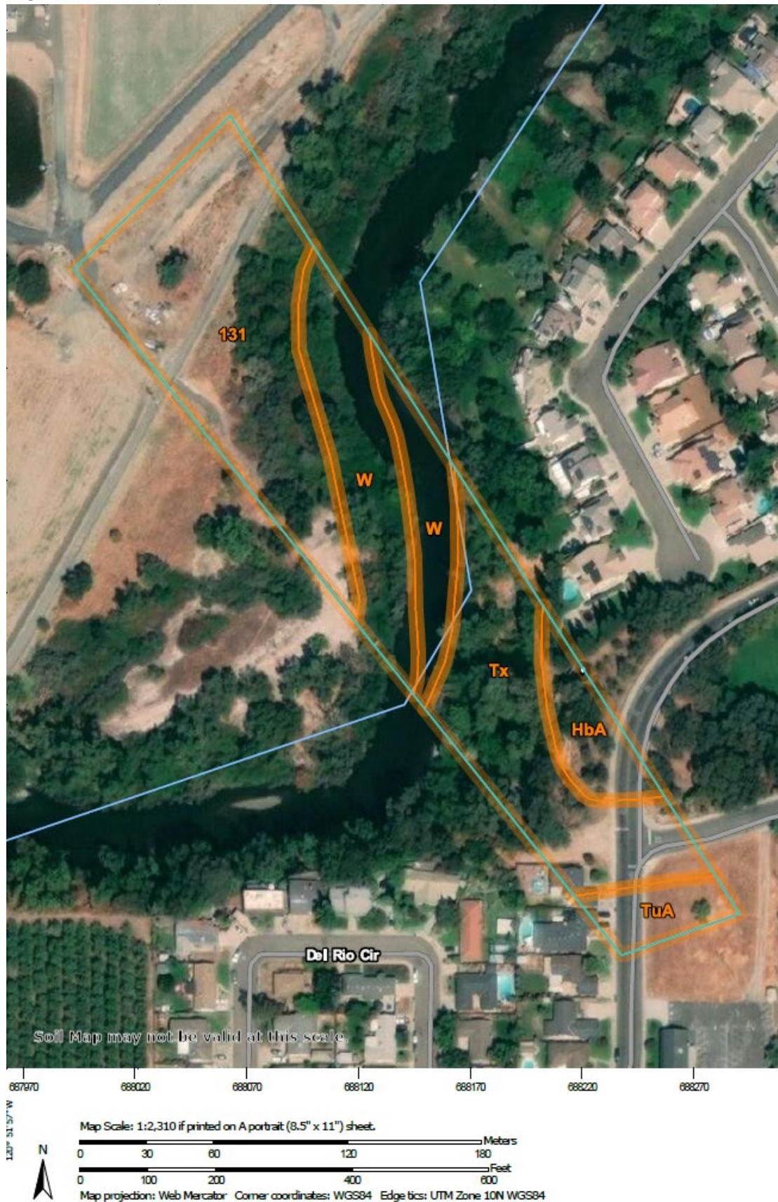
Figure 4: Soil Map (USDA NRCS 2018)