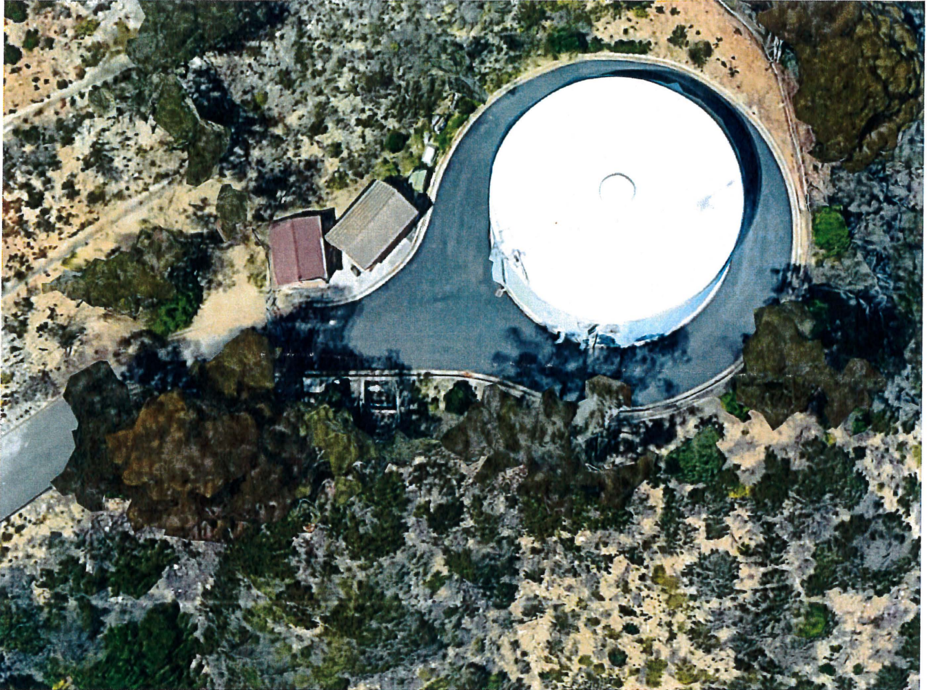
Figure 1. View of Reservoir 2C and paved project work area.