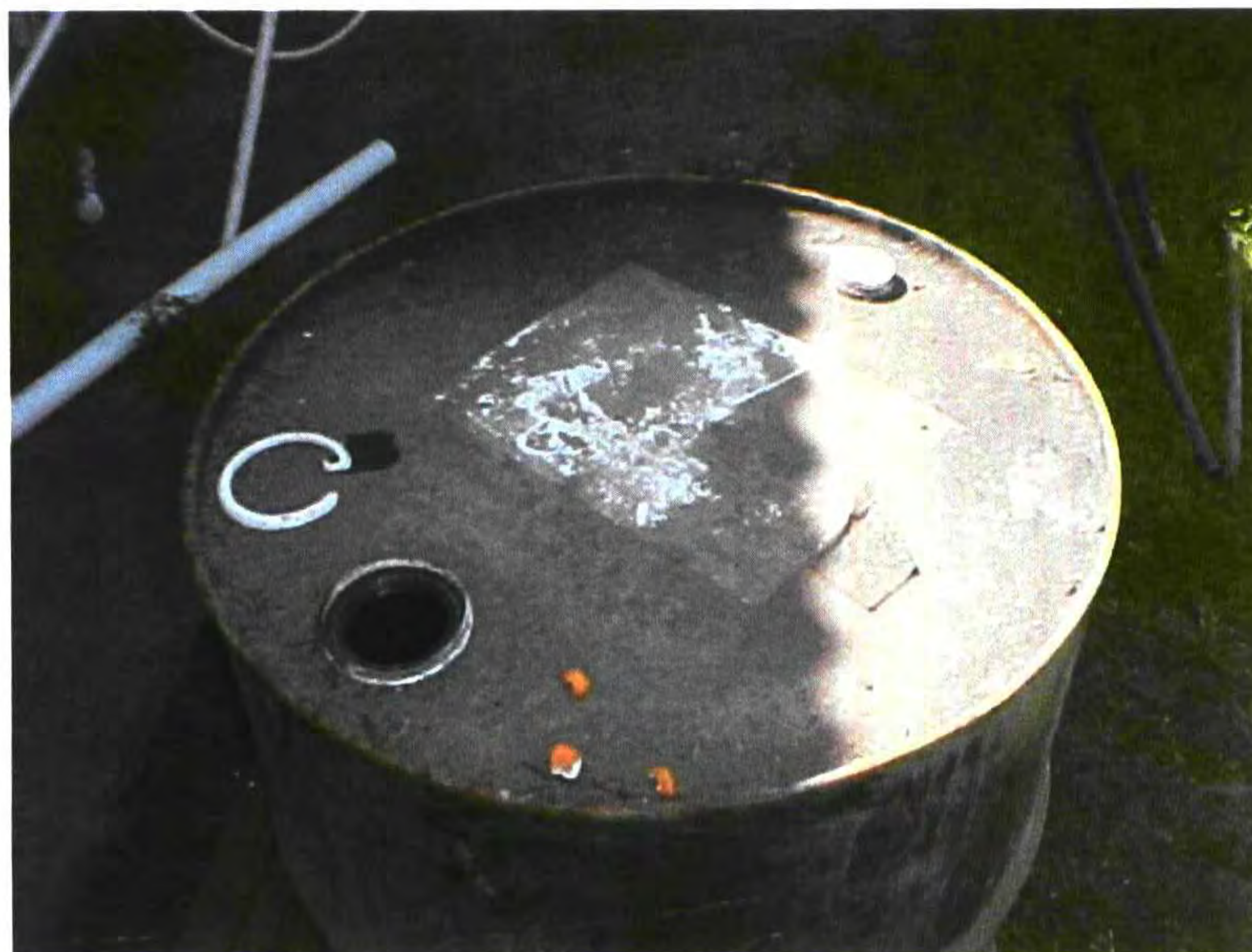
Metal drum containing unknown liquid.

Cottonwood Golf Course; 3121 Willow Glen Drive, El Cajon, 92019 UPFP#: 202521 March 10, 2009