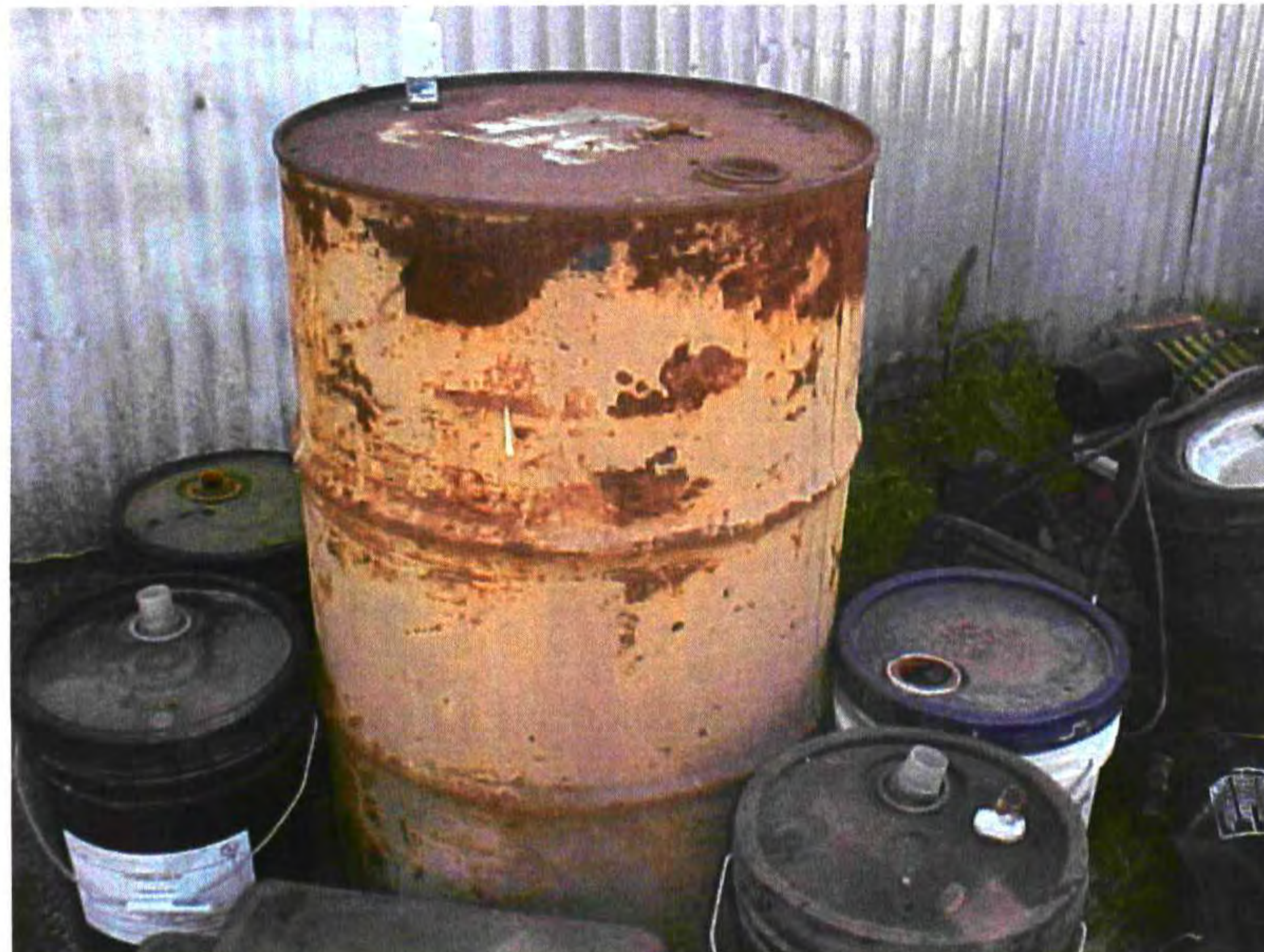
Containers, some empty and some containing varying amounts of unknown liquids.

Cottonwood Golf Course; 3121 Willow Glen Drive, El Cajon, 92019 UPFP#: 202521 March 10, 2009