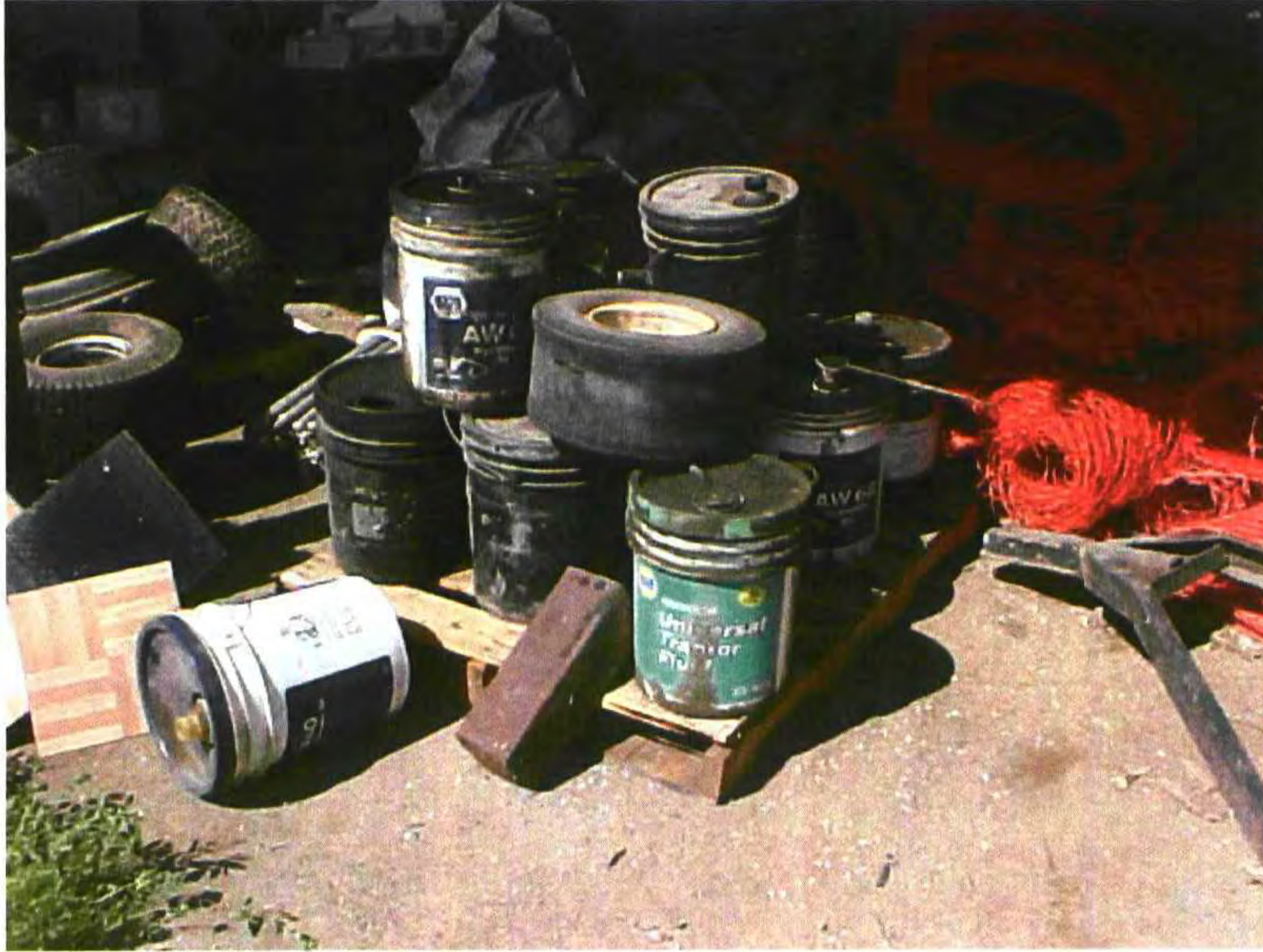
Containers, some empty and some containing varying amounts of unknown liquids. 7

Cottonwood Golf Course; 3121 Willow Glen Drive, El Cajon, 92019 UPFP#: 202521 March 10, 2009