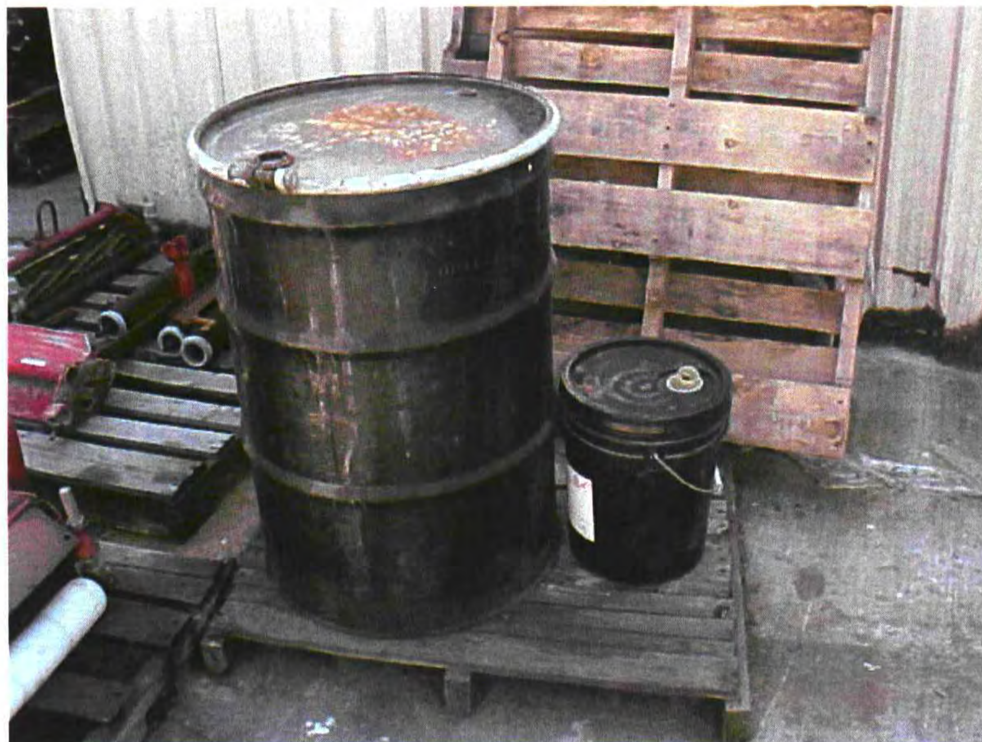
Plastic bucket with unknown liquid and a 55-gallon capacity metal drum containing waste grease from cooking in kitchen. 2

Cottonwood Golf Course; 3121 Willow Glen Drive, El Cajon, 92019 UPFP#: 202521 March 10, 2009