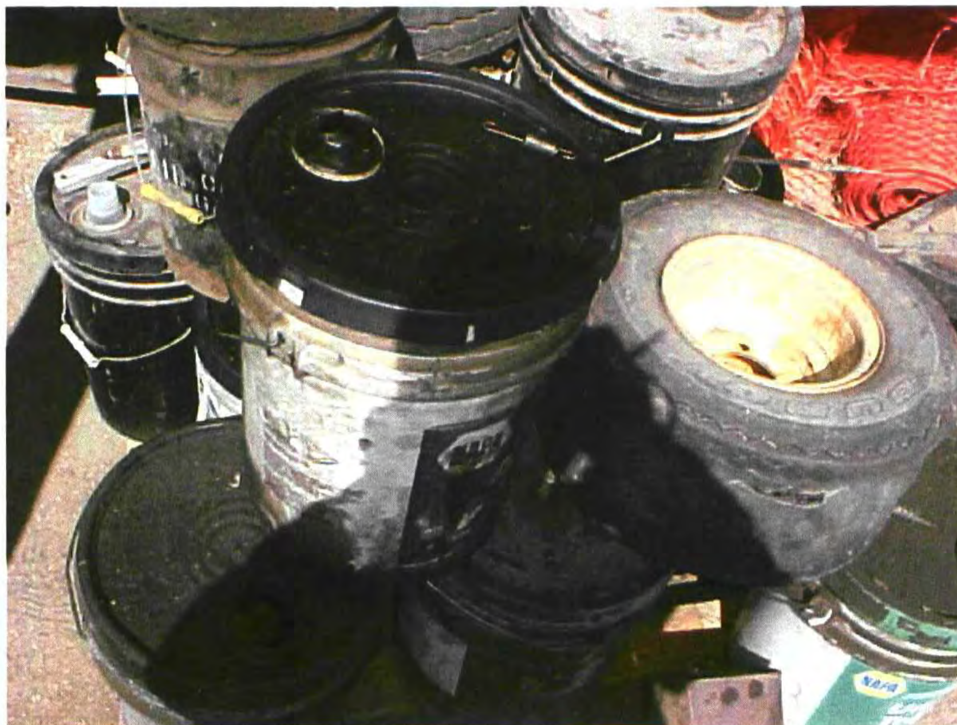
Containers, some empty and some containing varying amounts of unknown liquids. 8

Cottonwood Golf Course; 3121 Willow Glen Drive, El Cajon, 92019 UPFP#: 202521 March 10, 2009