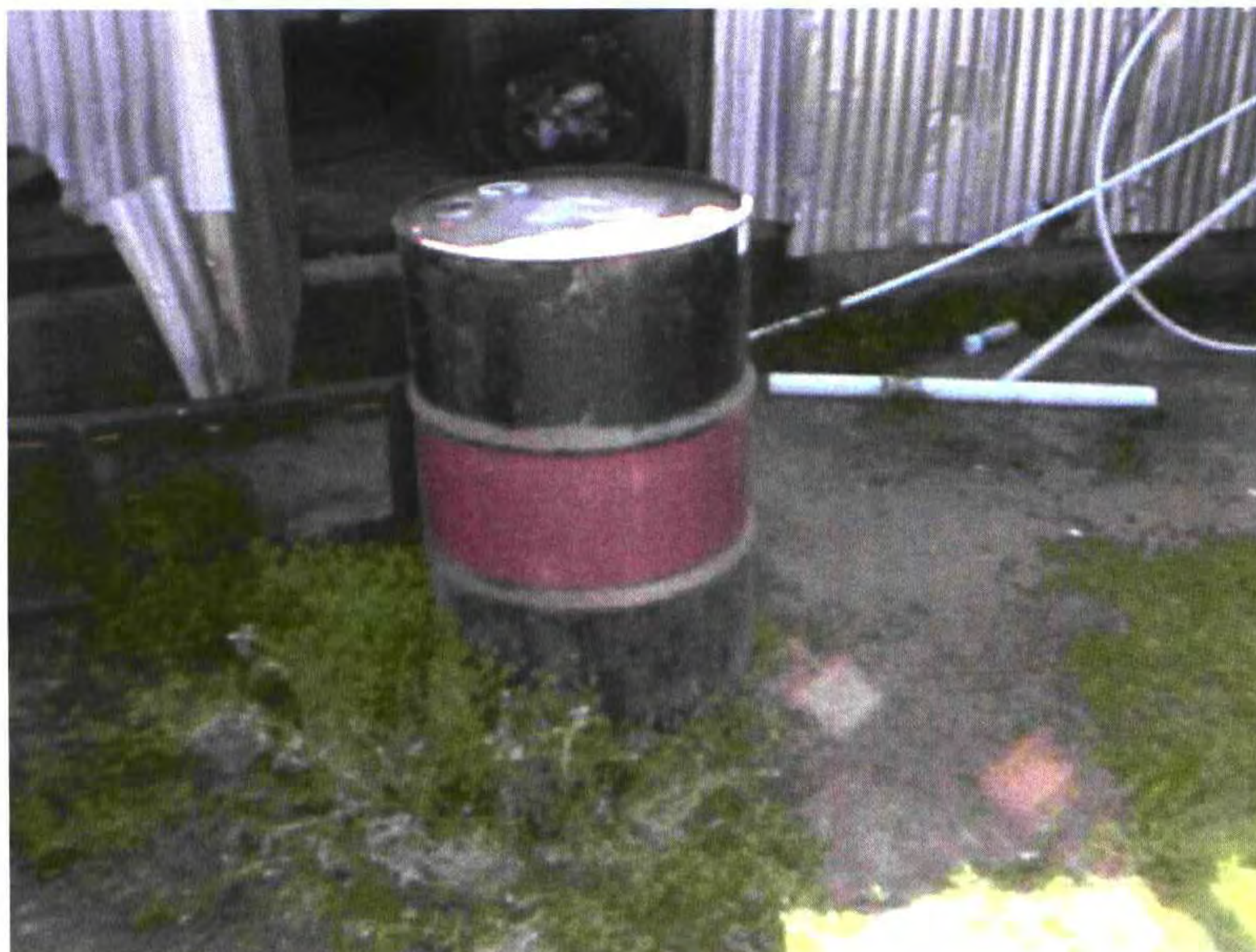
Metal drum containing unknown liquid.

Cottonwood Golf Course; 3121 Willow Glen Drive, El Cajon, 92019 UPFP#: 202521 March 10, 2009