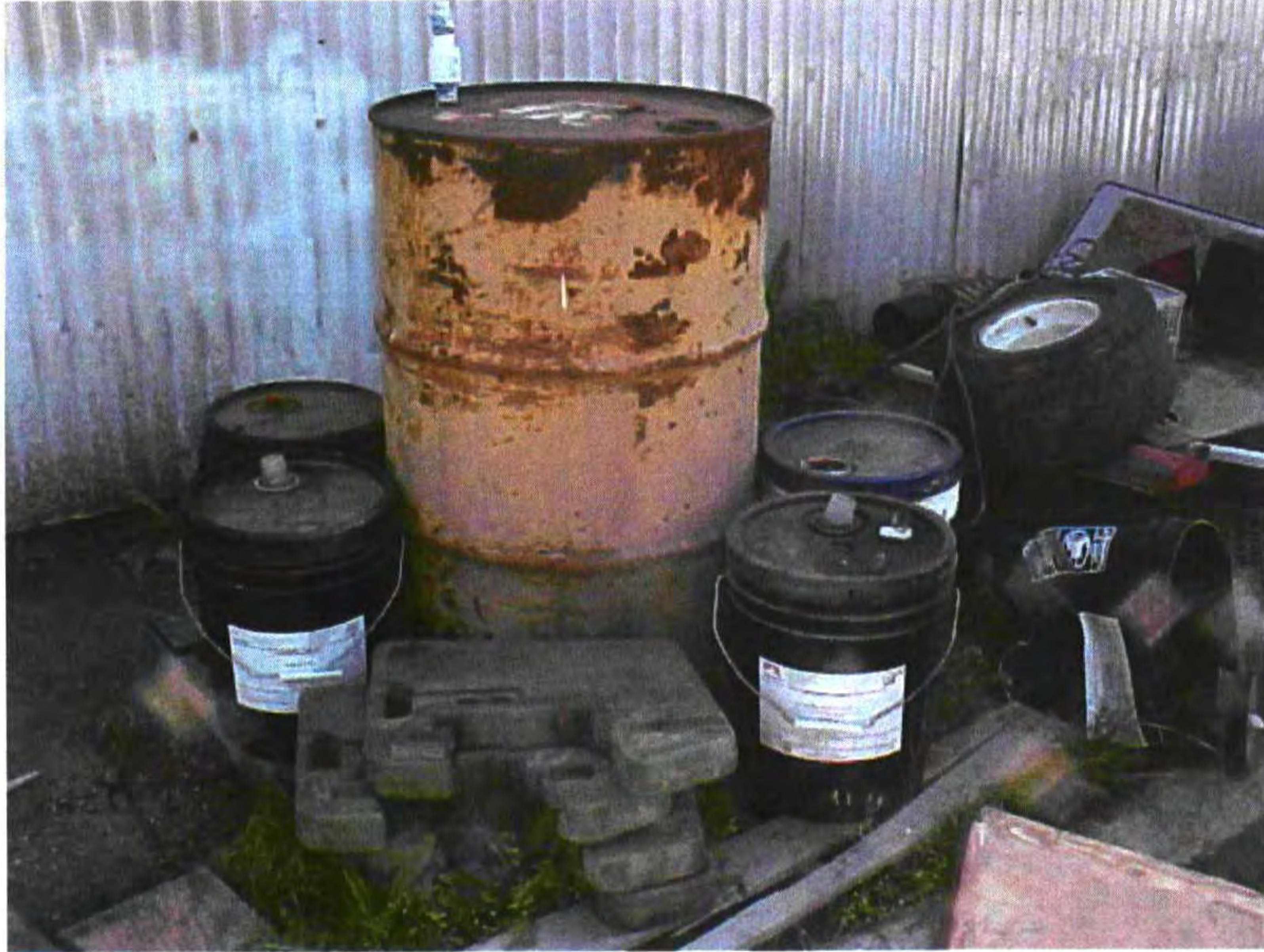
Containers, some empty and some containing varying amounts of unknown liquids.

Cottonwood Golf Course; 3121 Willow Glen Drive, El Cajon, 92019 UPFP#: 202521 March 10, 2009