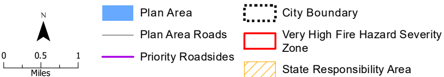
Figure 1. Revised Draft Vegetation Management Plan Area