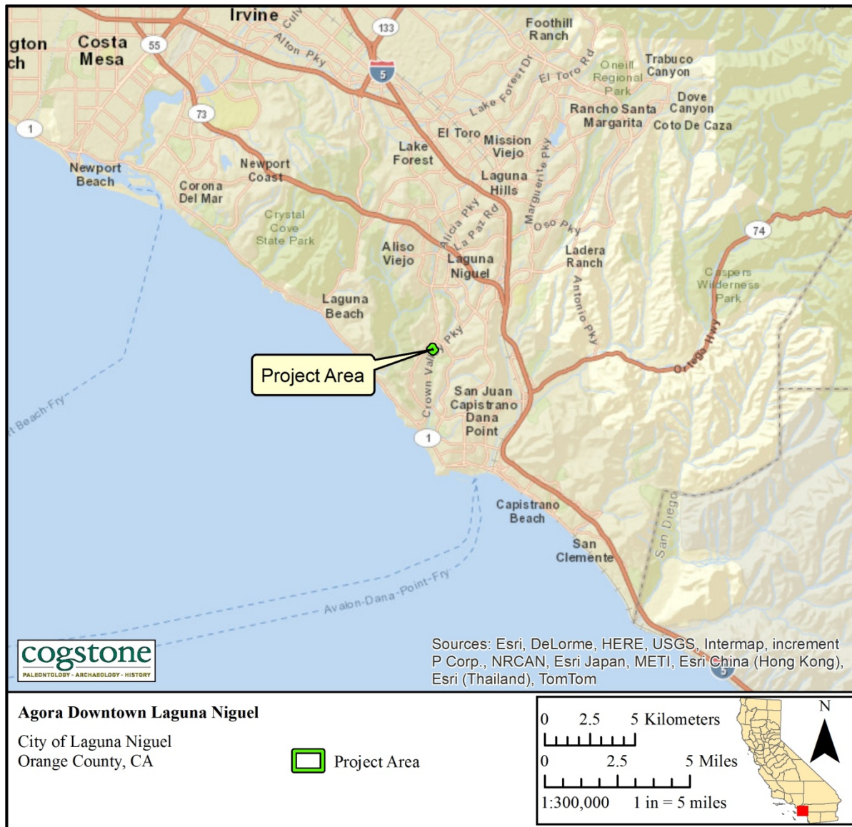
Figure 1. Project Vicinity Map