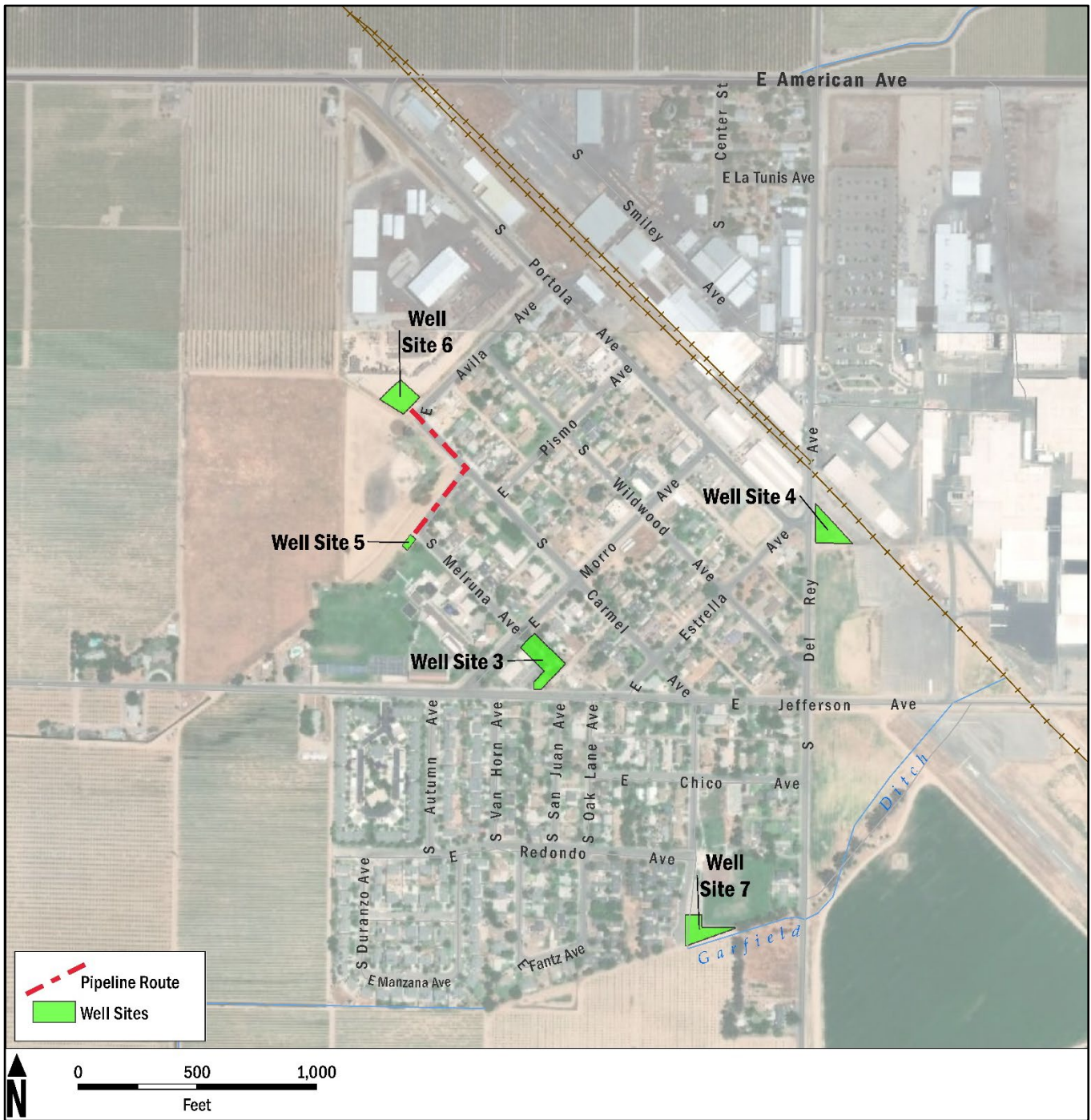
Figure 1: Map of Del Rey showing Existing Well Sites and Proposed Pipeline Route