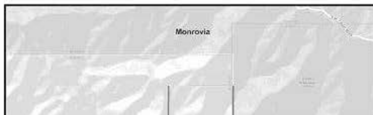
Figure A PROJECT LOCATION

Bradbury City Hall 600 Winston Avenue Bradbury, CA 91008