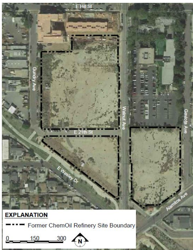
Figure 1: Site Map

At sites contaminated with volatile chemicals, human exposure to contaminants may occur via vapor intrusion. Soil vapor intrusion happens when small amounts of contaminants in soil vapor migrate from below the ground surface into overlying buildings (Figure 2).