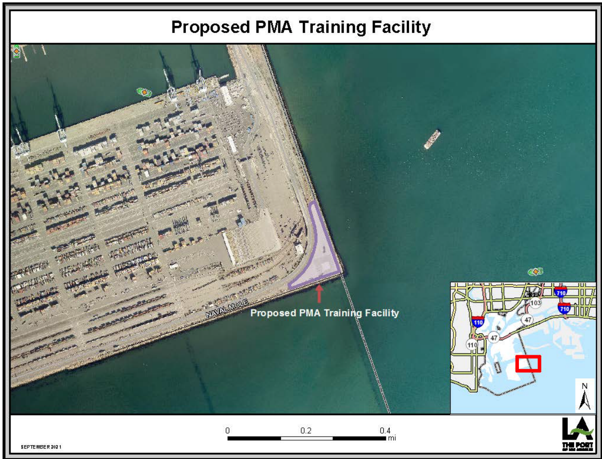
Figure 2 –Proposed PMA Project Area