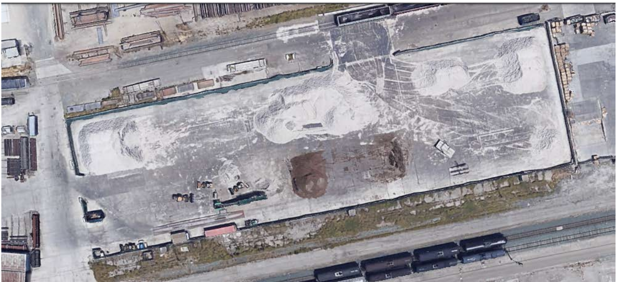
Photograph 1 Aerial Photograph of CVAG Facility