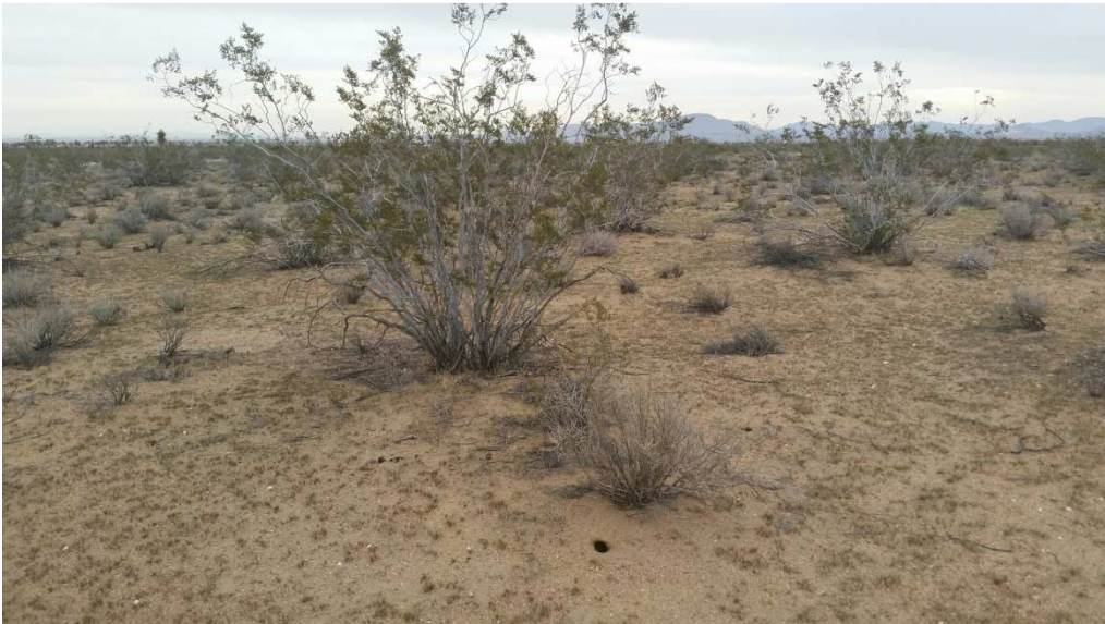
View of sparse Creosote Scrub with Ground Squirrel Burrow