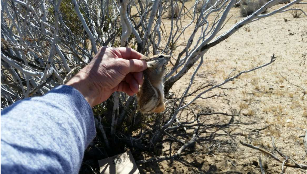
Antelope Ground Squirrel Captured on Site