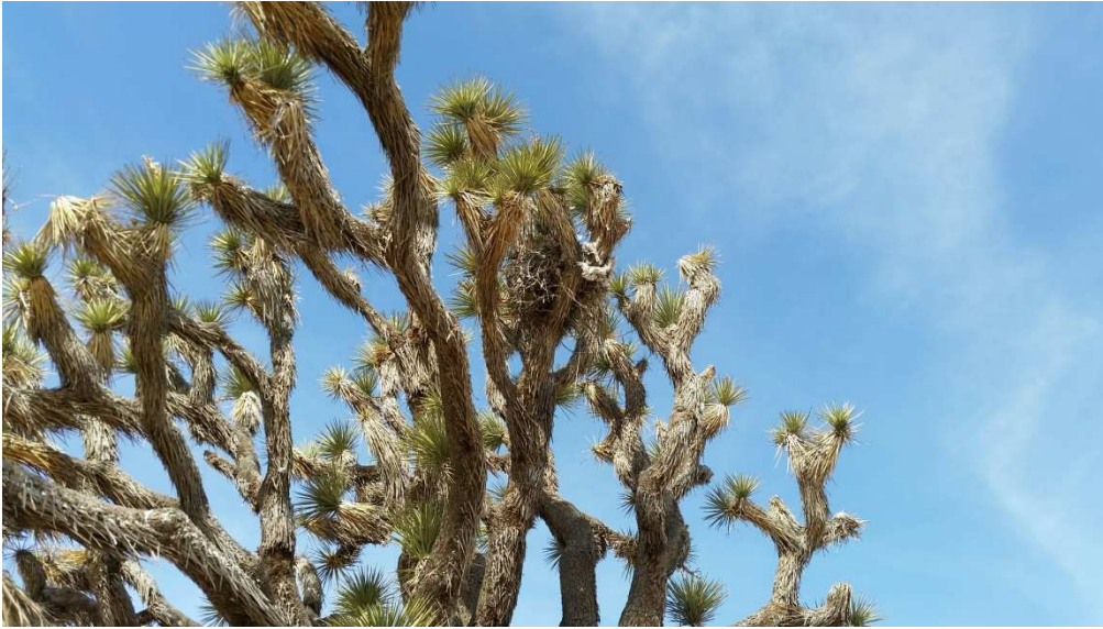
Joshua Tree on Site with Raven's Nest