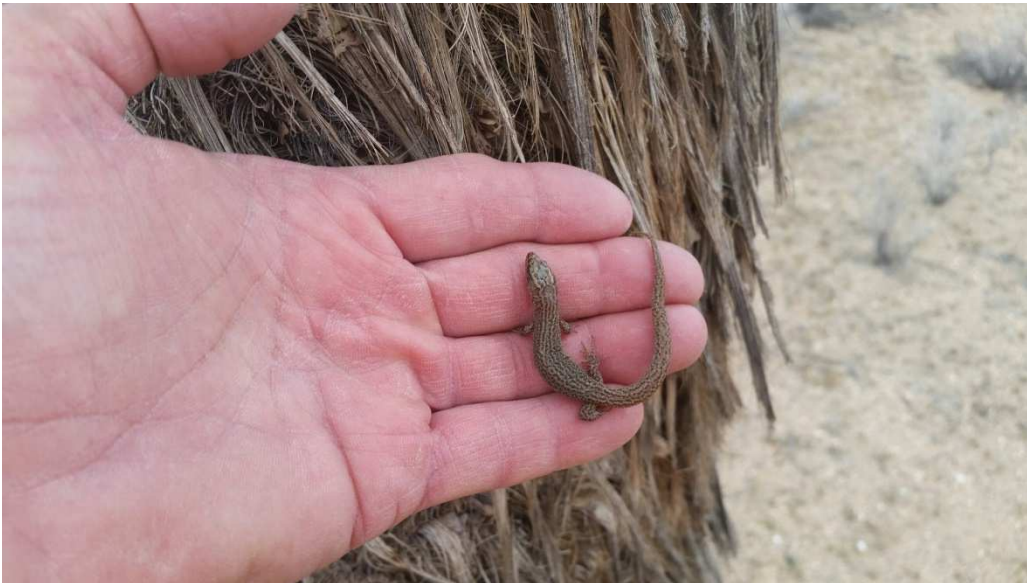
Night Lizard at Base of Joshua Tree on Site