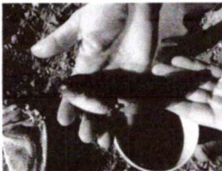
This is a photo of a Bullfrog tadpole. (Photo taken by Mike van Hattem).