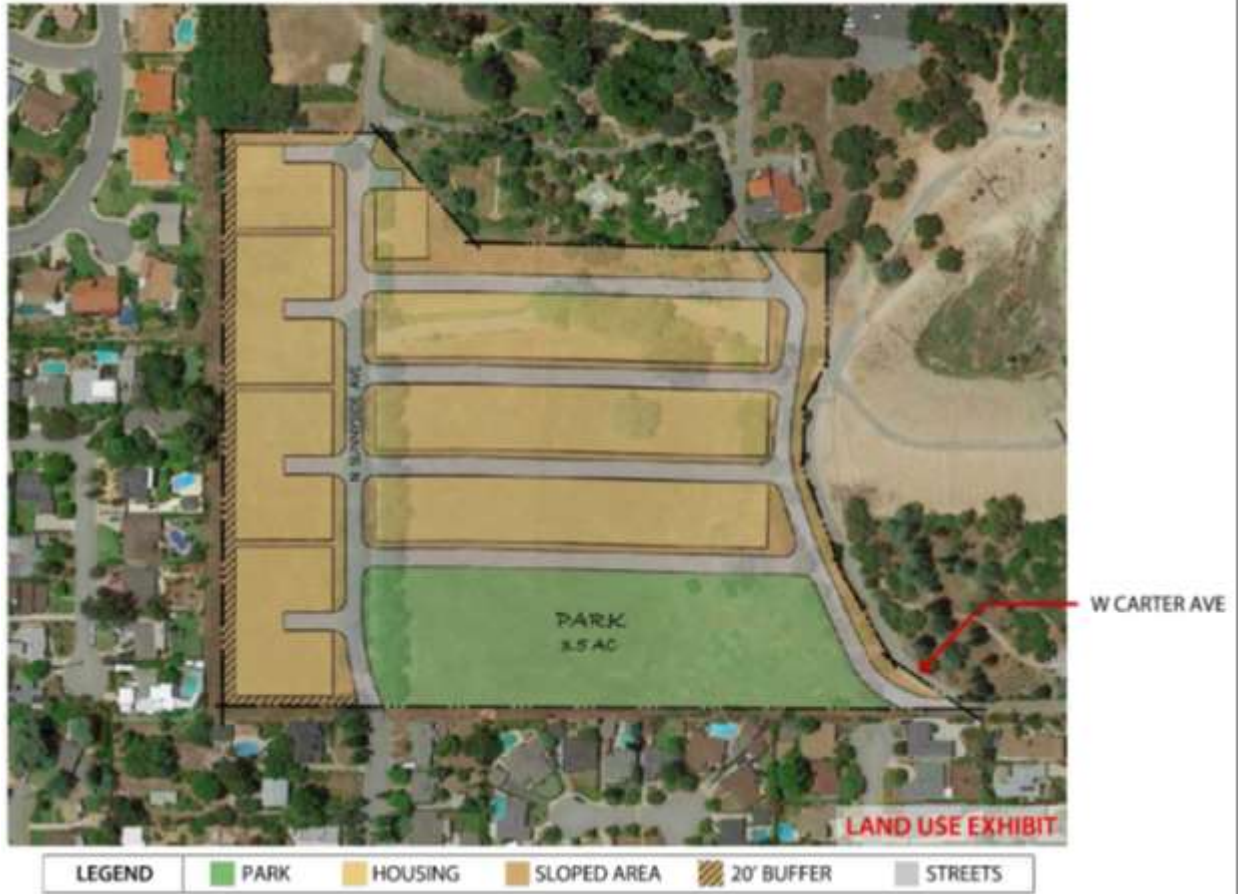
EXHIBIT B - PROJECT CONFIGURATION