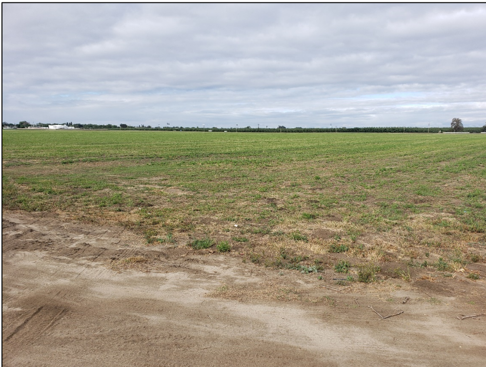
Figure 3. Overview of Project area after harvest at time of survey looking southwest.