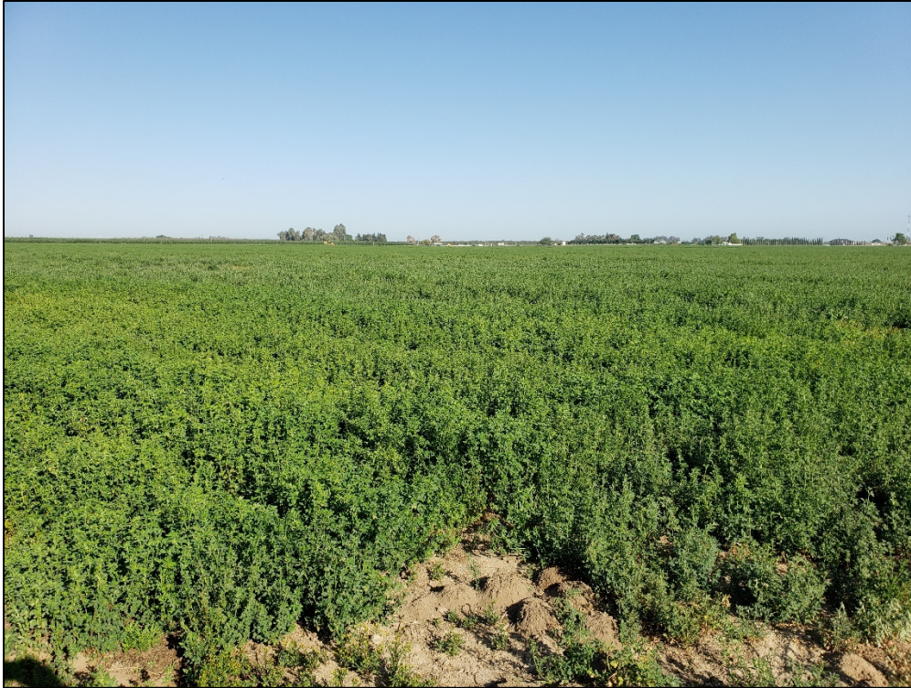
Figure 2. Overview of Project area before harvest looking northwest.