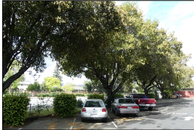
Photo 4. Coast live oak trees. Left: tree #139 was 24 in. and in good condition, located on the south side of the site. Above: trees #142 – 147 were between the existing parking lot and the Lawrence Expressway.

Trees #142 – 147 and 149 were located at the north end of the site (Photo 4). Trees #142 – 147 for a long row at the edge of the existing parking lot and parallel to the Lawrence Expressway. Trees were mature in development with trunk diameter between 18 and 24 in. On the east, tree crowns had been lifted to provide clearance for parking. On the west, crown size had been controlled in order to provide clearance to nearby overhead electrical lines. Tree condition was either good (5 trees) or fair (2). Coast live oak #149 was 11 in., located at the very north end of the site. Condition was fair.