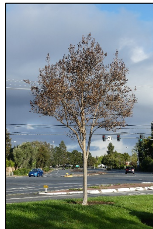
Photo 5. Typical crape myrtle tree. Trees of this species lacked vigor, likely due to drought stress.

Sixteen (16) crape myrtles were located in a planting strip along Quito Road (Photo 5). Trees were 2 to 4 in. in diameter and semi-mature in development. Tree condition was generally fair (12 trees) while four trees were in good condition. All crape myrtles lacked vigor which was most likely due to stress during recent periods of drought.