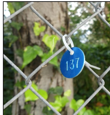
Photo 1. Trees along the south property line were behind a fence. The tree tag was attached to the fence rather than the trunk.

Some trees could not be directly accessed. Trees #123 – 130, 132 – 135, and 137 – 140 were located behind the fence on the south side of the site. Because trees could not be directly accessed, tags were attached to the fence (Photo 1). Chinese pistache #155 – 158 were located off-site and were not tagged. Information was recorded and the tree location recorded on a map.