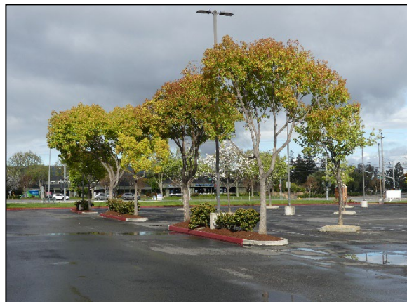
Photo 3. Typical camphor trees. Note variability in size and form.

Thirty-two (32) camphor trees were also located in the large parking lots, usually at the end of travel lanes (Photo 3). The size of the planter varied. Turf and ground cover plants were commonly present. Camphors were young and semi-mature in development. Trunk diameters ranged from 2 to 15 in. Approximately 70% of camphors were 9 in or less in diameter.