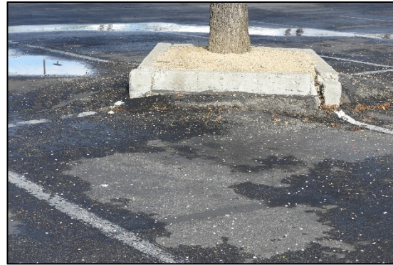
Photo 2. Most Callery pear trees were installed in 4 ft. by 4 ft. cutouts in the central parking area. Left. The typical pear had multiple stems that arose at one point on the trunk. Above: roots from some pears had severely displaced nearby pavement.

Thirty-two (32) camphor trees were also located in the large parking lots, usually at the end of travel lanes (Photo 3). The size of the planter varied. Turf and ground cover plants were commonly present. Camphors were young and semi-mature in development. Trunk diameters ranged from 2 to 15 in. Approximately 70% of camphors were 9 in or less in diameter.