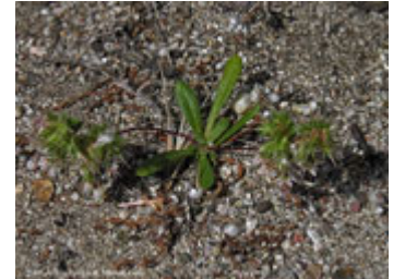
2012 Anuja Parikh and Nathan Gale

Nasturtium gambelii Gambel's water cress Brassicaceae perennial rhizomatous herb Apr-Oct 1B.1 S1 G1