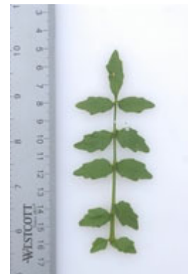
2010 Chris Winchell

Nasturtium gambelii Gambel's water cress Brassicaceae perennial rhizomatous herb Apr-Oct 1B.1 S1 G1