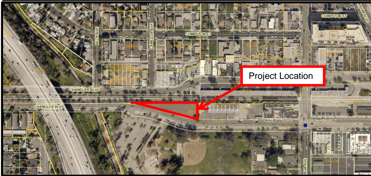
Figure 1 Project Site Location Map