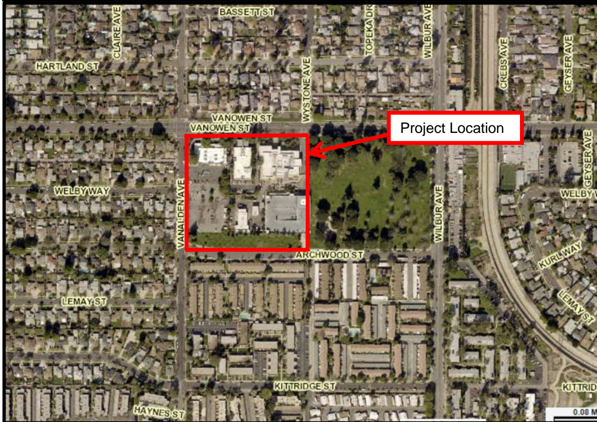
Figure 1 Project Site Location Map