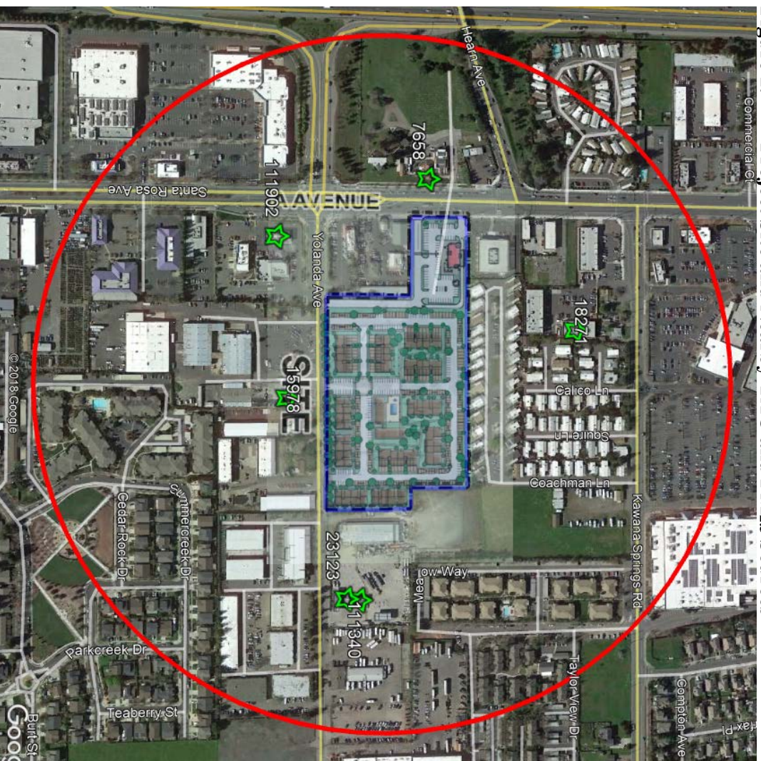
Figure 1. Project Site and Nearby TAC and PM 2.5 Sources