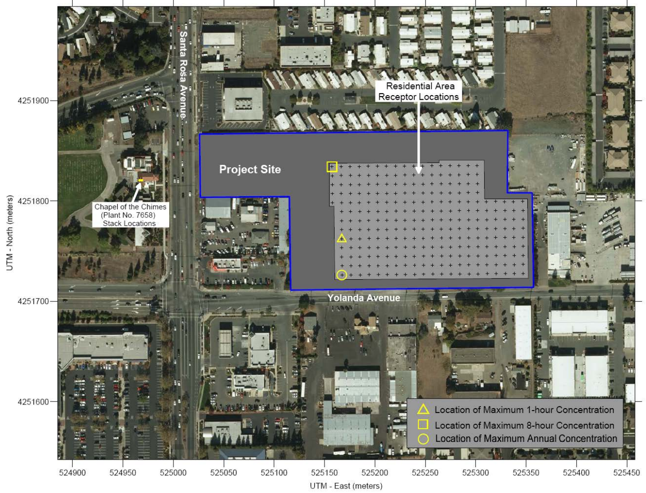
Figure - Project Site, Chapel of the Chimes, On-site Receptors, and Locations of Maximum TAC Concentrations from Chapel of the Chimes