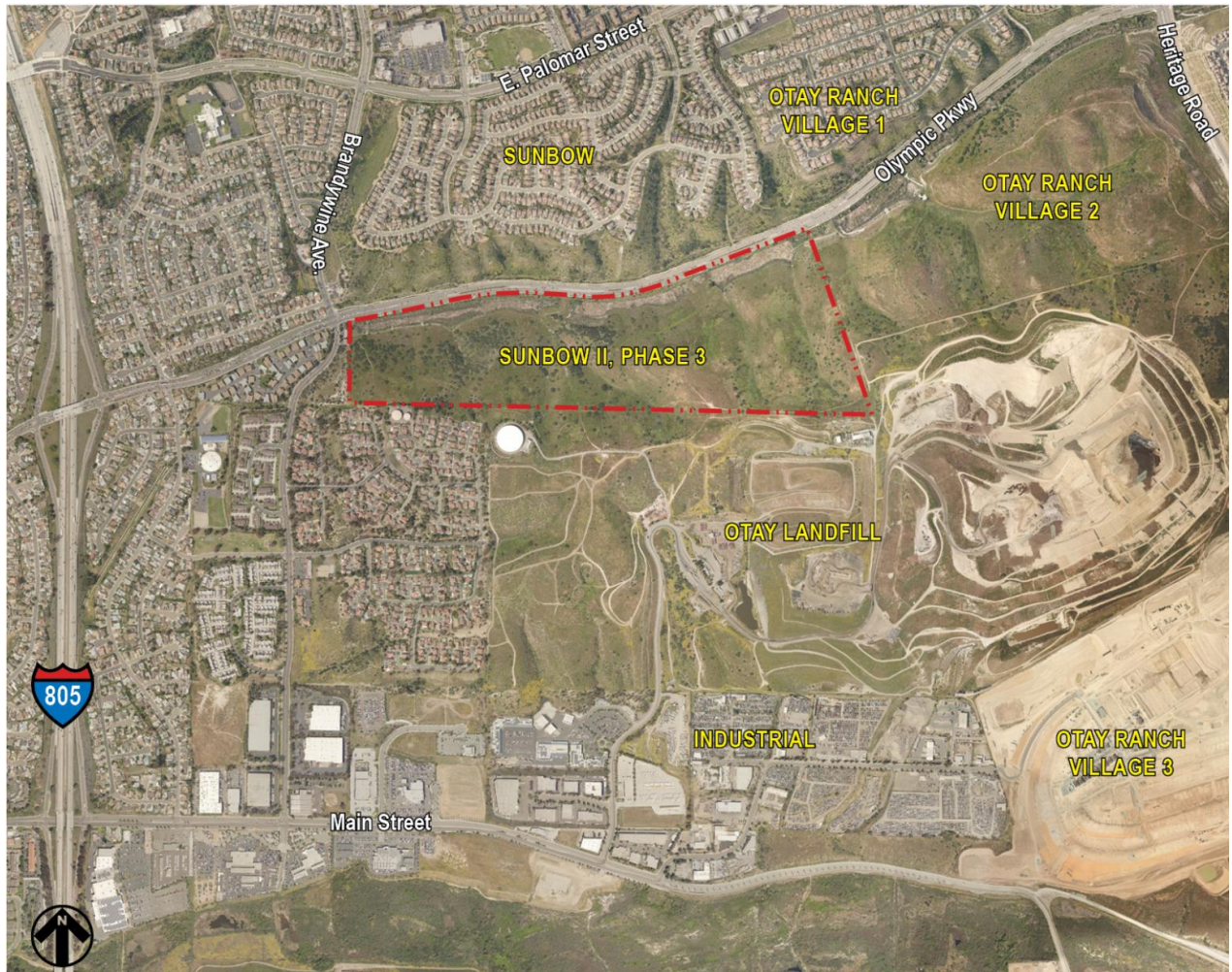
Figure 1 Project Location