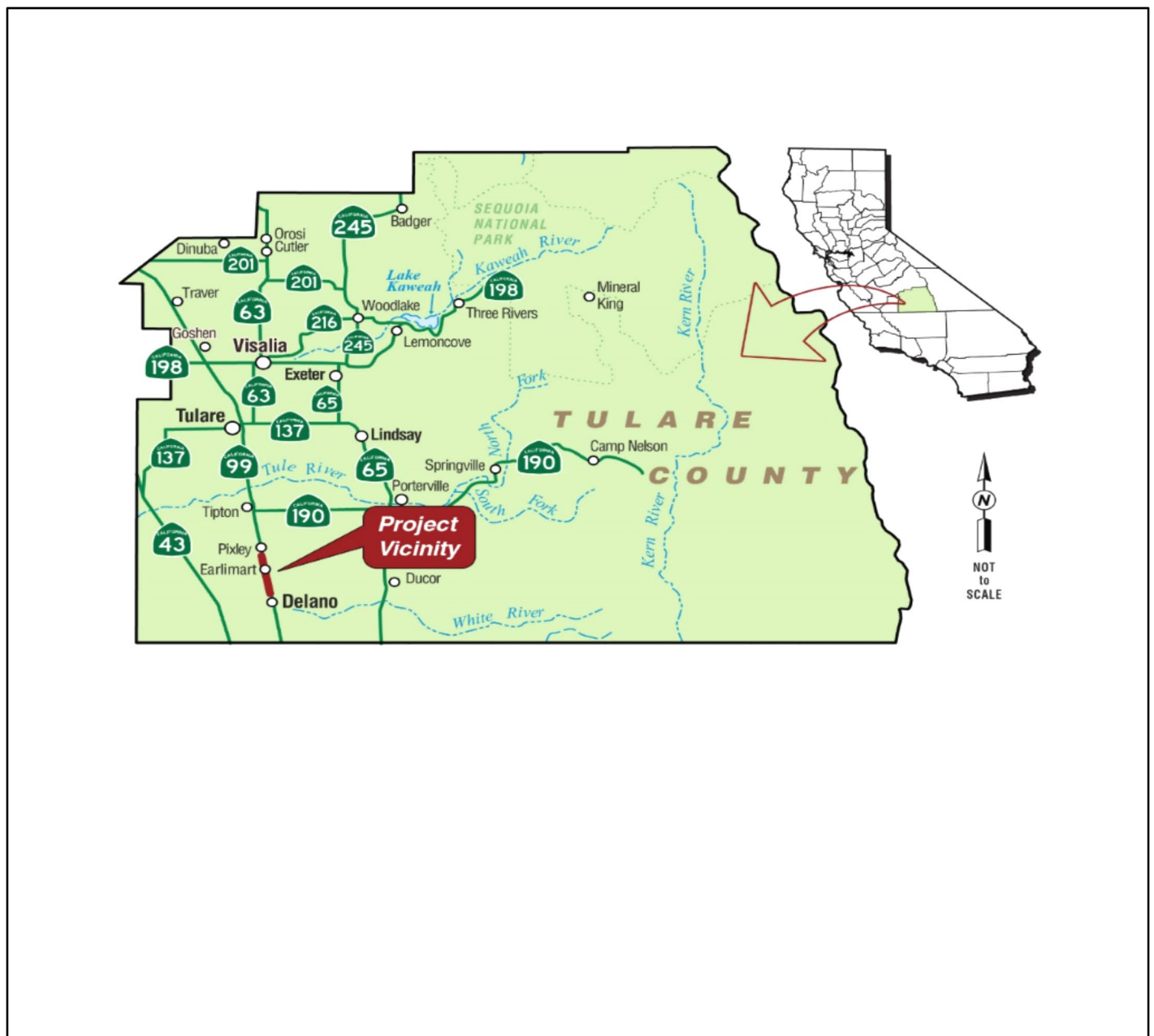
Figure 1: Regional Location Map