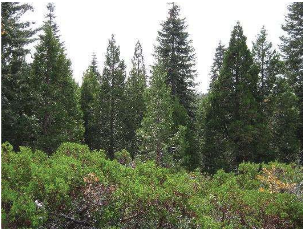
Figure 5&6. Photos showing stands with heavy fuel loading on SCE lands