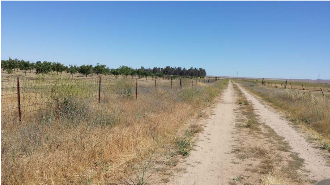
Photo 8. Access road to the proposed cultivation area on 8710 Carrisa Highway that would be improved. The area on the left is Annual Grassland, dominated by non-native weedy species that are adapted to the regular cycle of disturbance from farming activities.