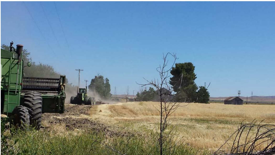
Photo 6. View across the proposed cultivation area on 11330 Tule Elk Lane. The trees and barns in the distance are outside of the project footprint. Farm operations were harvesting the grain field at the time the survey was conducted.