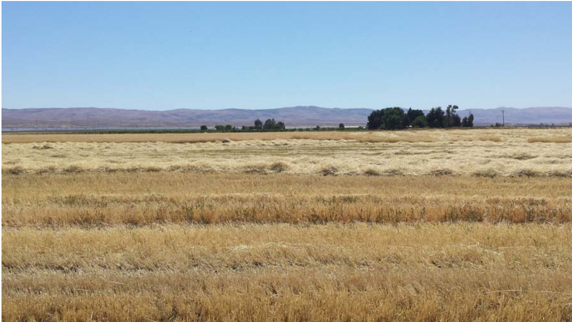
Photo 1. Easterly view across the proposed cultivation site on 11525 Tule Elk Lane. The Dryland Grain Crop habitat type was present across the project footprint, and consisted of oats.