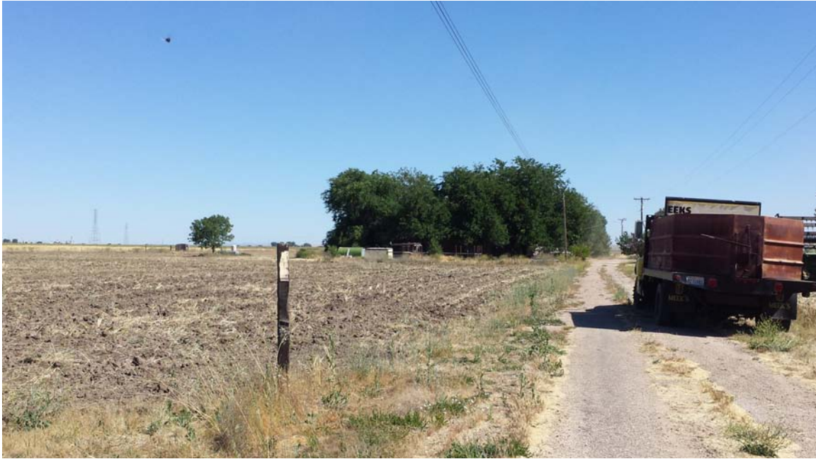
Photo 5. Northerly view of the access road that would be improved for the cultivation area on 11330 Tule Elk Lane. The water line would be run underground in front of the stand of trees, which are ornamental species surrounding a residence.