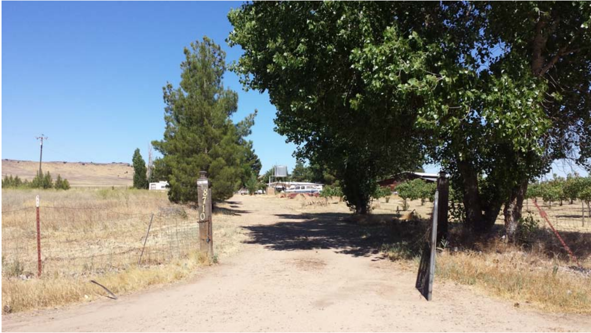
Photo 9. The waterline for the proposed cultivation area on 8710 Carrisa Highway would run down the middle of this driveway and connect to an existing well. This habitat type was considered Urban/Developed.