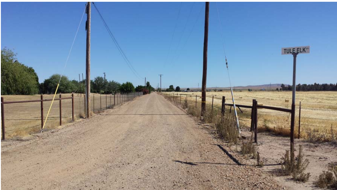
Photo 2. Access to the three cultivation areas on Tule Elk Lane would be improved, as necessary. This part of the road, at the junction with Carissa Highway (58), may already meet the requirements for the planned 16-foot wide aggregate base access road.