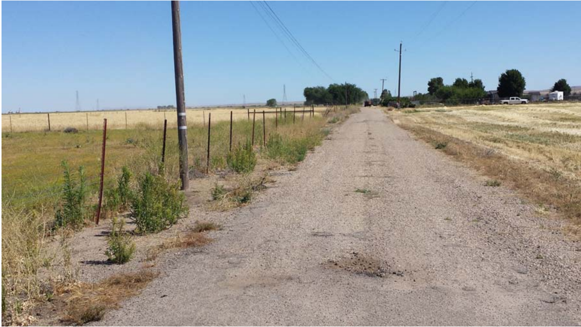
Photo 3. View of the mid-portion of Tule Elk Lane, looking north. This portion of the road would be improved to provide access to 11520 and 11330 Tule Elk Lane and water lines run in a trench along the right side of the road in disturbed areas.