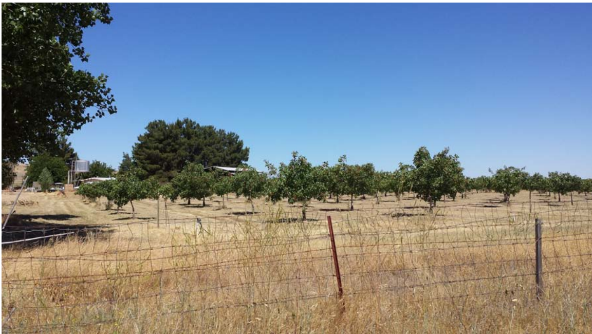
Photo 10. The waterline for the 8710 Carrisa Highway project would run along the edge and then cross through this existing orchard. The access road would cross over a small margin of mowed Annual Grassland, such as depicted here on the opposite side of the fence, and then cross Deciduous Orchard habitat.