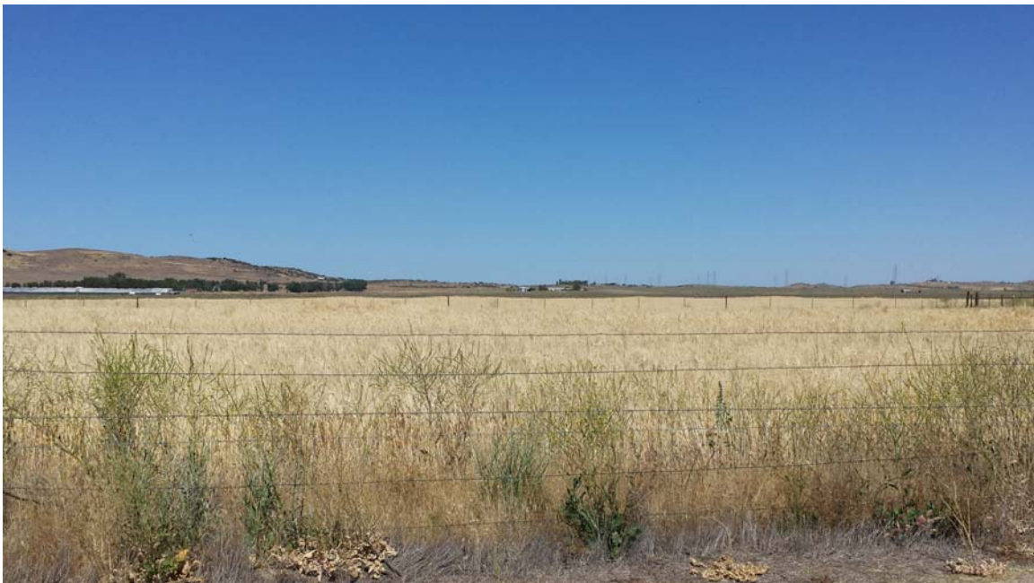
Photo 4. Westerly view across the proposed cultivation area at 11520 Tule Elk Lane. Dryland Grain Crops occupied the project footprint. The water line would come from Tule Elk Lane and cross this habitat type that has been disked and farmed for a number of years.