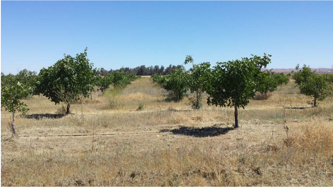
Photo 7. Northerly view across the proposed cultivation area on 8710 Carrisa Highway. The habitat type is Deciduous Orchard, consisting of pistachio trees. The impact area would be located almost entirely within the existing orchard, except for a small sliver in the northwest corner, which is mowed Annual Grassland.