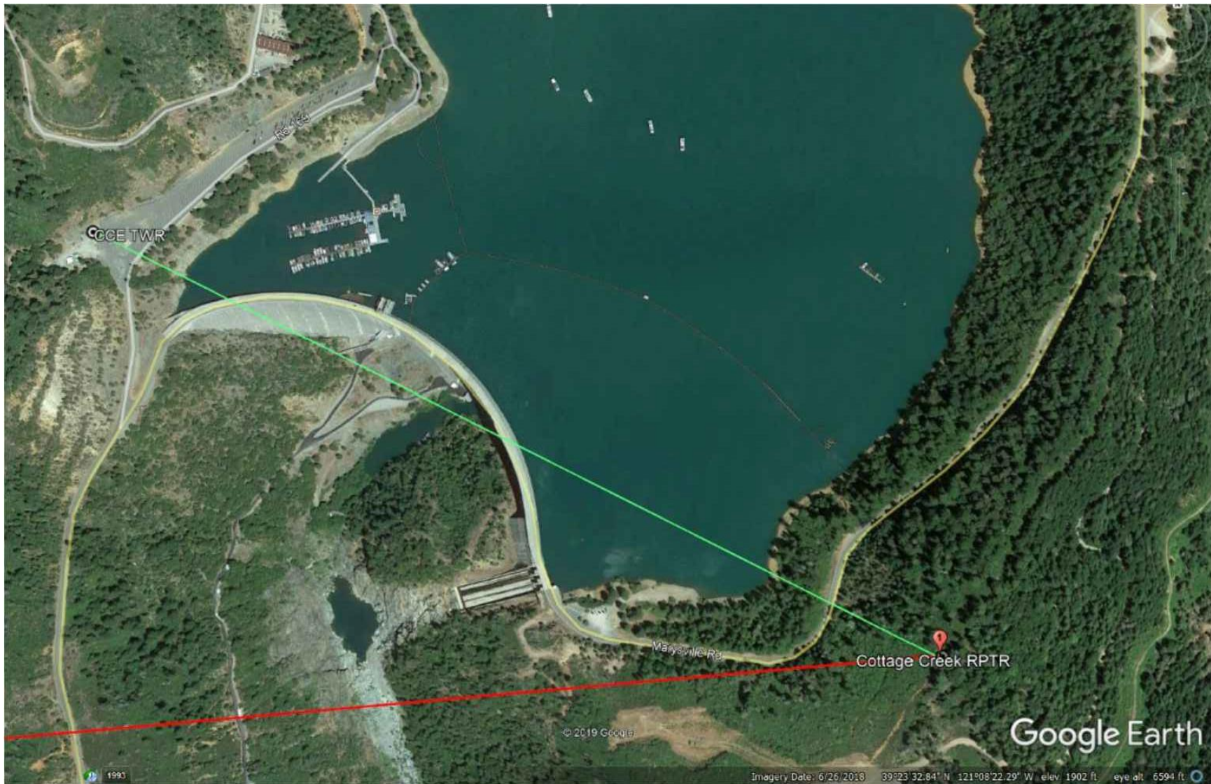
Figure 2. Cottage Creek Microwave Tower Installation Project Project Location Map, including the microwave tower and passive repeater sites.